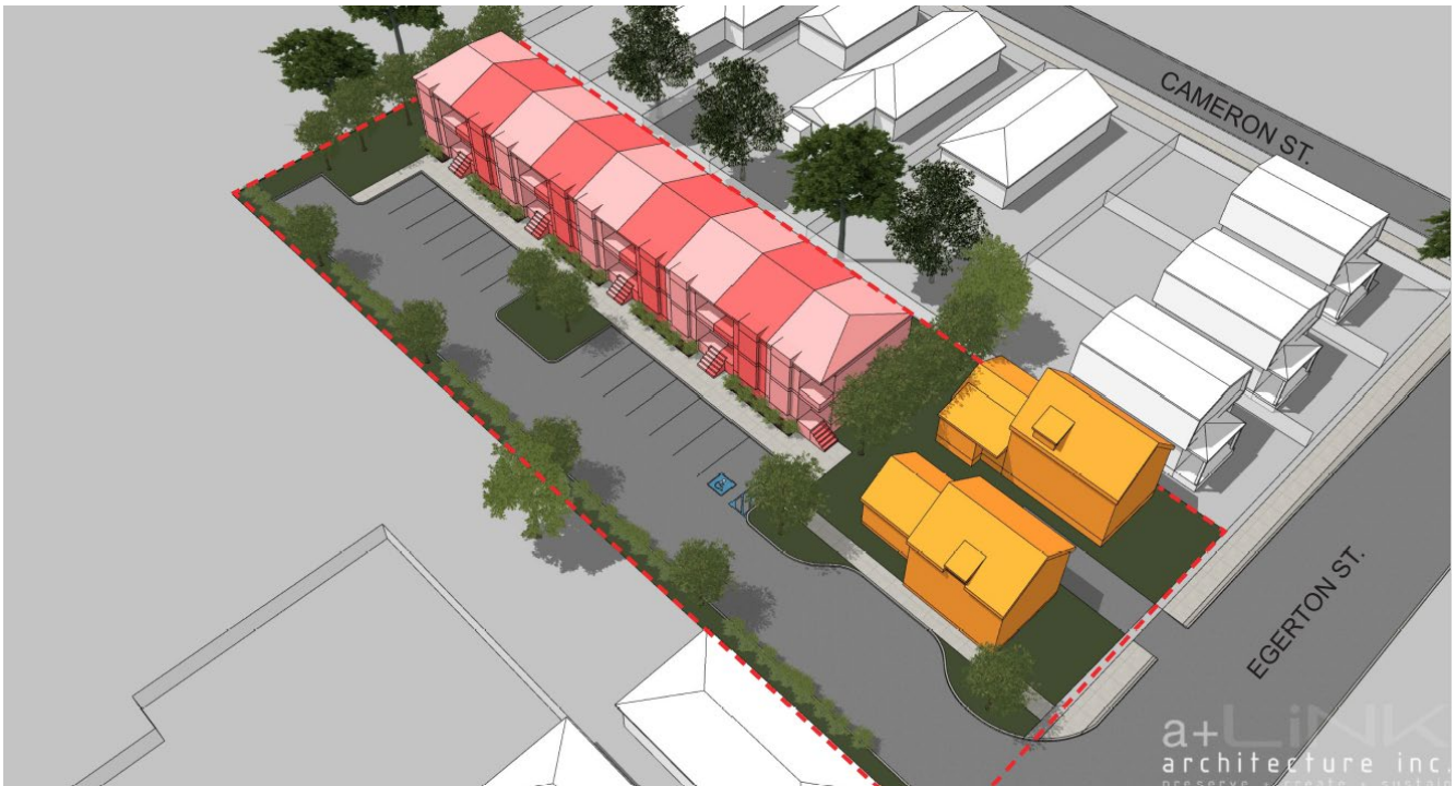
Aerial Massing Diagrams

The above images represent the applicant's proposal as submitted and may change.