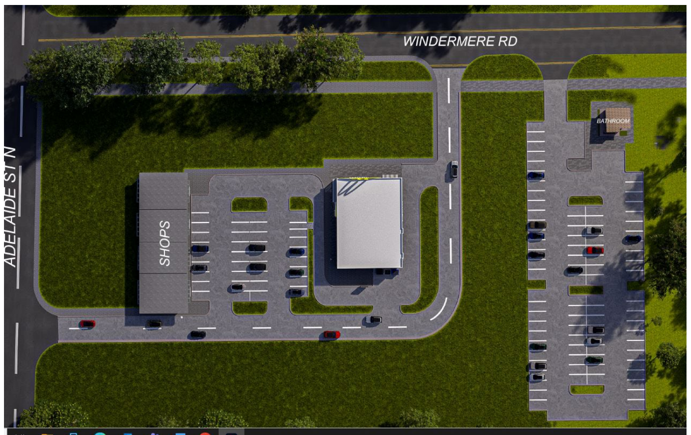
Rendering of site plan