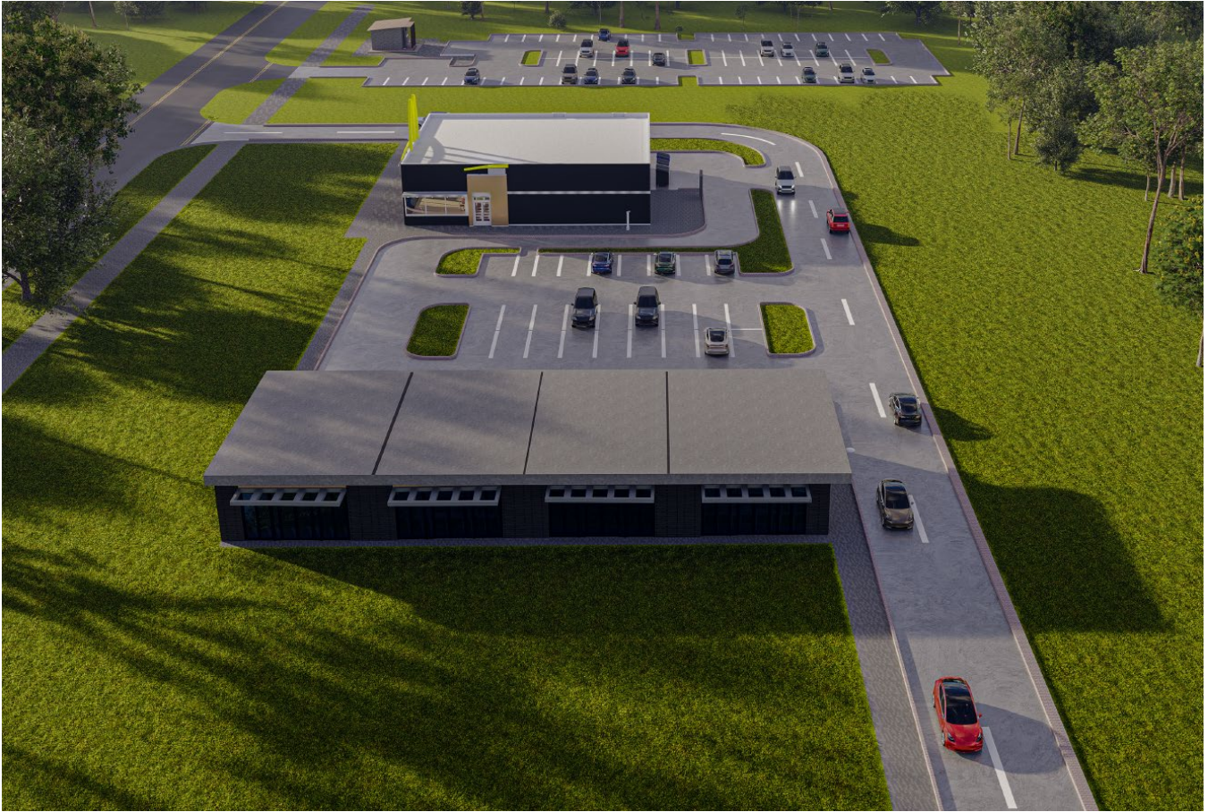
Site Rendering looking east from Adelaide Street

The above images represent the applicant's proposal as submitted and may change.