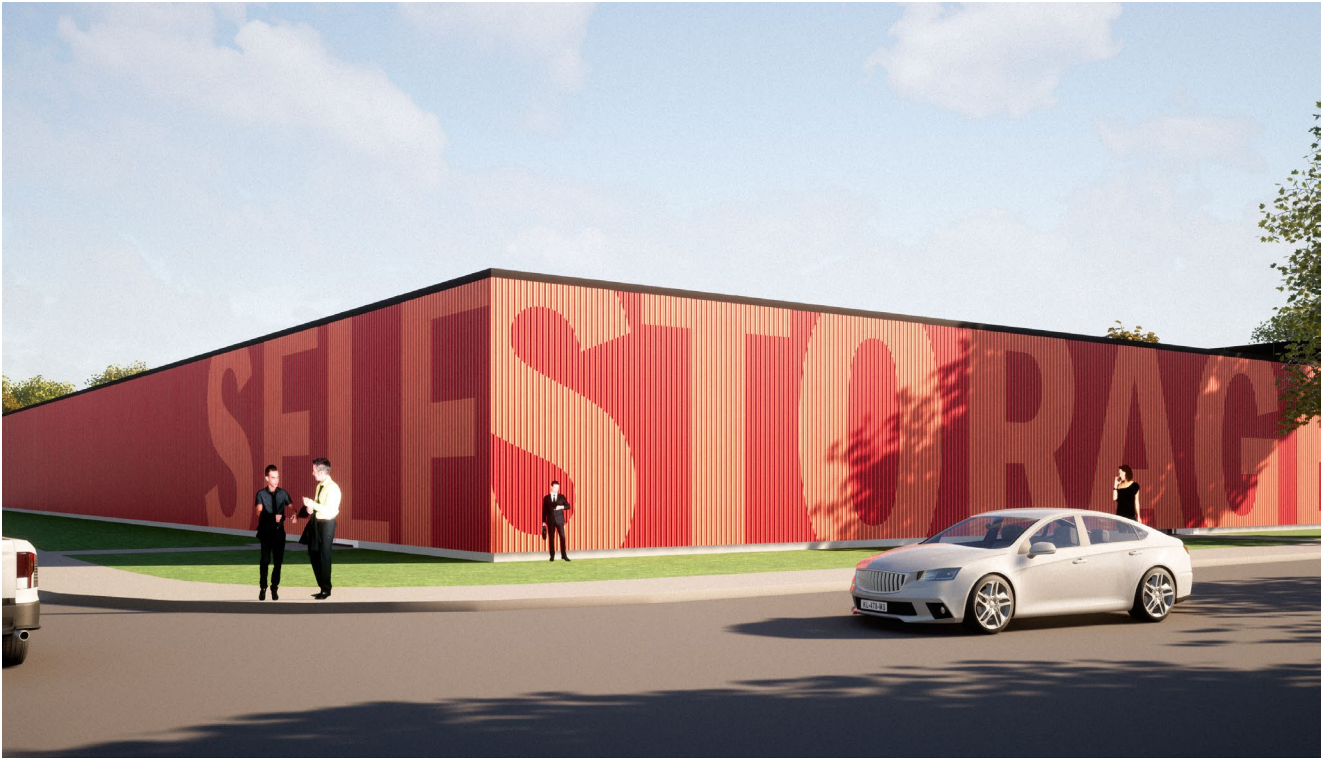
Conceptual Rendering (looking southwest from Brydges Street and Highbury Avenue N)

The above images represent the applicant's proposal as submitted and may change.