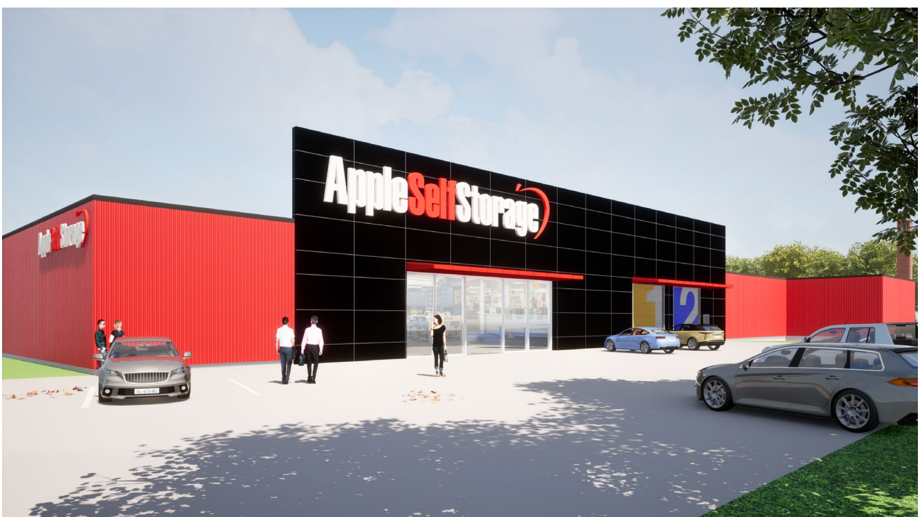
Conceptual Rendering (Brydges Street looking southeast towards retail entrance and loading)