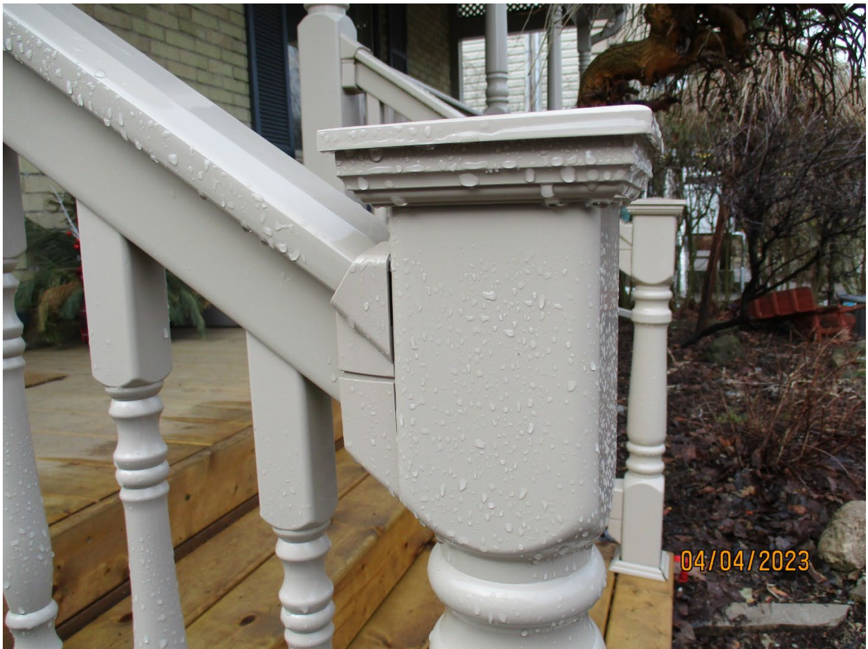
Image 6: Photograph showing detail of the vinyl (plastic) porch materials used for the replacement of the porch at 27 Bruce Street within the Wortley Village-Old South Heritage Conservation District.