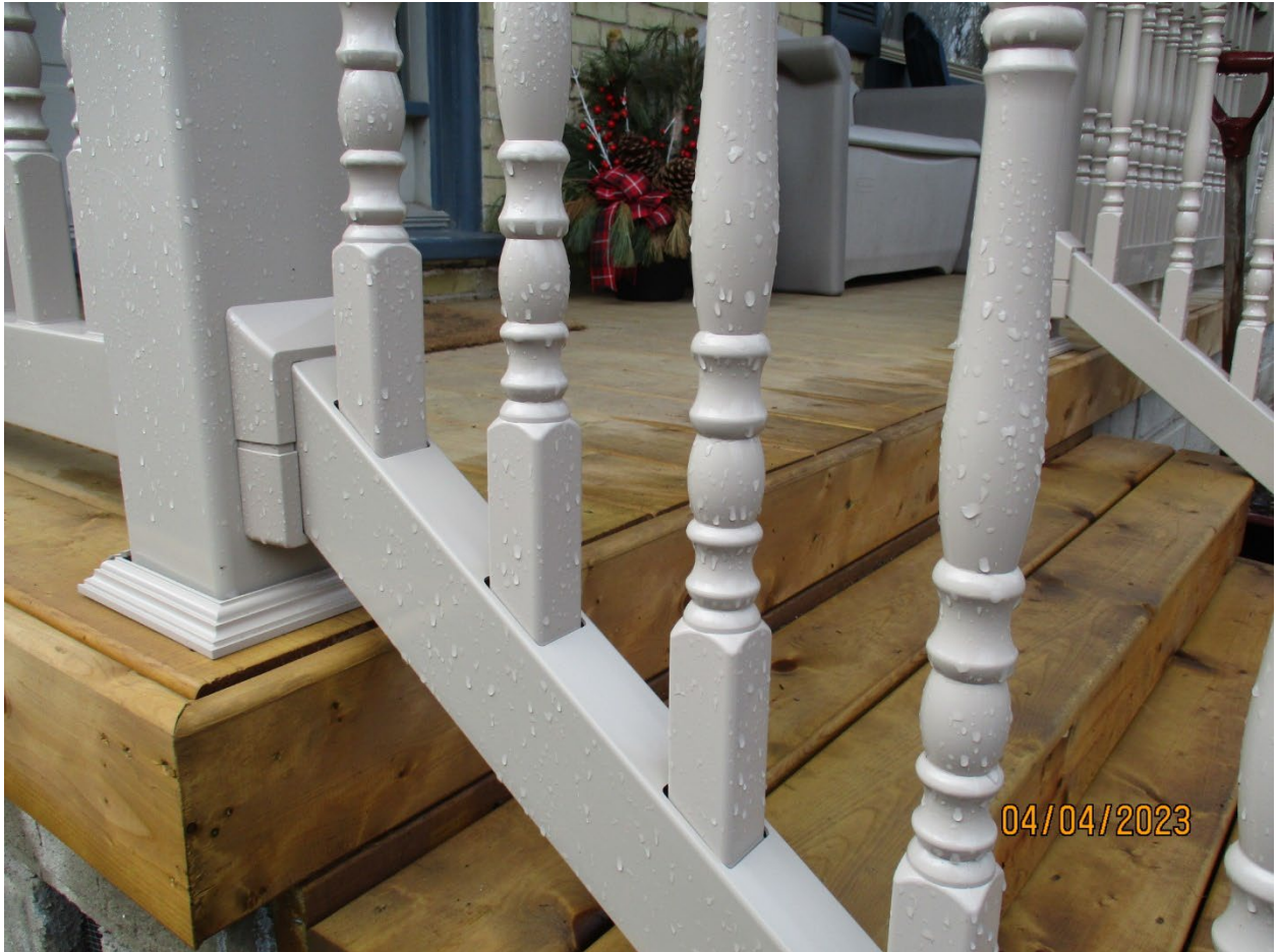
Image 7: Photograph showing detail of the vinyl (plastic) porch materials used for the replacement of the porch at 27 Bruce Street within the Wortley Village-Old South Heritage Conservation District.