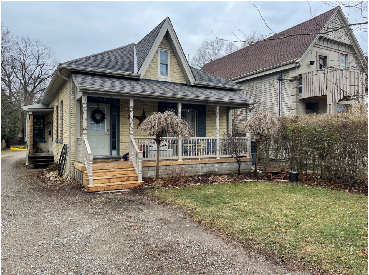
Image 2: Photograph submitted with the Heritage Alteration Permit application showing the porch with vinyl-clad (plastic) posts and vinyl railings, with pressure-treated decking.