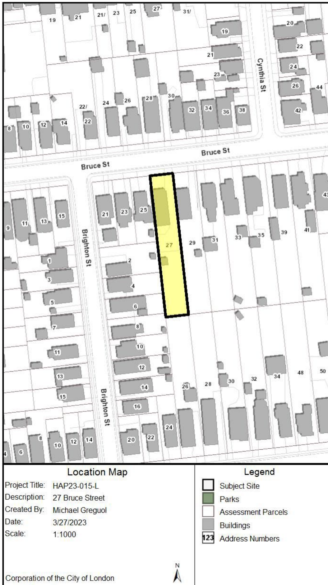
Figure 1: Location Map showing the subject property at 27 Bruce Street.