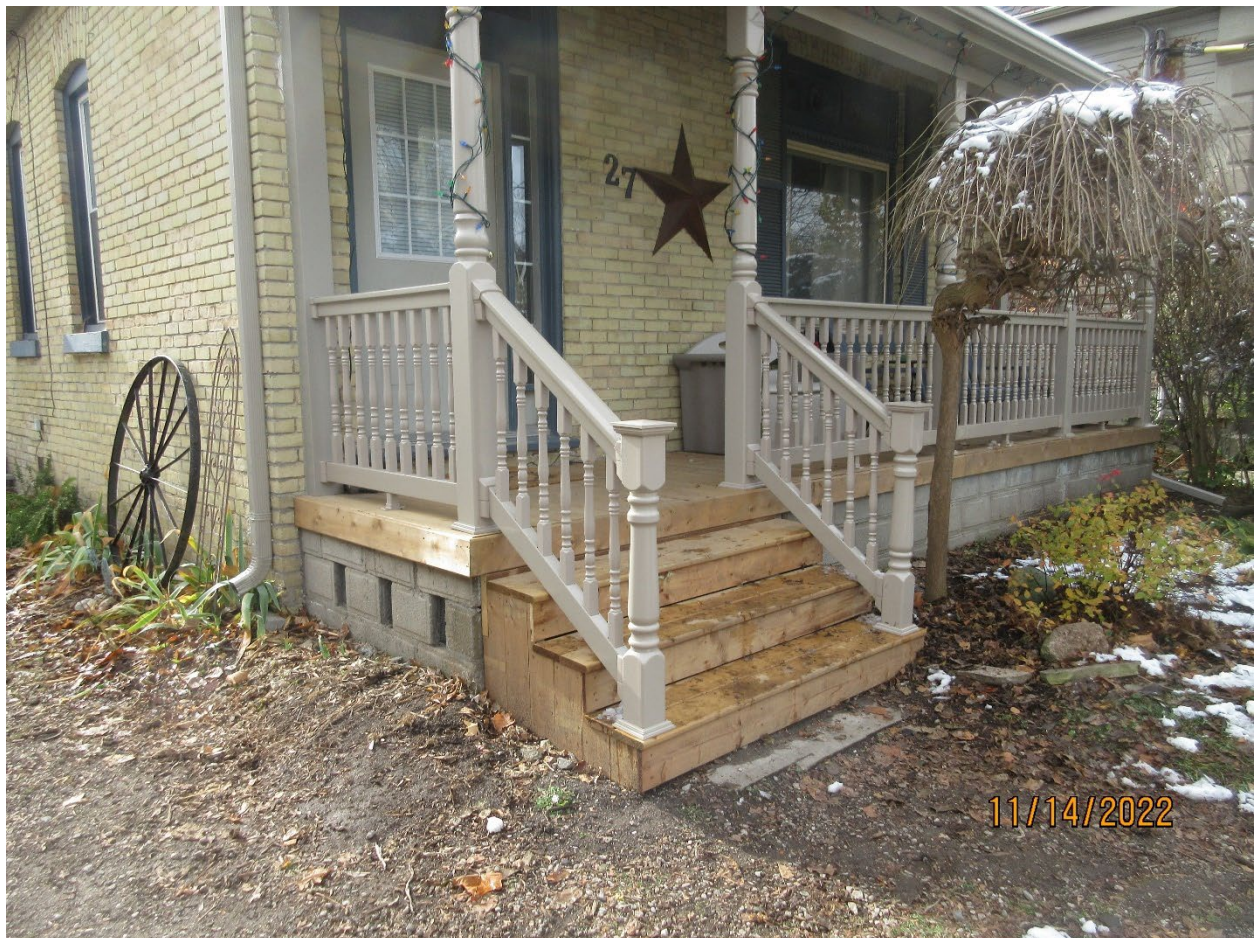
Image 4: Photograph showing detail of the vinyl (plastic) porch materials used for the replacement of the porch at 27 Bruce Street within the Wortley Village-Old South Heritage Conservation District.