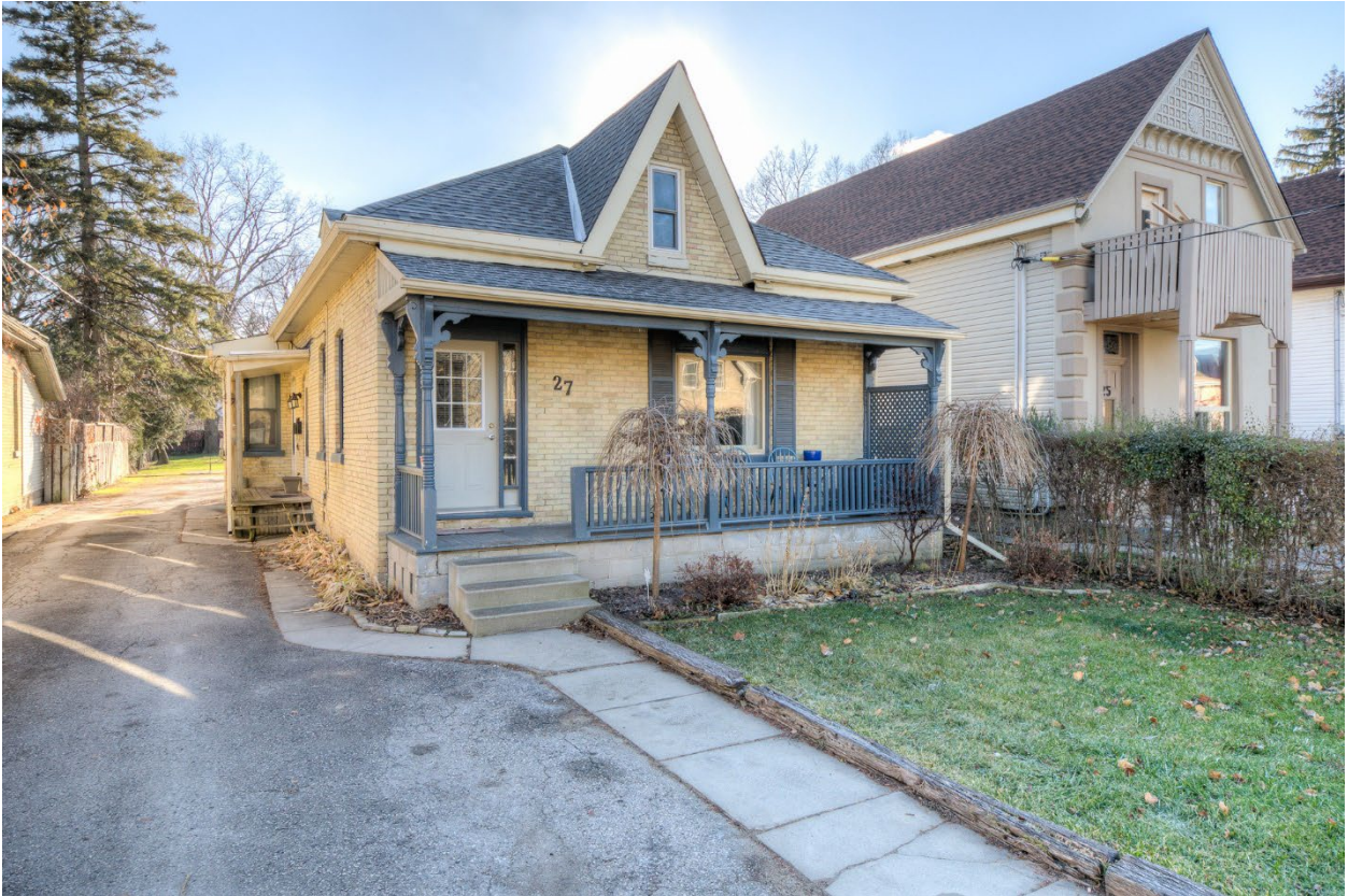
Image 1: Photograph submitted with the Heritage Alteration Permit application showing the previous porch prior removal without Heritage Alteration Permit or Building Permit approval. The porch posts and railings consisted of wood materials. The decorative brackets have also been removed.