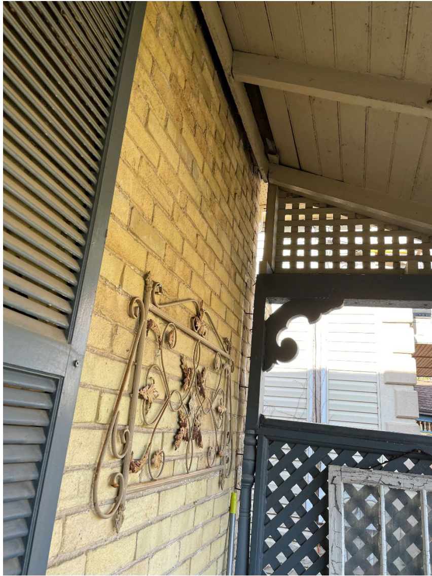
Image 3: Photograph submitted with the Heritage Alteration Permit application demonstrating the need for repairs to the porch at 27 Bruce Street. This photograph also documents the turned posts and bracket detail of the former porch.