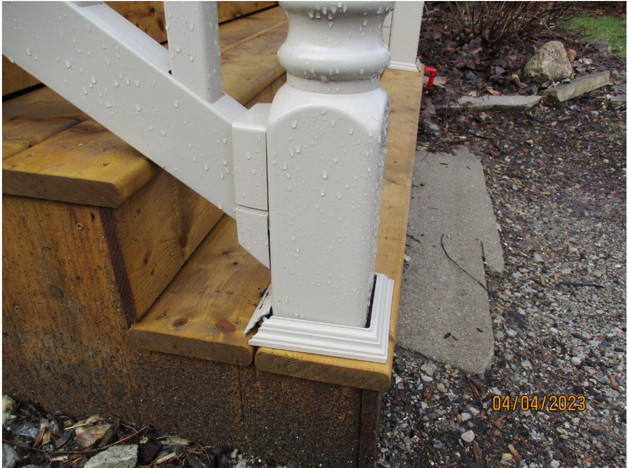
Image 5: Photograph showing detail of the vinyl (plastic) porch materials used for the replacement of the porch at 27 Bruce Street within the Wortley Village-Old South Heritage Conservation District.