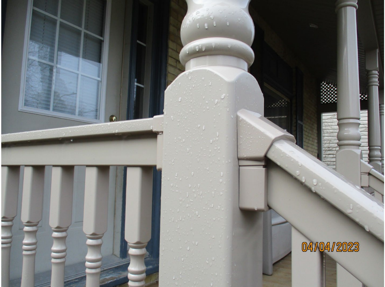
Image 8: Photograph showing detail of the vinyl (plastic) porch materials used for the replacement of the porch at 27 Bruce Street within the Wortley Village-Old South Heritage Conservation District.