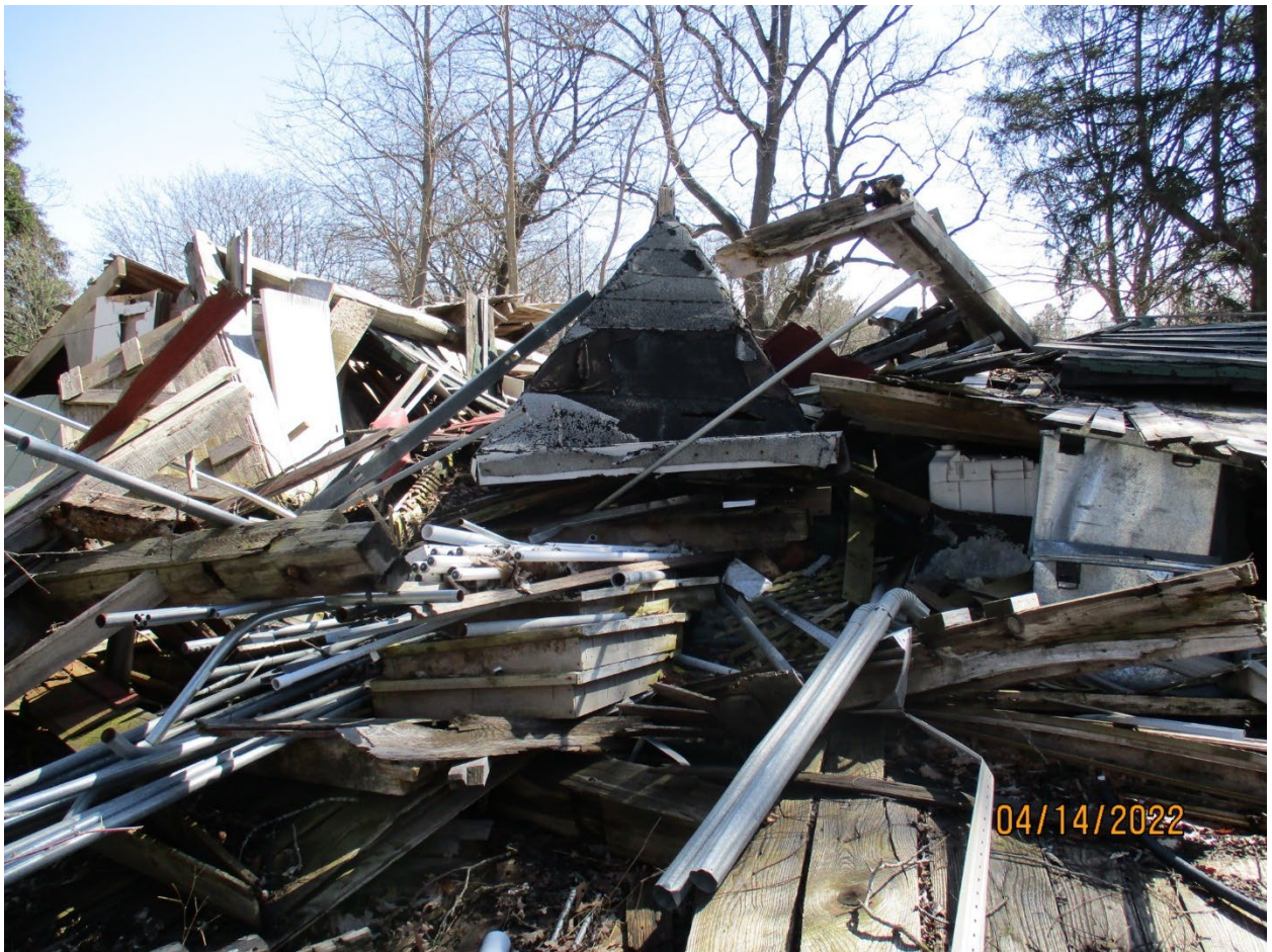
Image 16: Photograph showing debris from the former accessory building, shown in April 2022.