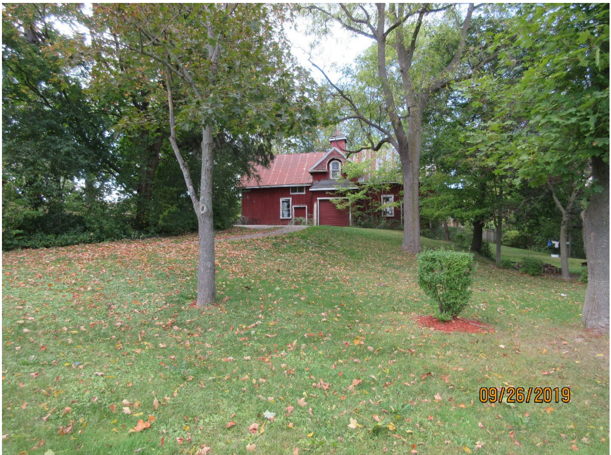
Image 2: Photograph of the accessory building as viewed from Halls Mill Road, September 2019.