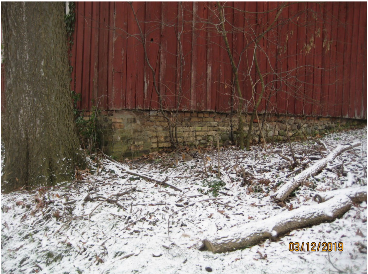
Image 6: Photograph of the foundation on the west side of the accessory building showing a mix of buff brick and field stone materials, December 3, 2019.