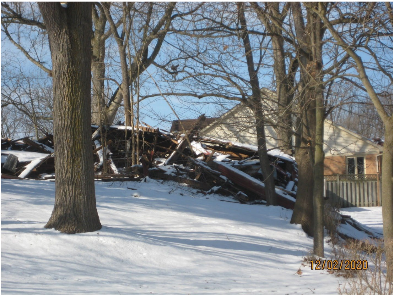
Image 10: Photograph showing the property in February 2020, following the unapproved demolition of the accessory building.