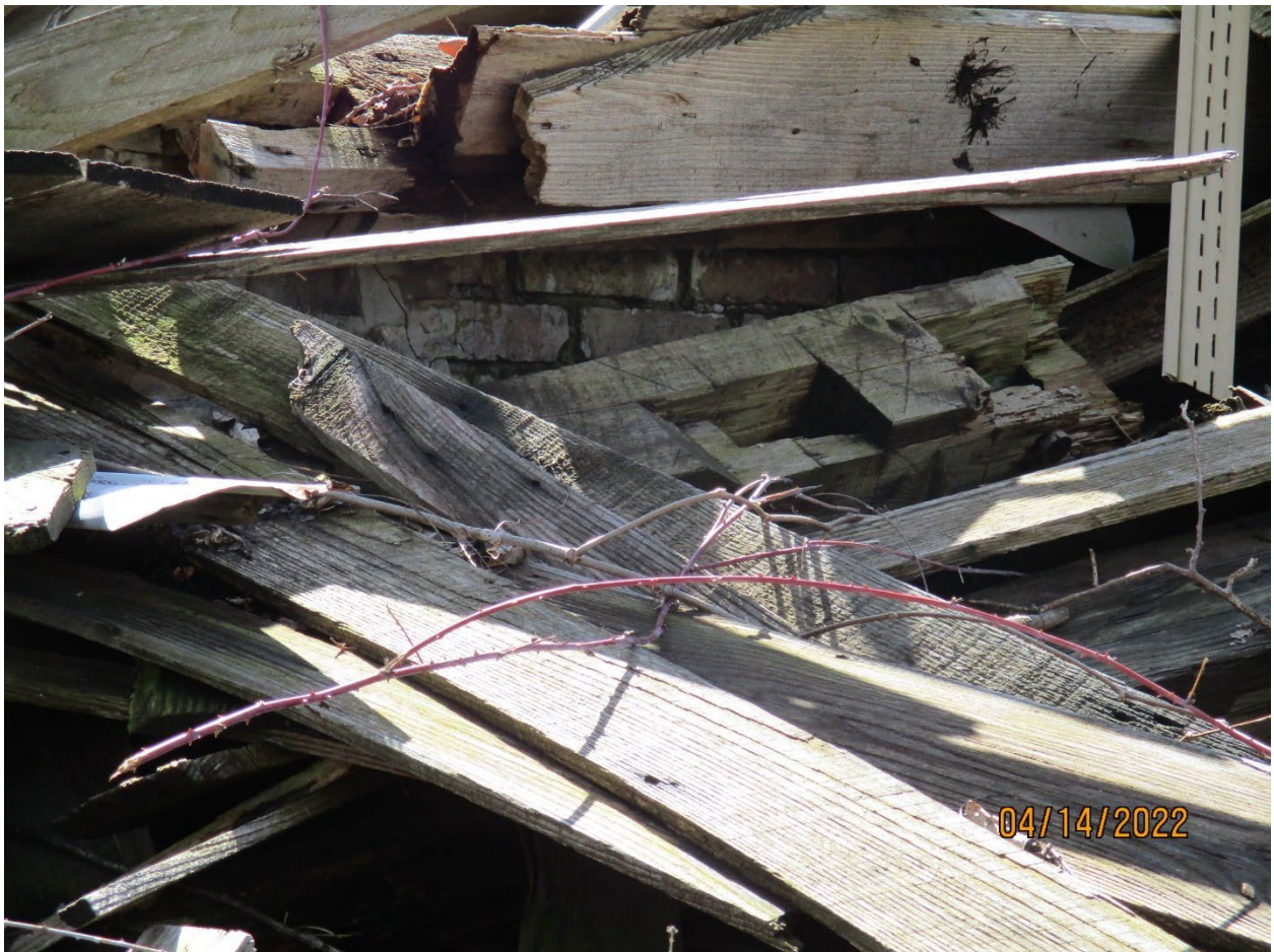
Image 12: Photograph showing debris from the former accessory building, shown in April 2022. Note, a portion of the buff brick foundation can be seen buried under the debris.