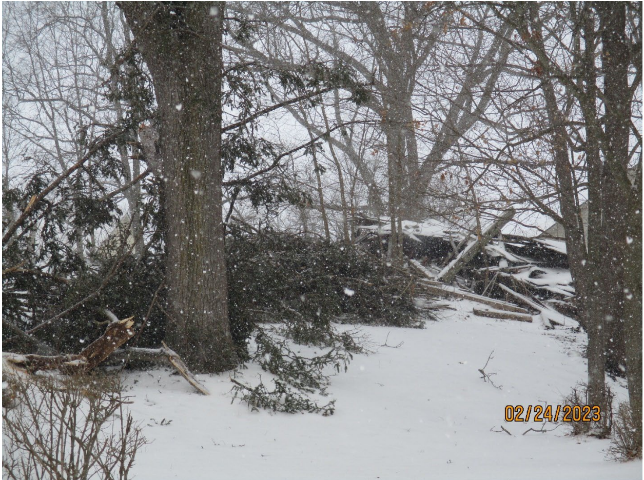
Image 19: Photograph of the property and the location of the former accessory building as viewed from the road in February 2023.