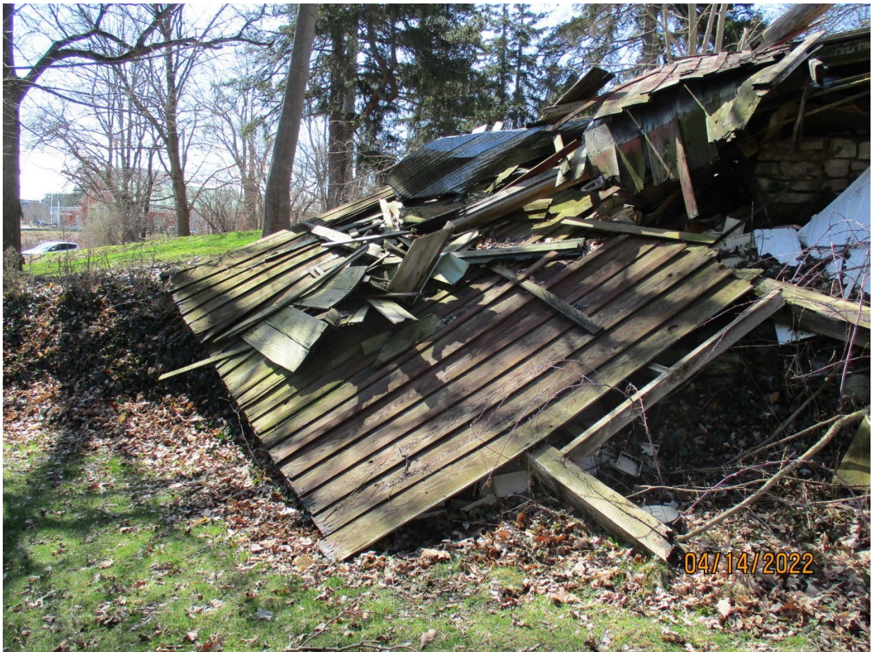
Image 14: Photograph showing debris from the former accessory building, shown in April 2022. Note, a portion of the rubble stone foundation can be seen buried under the debris at right. A portion of the cherry board-and-batten exterior cladding can be seen at centre.