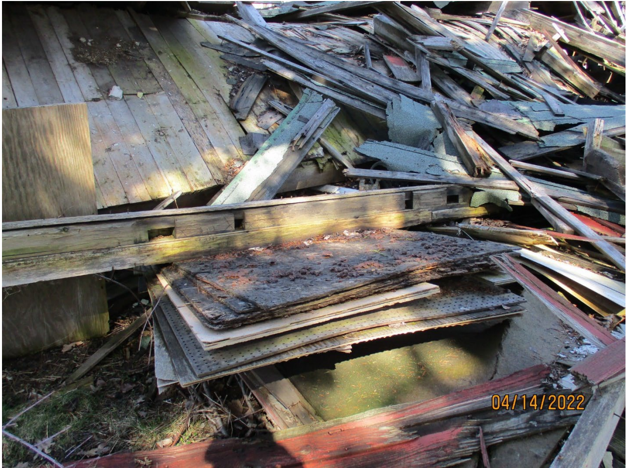
Image 15: Photograph showing debris from the former accessory building, shown in April 2022.