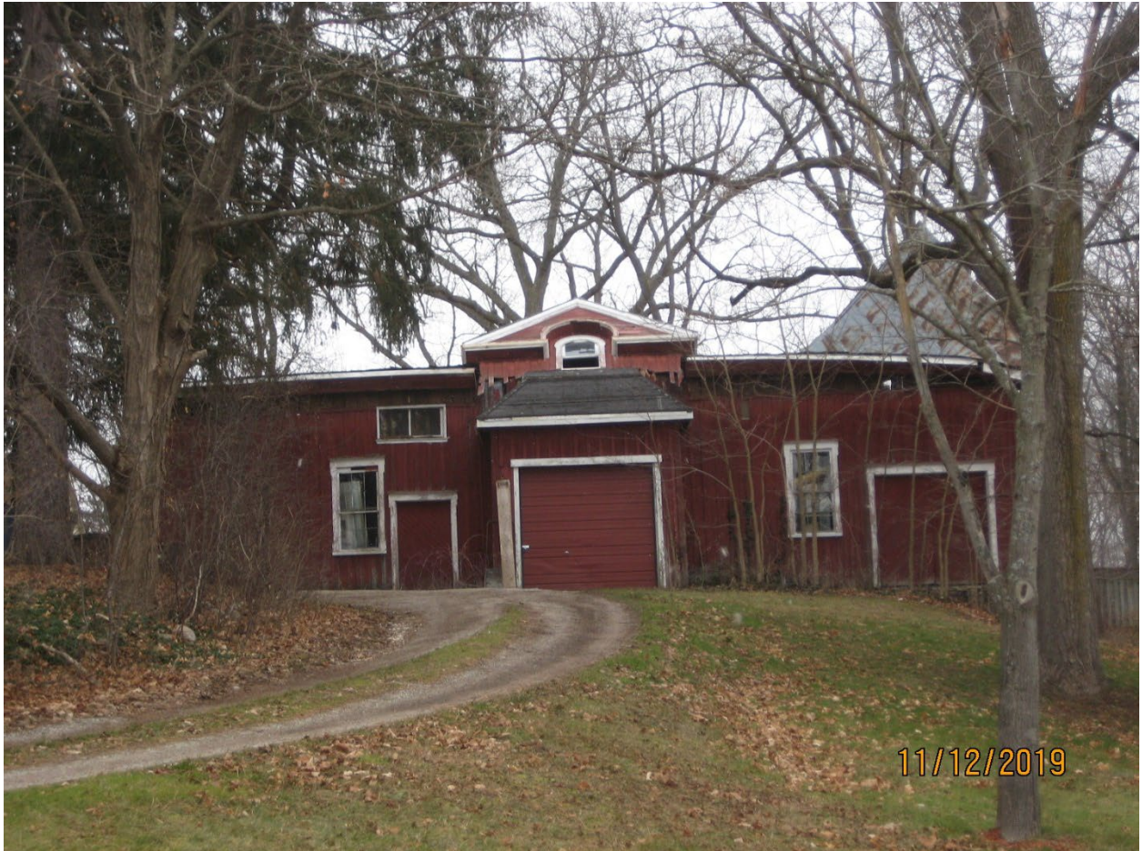
Image 7: Photograph showing the east side of the accessory building as viewed from Halls Mill Road, showing the collapse of the roof framing, December 11, 2019.