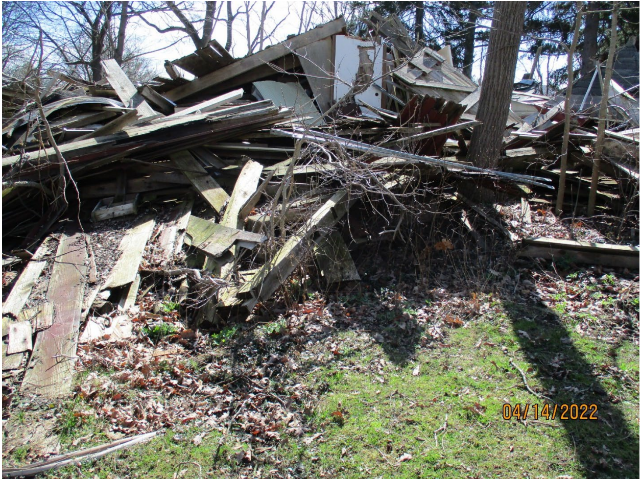
Image 11: Photograph of the debris from the former accessory building, shown in April 2022.