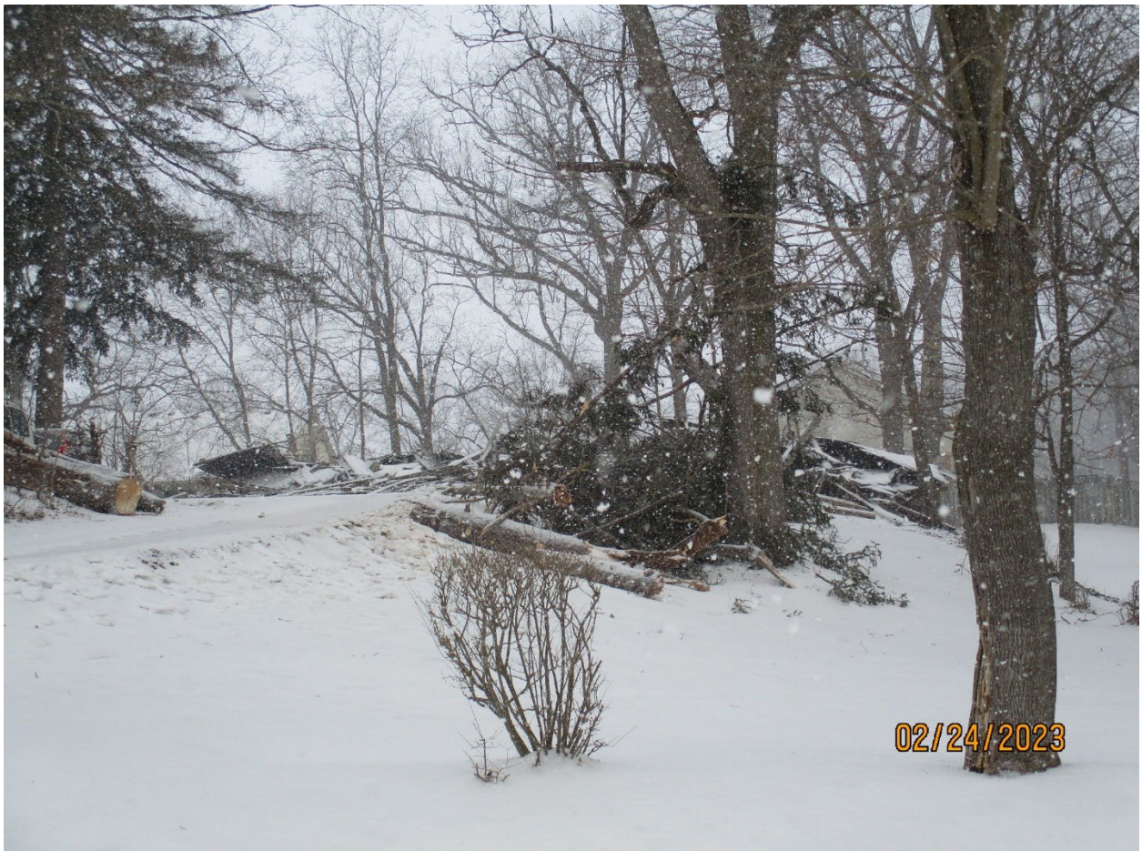
Image 18: Photograph of the property and the location of the former accessory building as viewed from the road in February 2023.