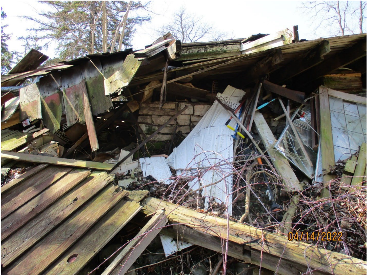
Image 13: Photograph showing debris from the former accessory building, shown in April 2022. Note, a portion of the rubble stone foundation can be seen buried under the debris.