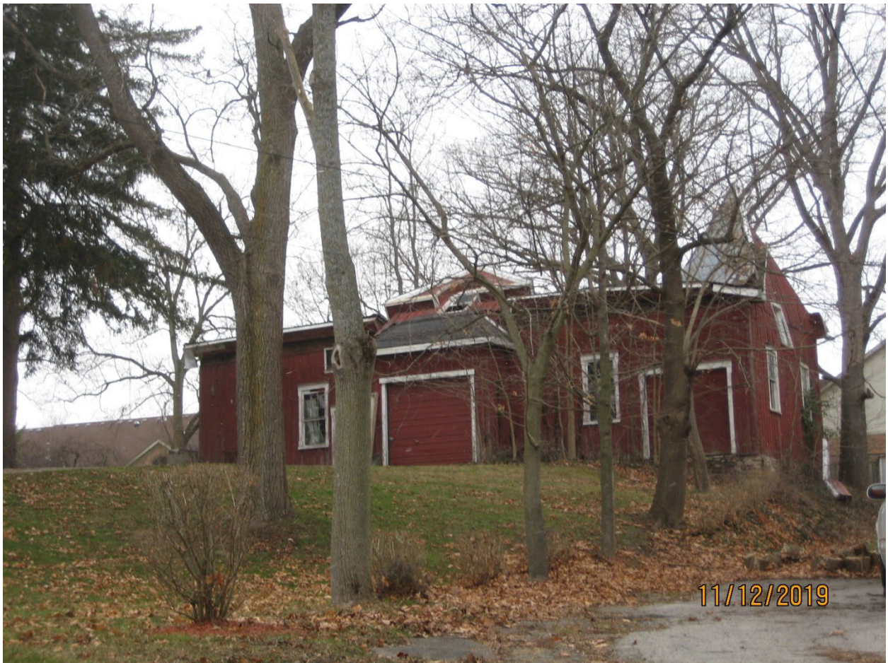
Image 8: Photograph showing the east side of the accessory building as viewed from Halls Mill Road, showing the collapse of the roof framing, December 11, 2019.