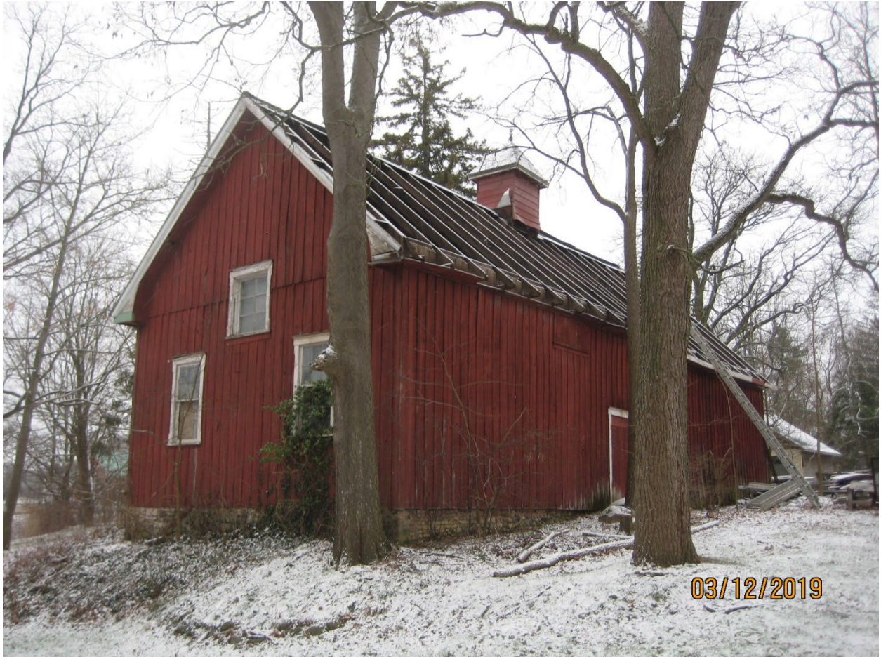
Image 5: Photograph of the west side of the accessory building, showing the removed roof sheathing, December 3, 2019.