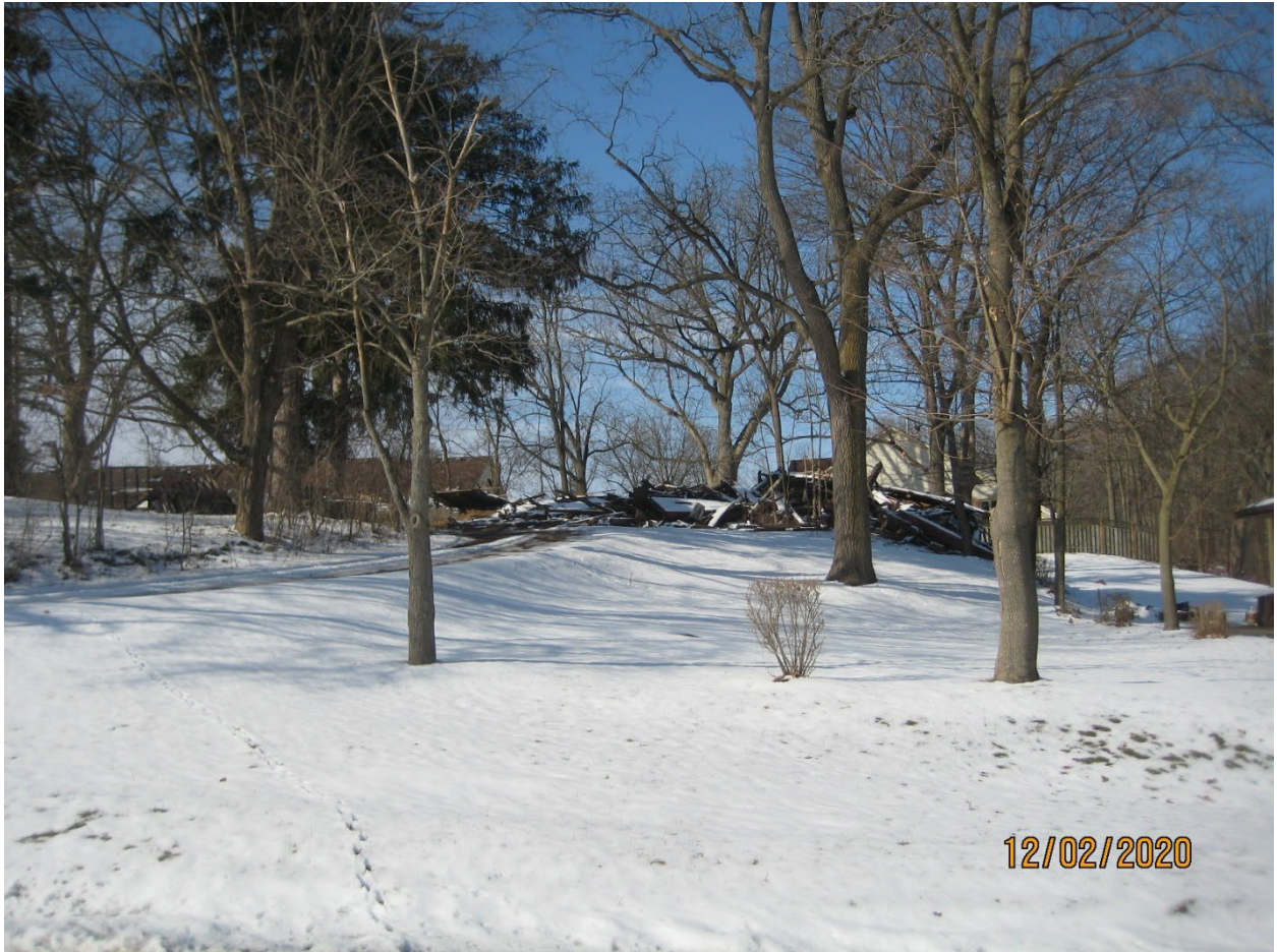
Image 9: Photograph showing the property in February 2020, following the unapproved demolition of the accessory building.