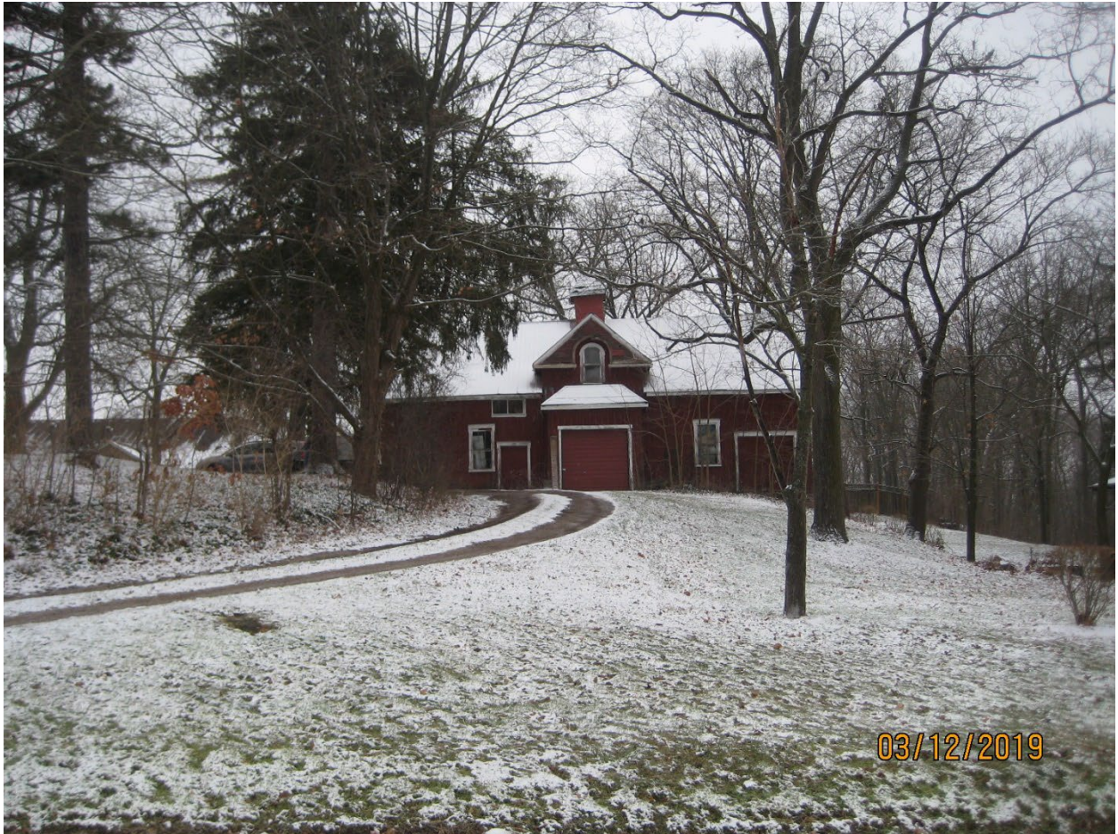
Image 3: Photograph showing the accessory building as viewed from Halls Mill Road, December 3, 2019.