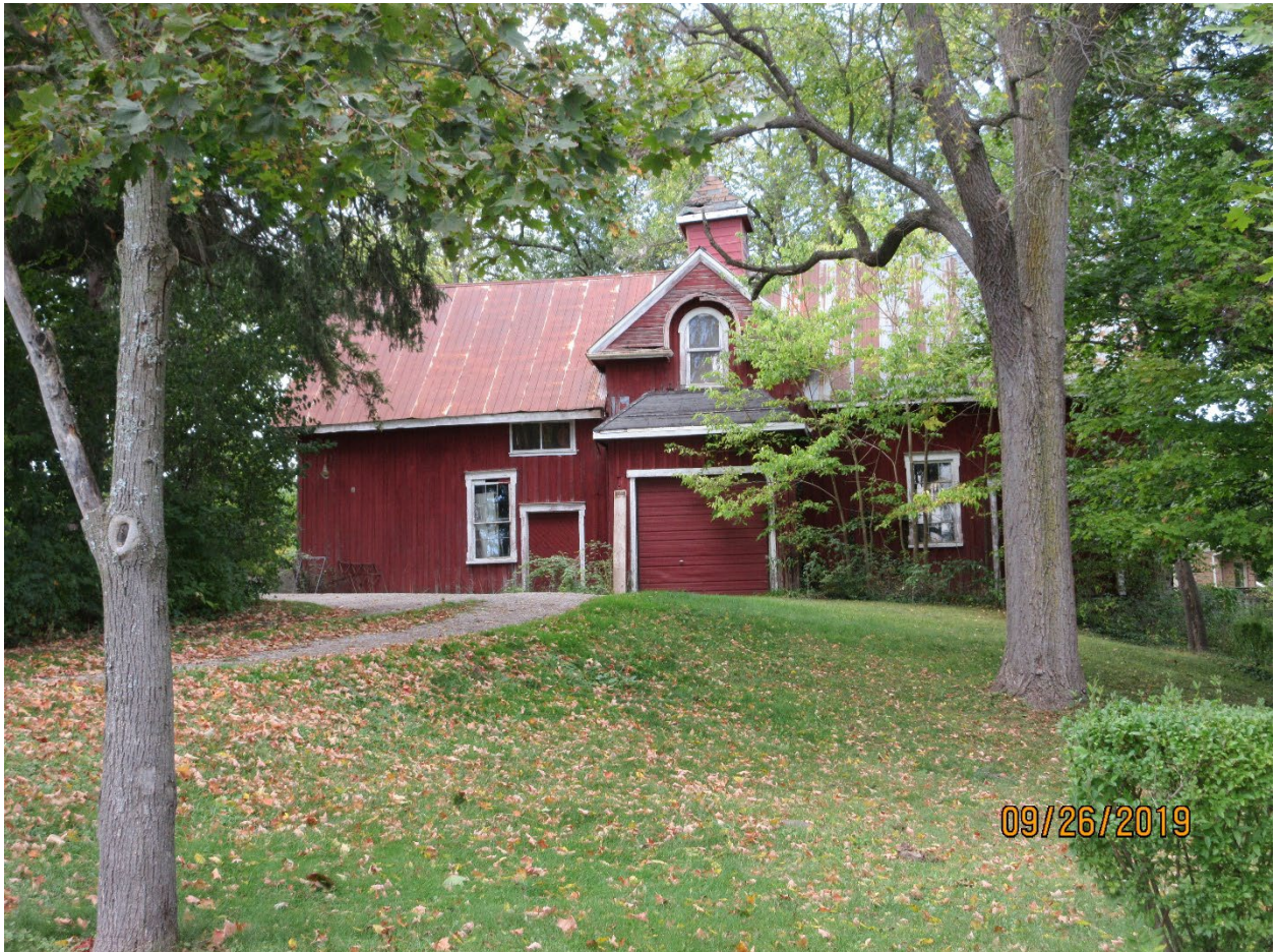
Image 1: Photograph showing the accessory building in September 2019.