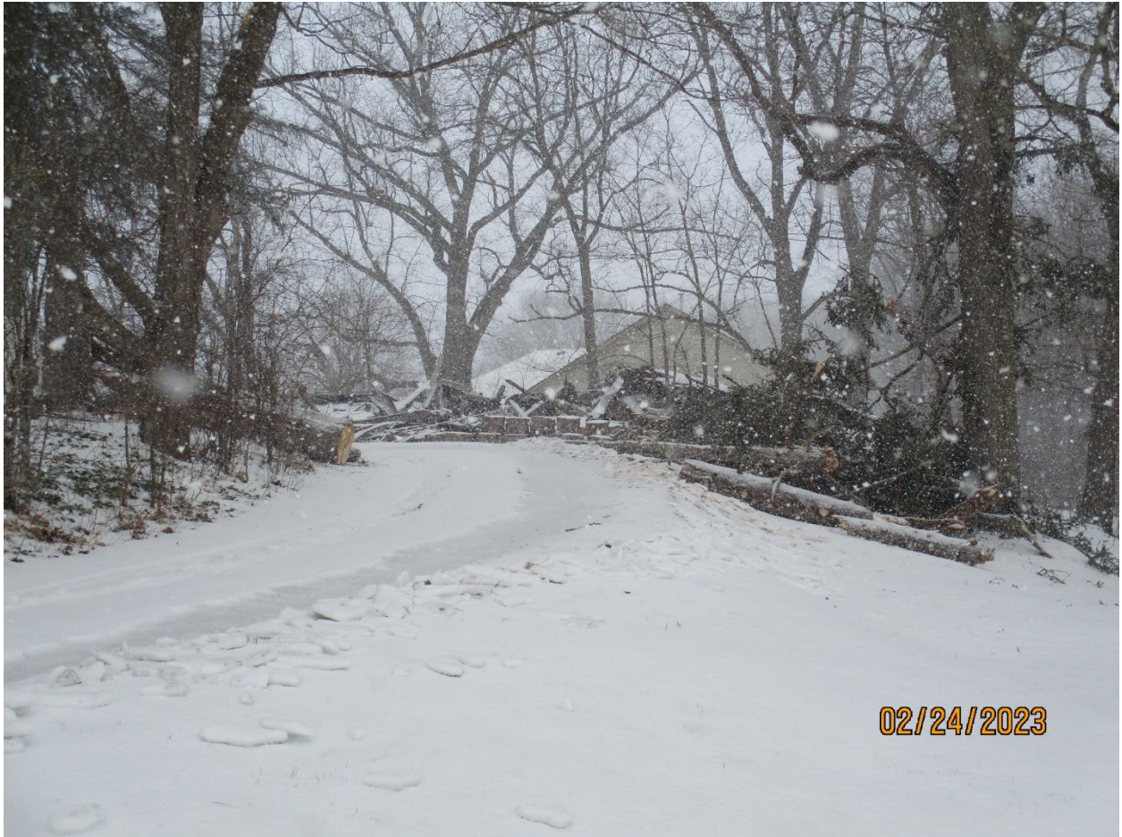
Image 17: Photograph of the property and the location of the former accessory building as viewed from the road in February 2023.