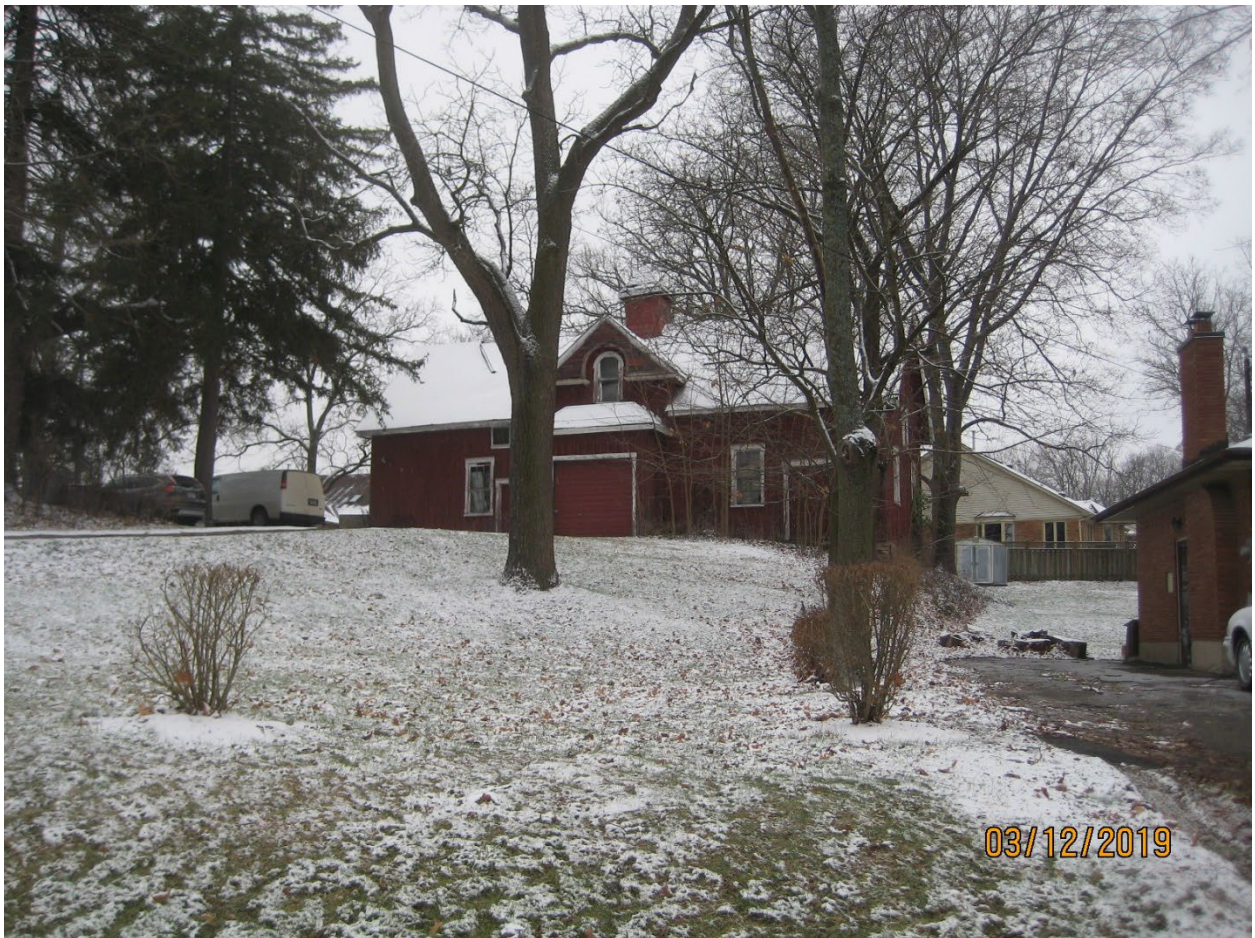
Image 4: Photograph showing the accessory building as viewed from Halls Mill Road, December 3, 2019.