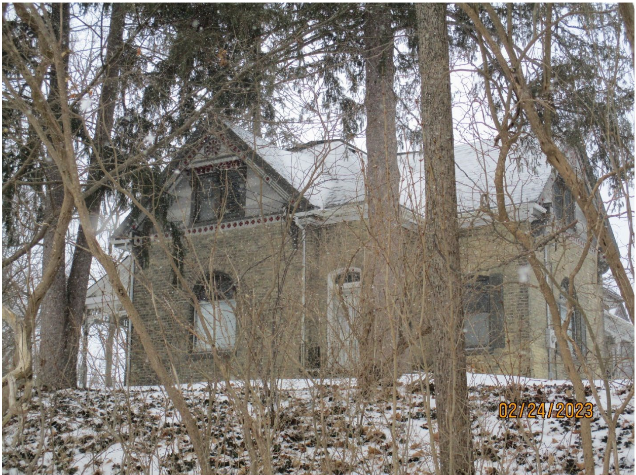
Image 20: Photograph of the property and the dwelling on the property at 247 Halls Mills Road viewed from the road in February 2023. Note, the dwelling is also included within the Statement of Cultural Heritage Value or Interest.