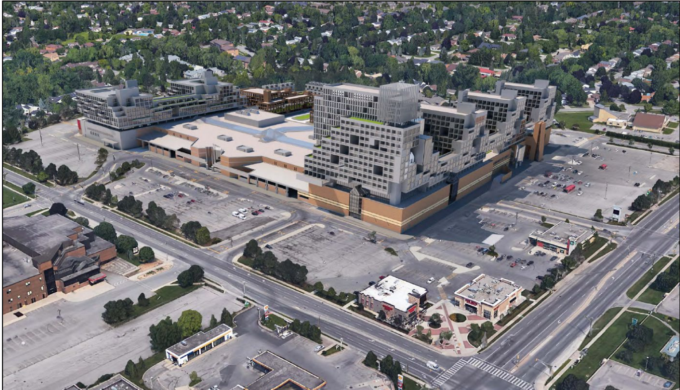
Northwest View – Wonderland Road South

The above images represent the applicant's proposal as submitted and may change.