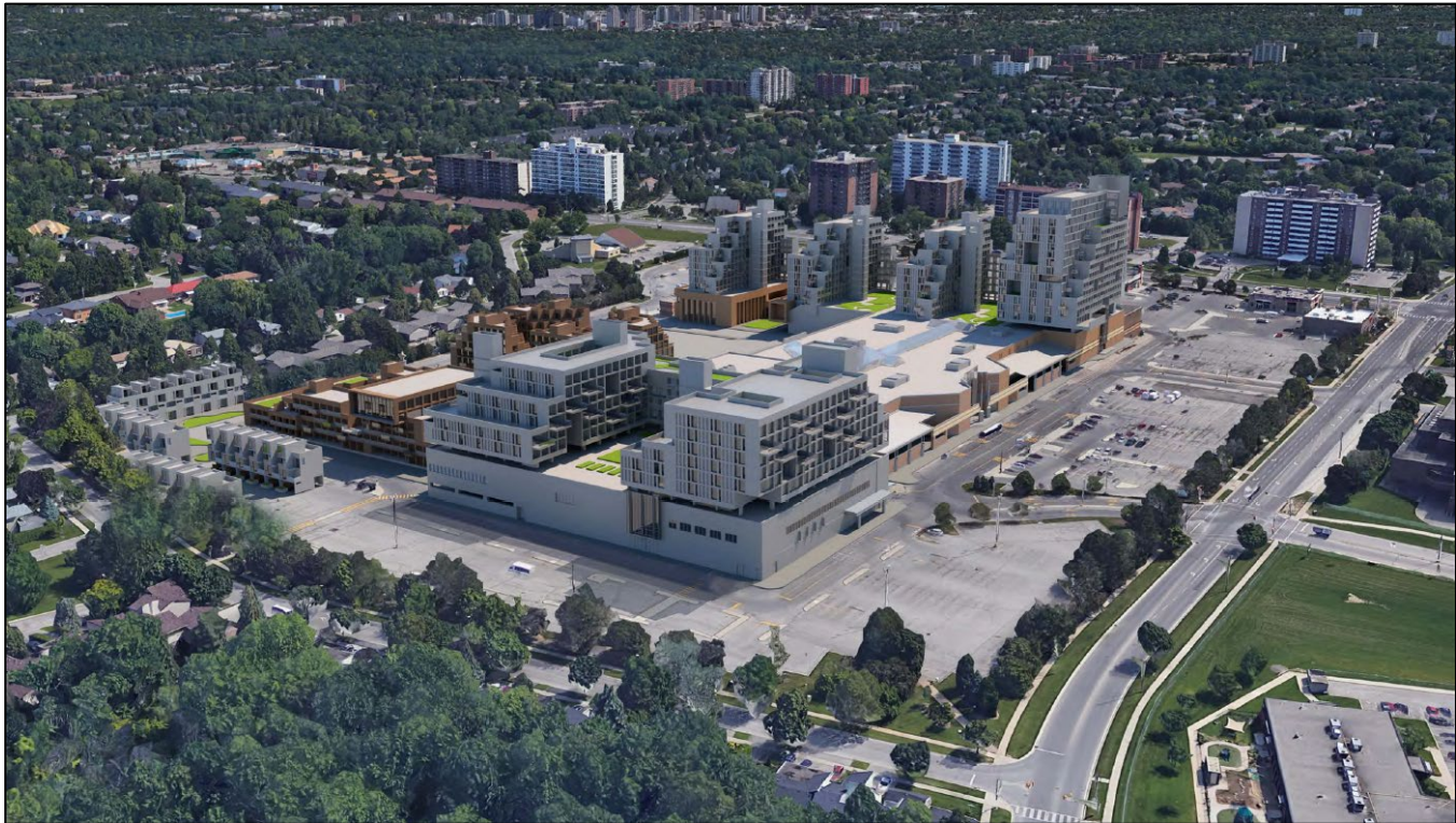
Northeast View – Viscount Road