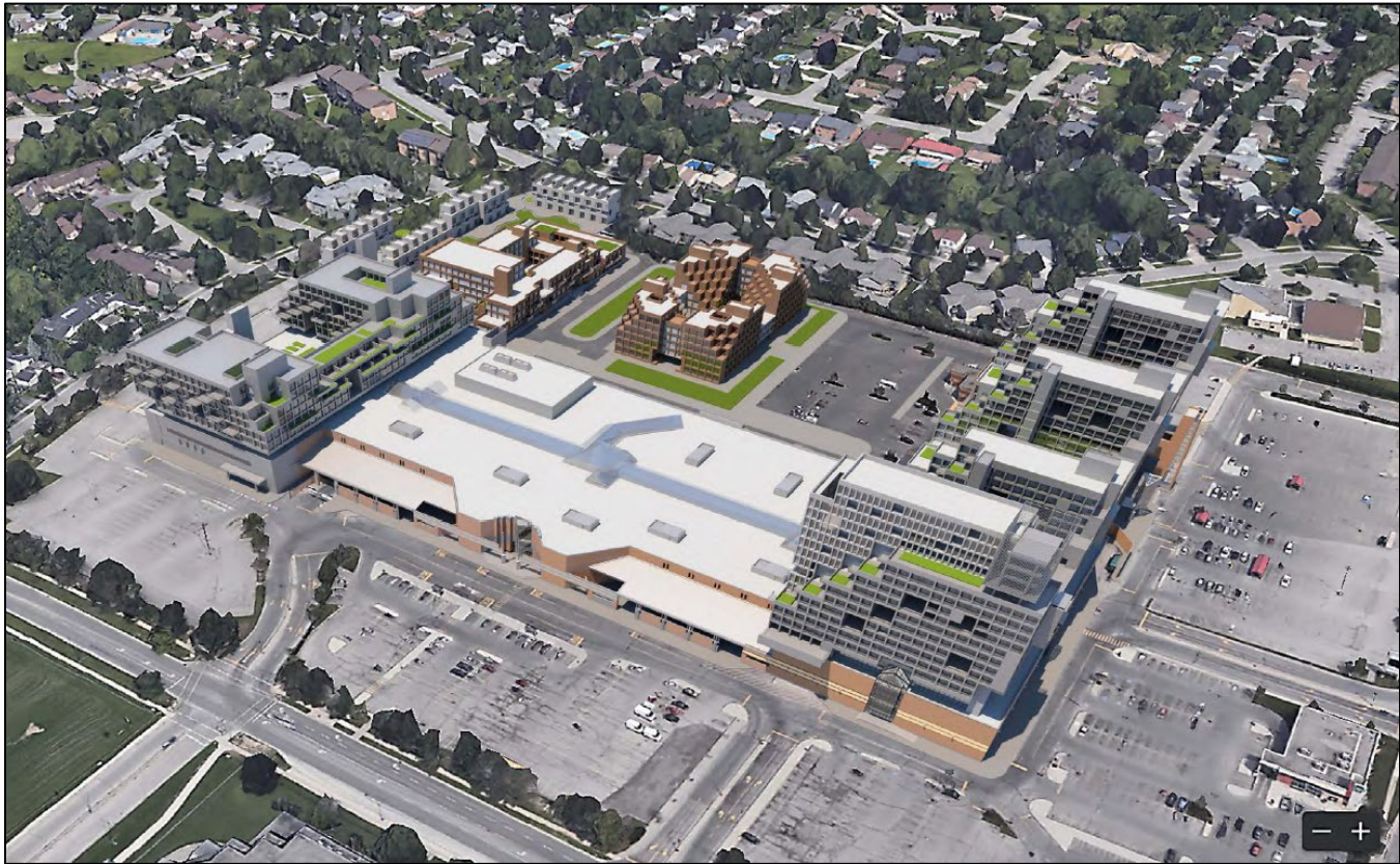
Overall Site View