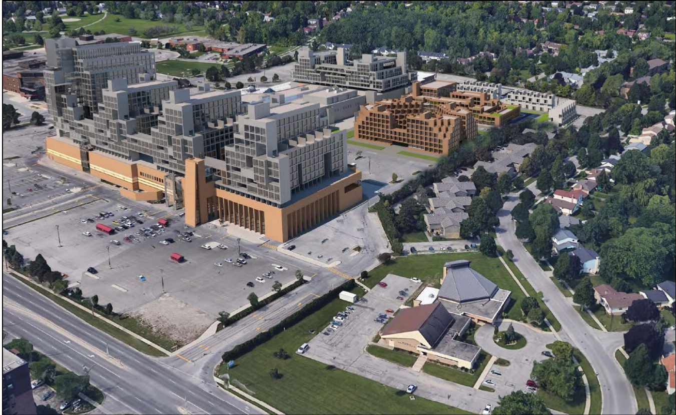
Southeast View – Wonderland Road South

The above images represent the applicant's proposal as submitted and may change.