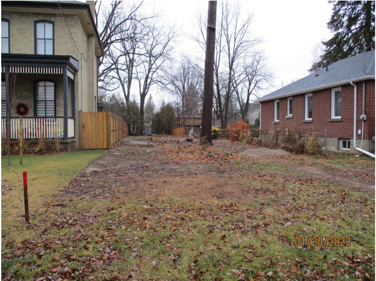
Image 3: Photograph showing the subject property at 54 Duchess Avenue.