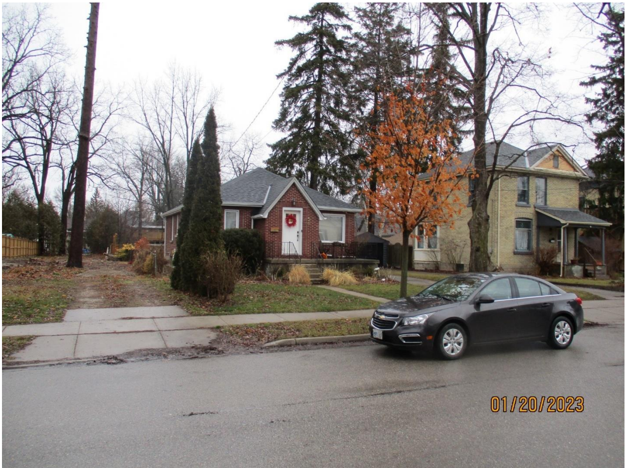
Image 6: Photograph showing the properties located at 56 Duchess Avenue and 62 Duchess Avenue, within the Wortley Village-Old South Heritage Conservation District.