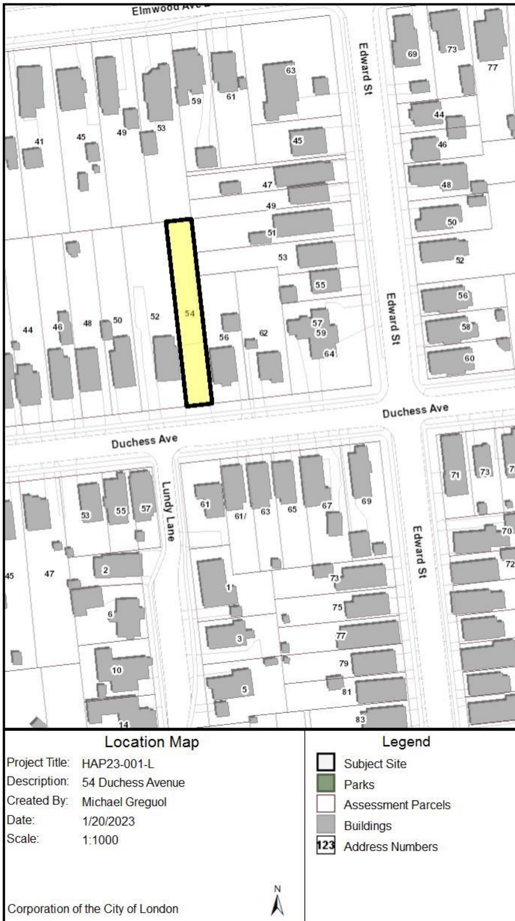
Figure 1: Location Map showing the location of subject property at 54 Duchess Avenue, located within the Wortley Village-Old South Heritage Conservation District.