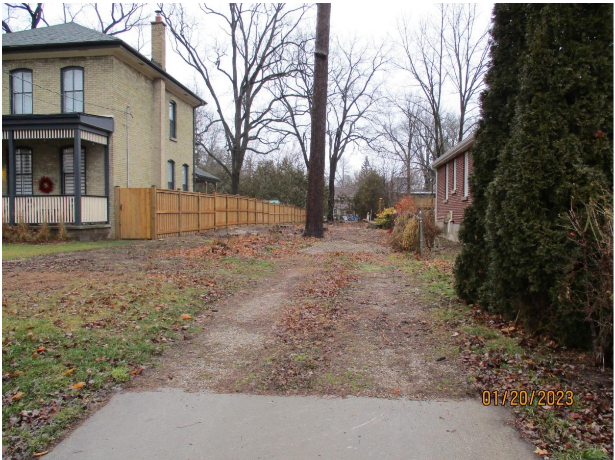
Image 2: Photograph showing the subject property at 54 Duchess Avenue.