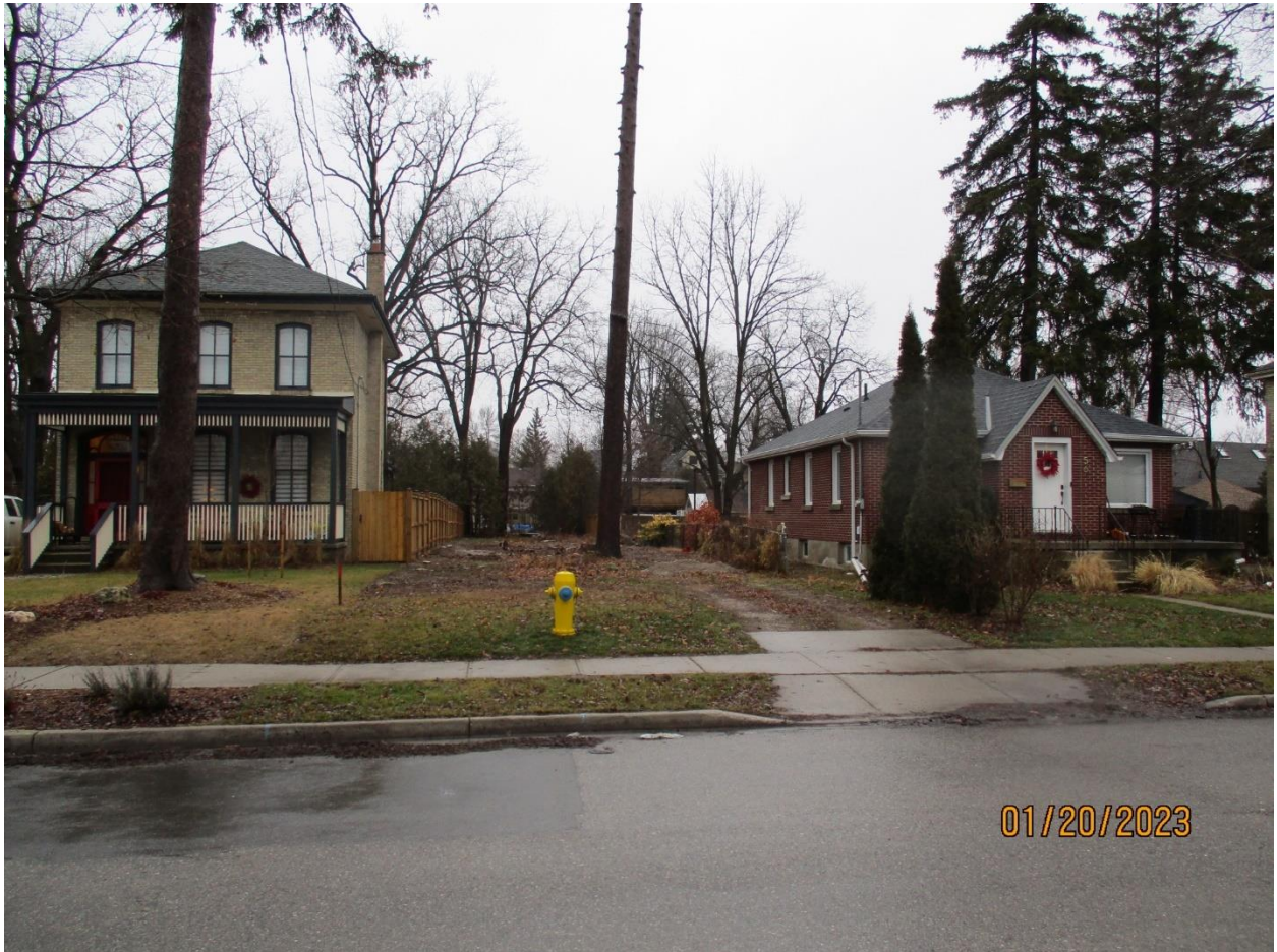
Image 1: Photograph looking north across Duchess Avenue showing the subject property at 54 Duchess Avenue within the Wortley Village-Old South Heritage Conservation District.