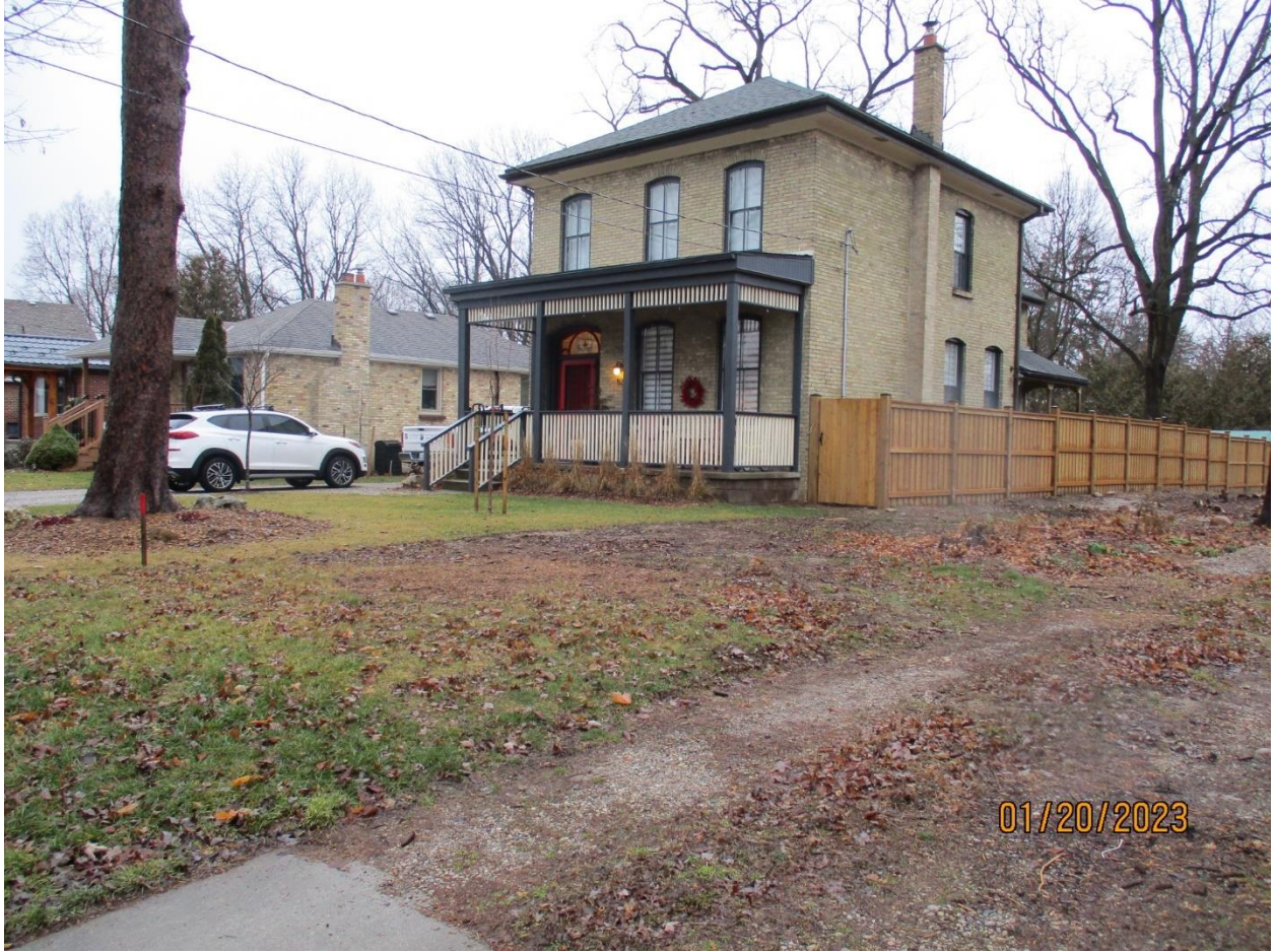
Image 4: Photograph showing the adjacent property at 52 Duchess Avenue, which includes a 2-storey vernacular dwelling with Italianate influences.