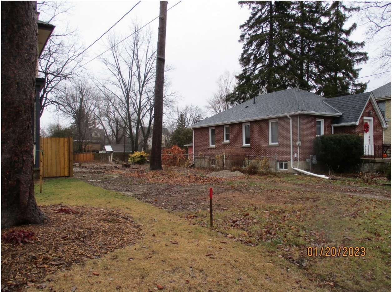
Image 5: Photograph showing the adjacent property at 56 Duchess Avenue which includes a vernacular Tudor Revival-inspired dwelling.