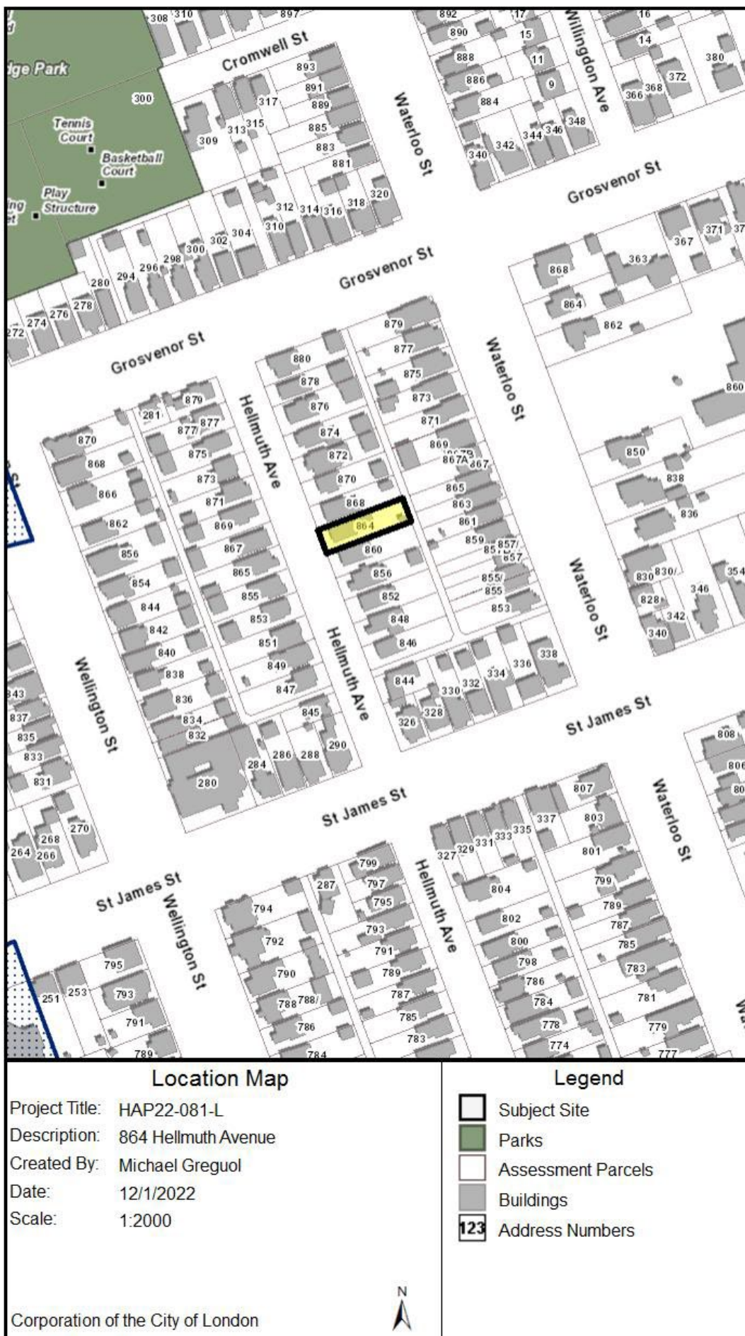
Figure 1: Location of the subject property at 864 Hellmuth Avenue, located within the Bishop Hellmuth Heritage Conservation District.