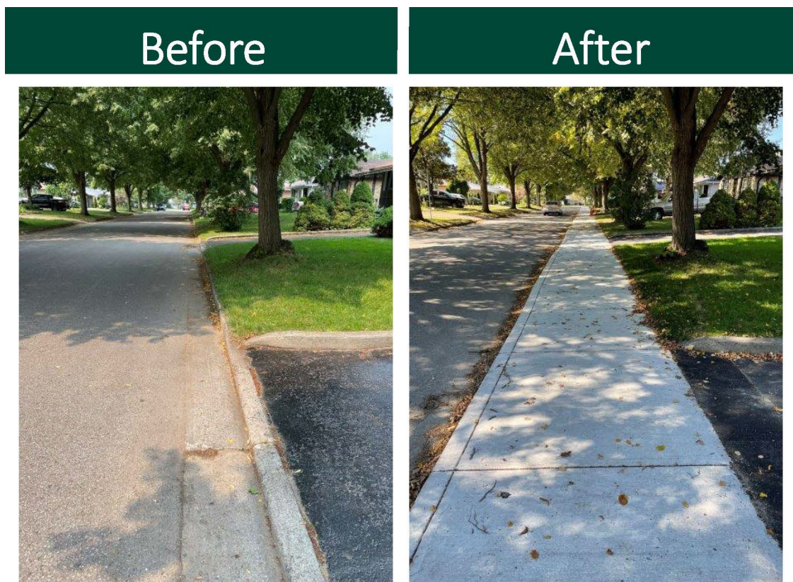
Figure 2: Example Curb-face Sidewalk Installation – Before and After

The need remains to support pedestrian connection to the South Foxhollow Ravine access off Edgehill Crescent. As an alternative, a curbface sidewalk is recommended on Edgehill Road combined with a short sidewalk connection on the west side of Edgehill Crescent. This would provide more direct connection for pedestrians not comfortable walking on the road to access the ravine trail.