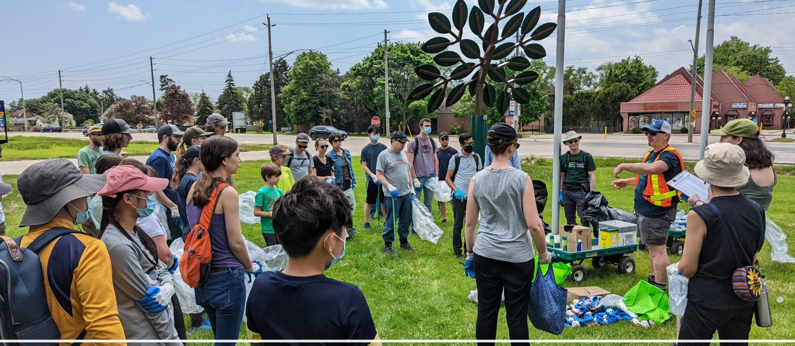
160 Volunteers Westminster Ponds 2022