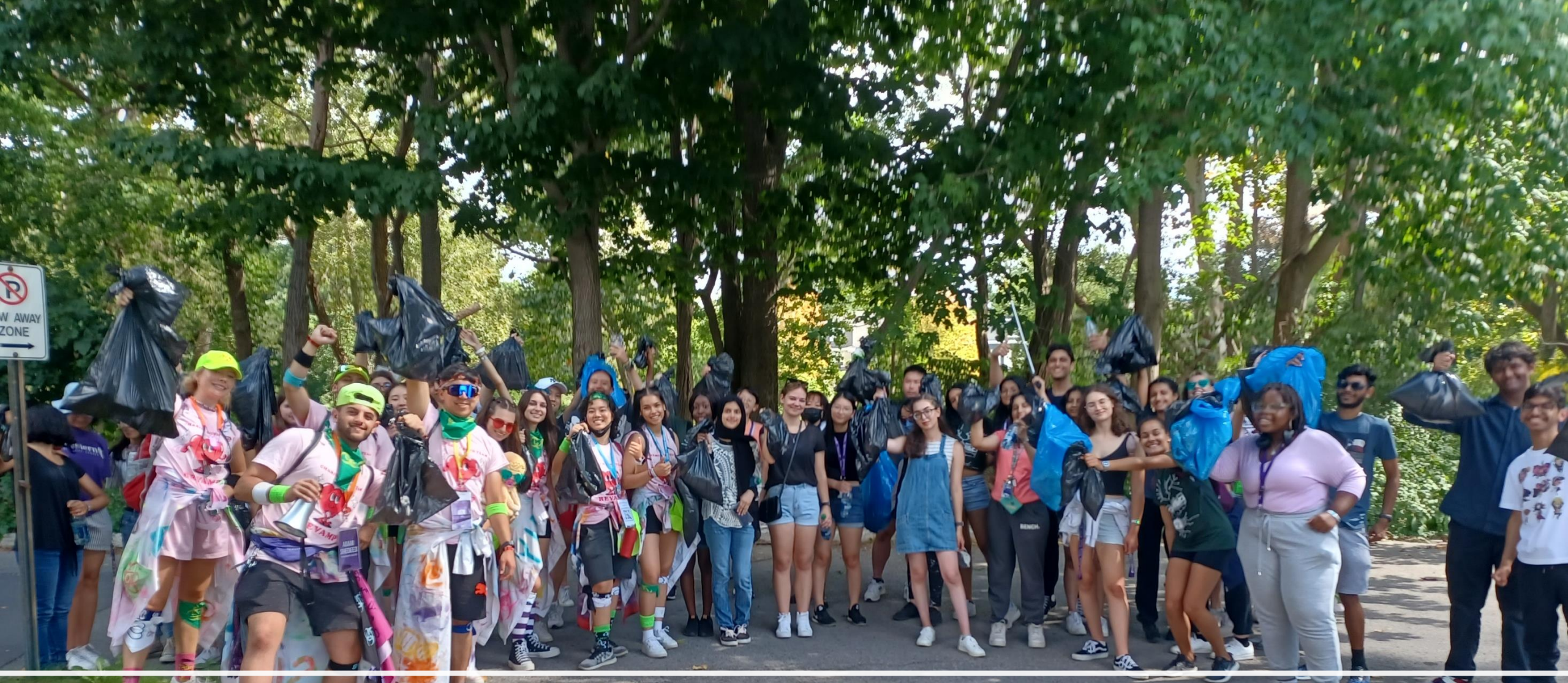
O-Week at Western