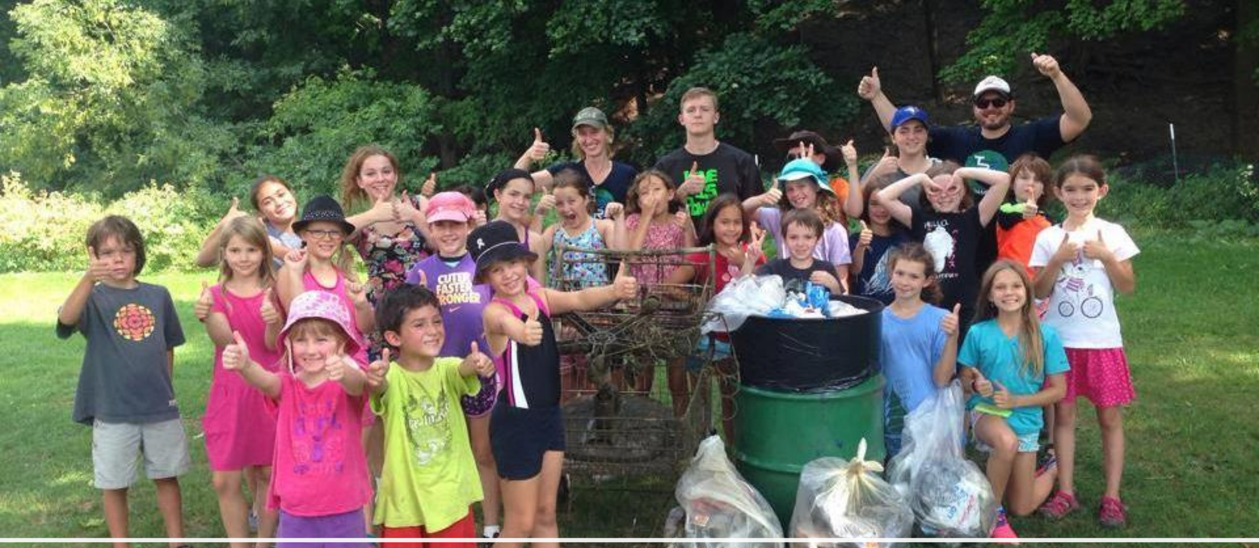
Children's International Summer Villages (CISV)