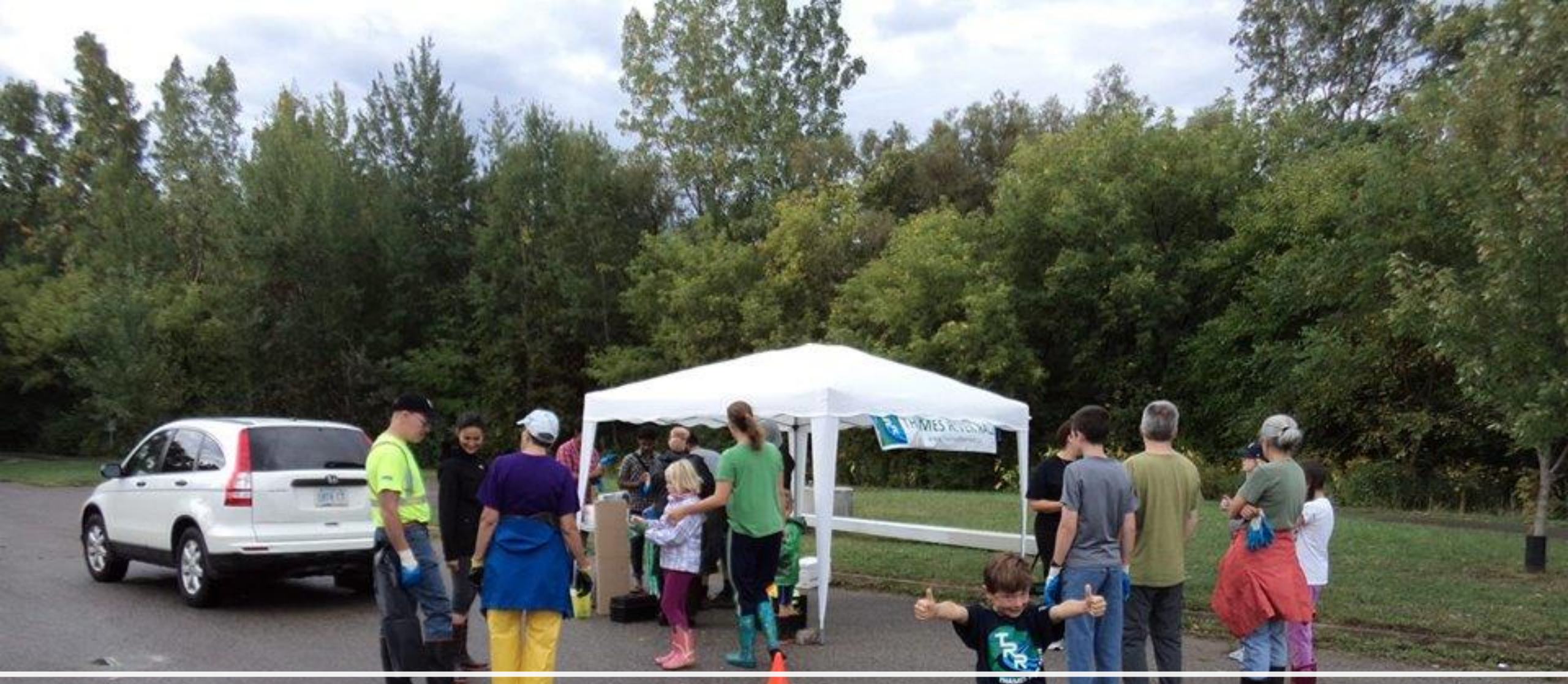
Cleanup in Partnership with London Mosque and First-St. Andrew's United Church