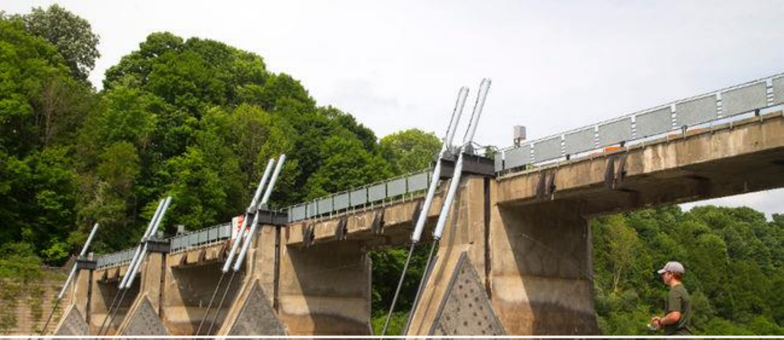
Obstructions: Springbank Dam