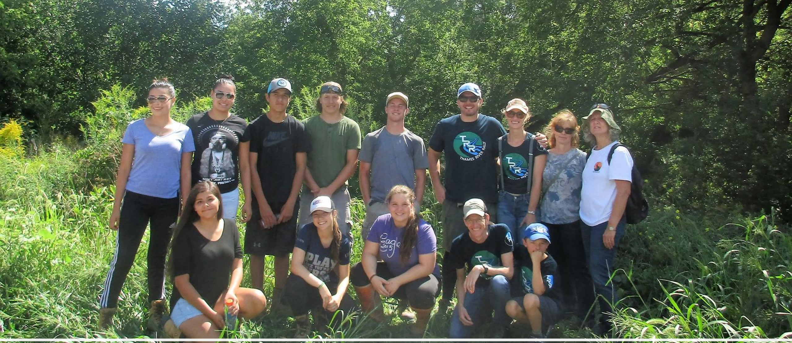
Clean up with The Antler River Guardians from the 4 Directions