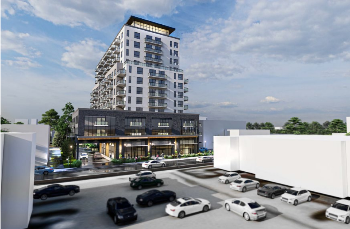
Rendering of building looking north from Albert Street