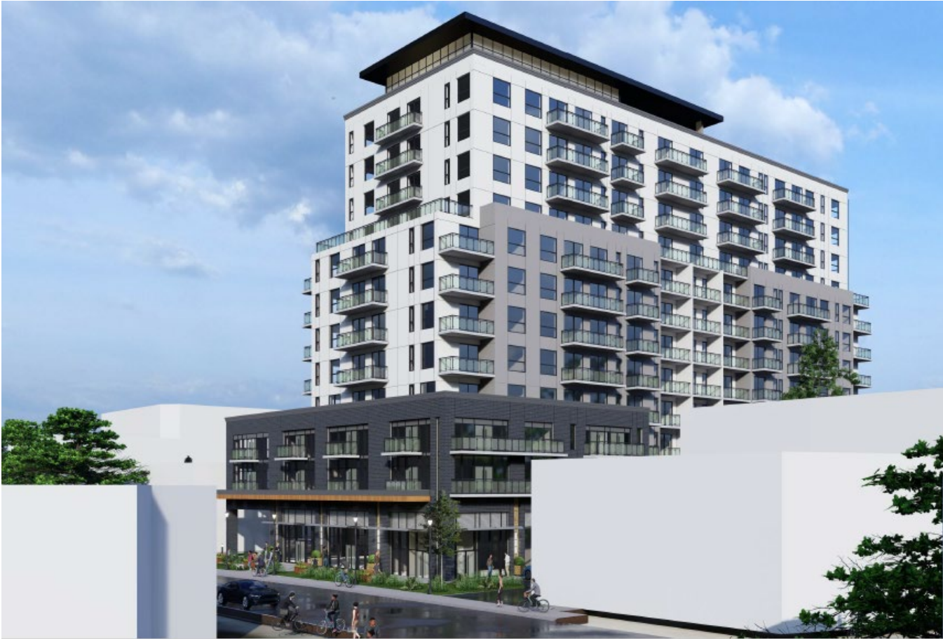
Rendering of building looking northwest from Richmond Street

The above images represent the applicant's proposal as submitted and may change.