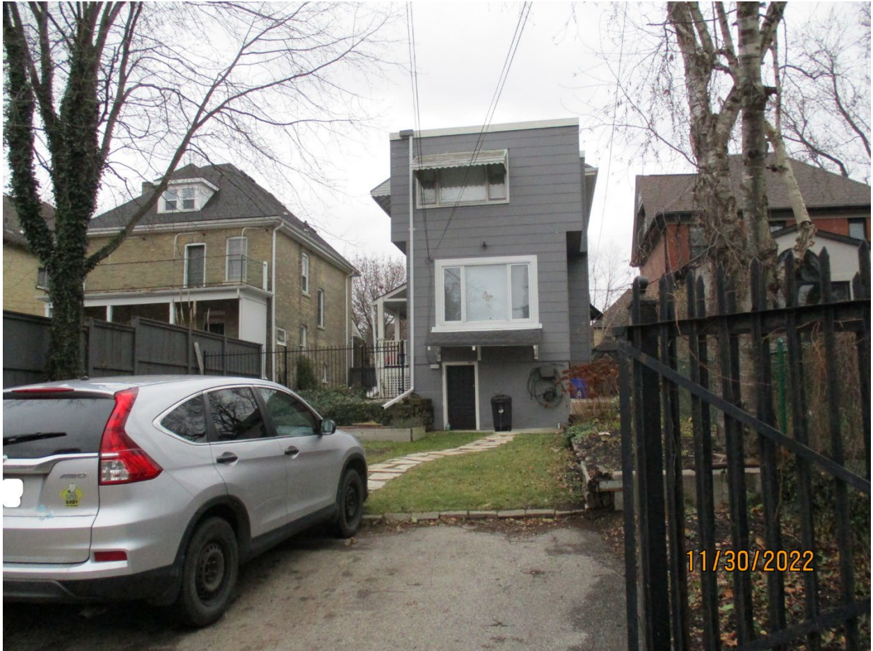
Image 5: Photograph showing rear yard parking and entry to the dwelling at 864 Hellmuth Avenue from laneway.