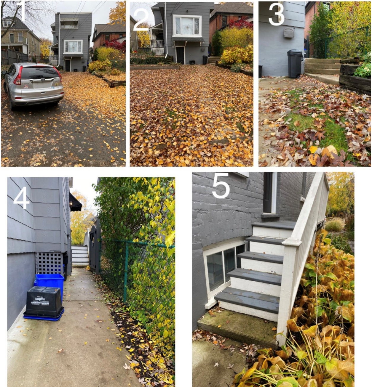
Image 9: Photographs submitted by the applicant as a part of the Heritage Alteration Permit application.