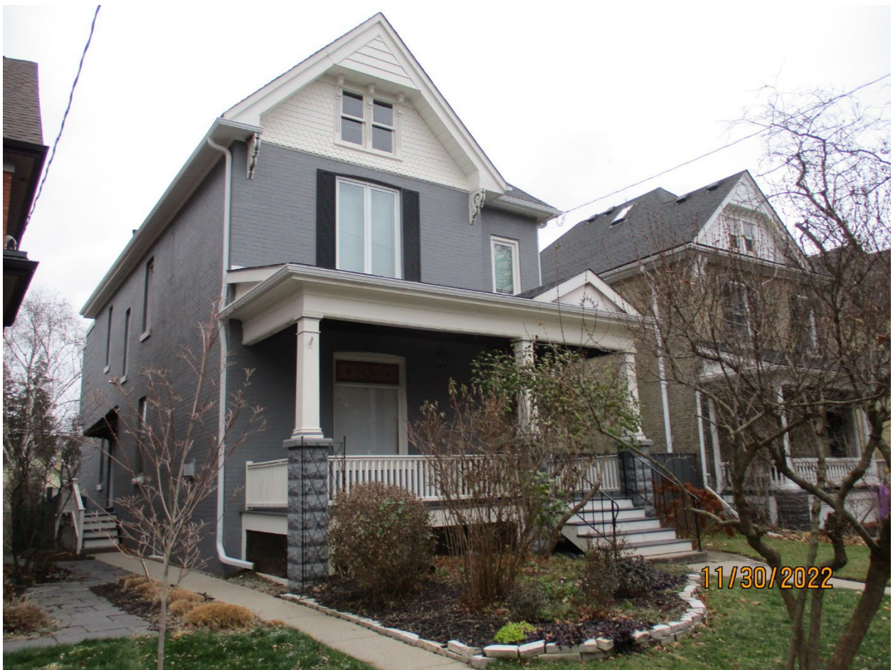
Image 3: Photograph showing the dwelling on the property at 864 Hellmuth Avenue.