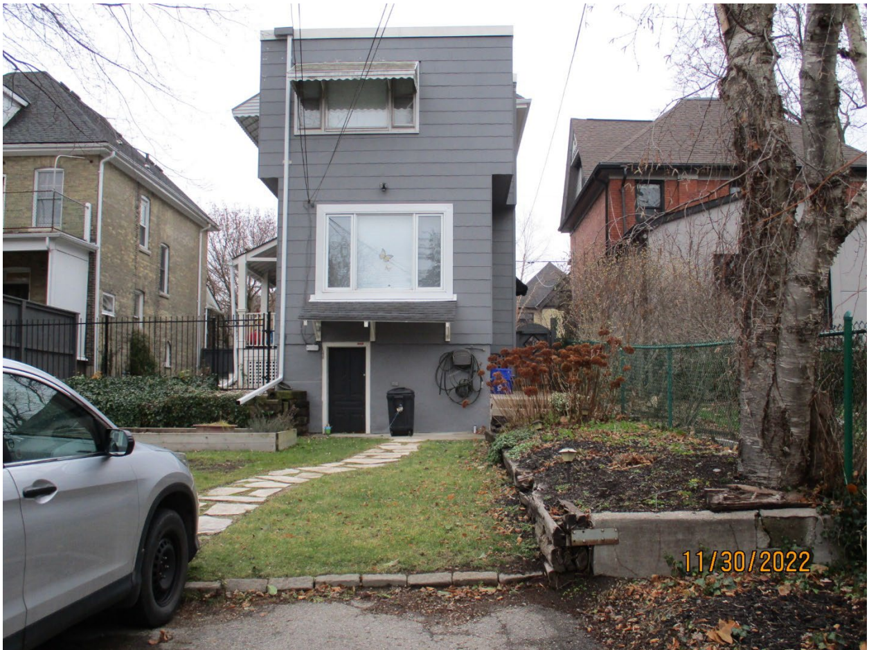
Image 6: Photograph showing at grade entry to the rear of the property at 864 Hellmuth Avenue.