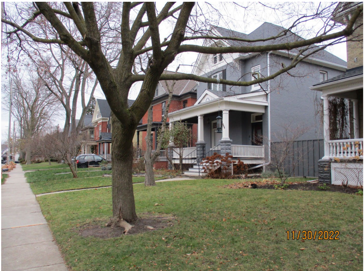
Image 2: Photograph showing the front yard of the property at 864 Hellmuth Avenue.