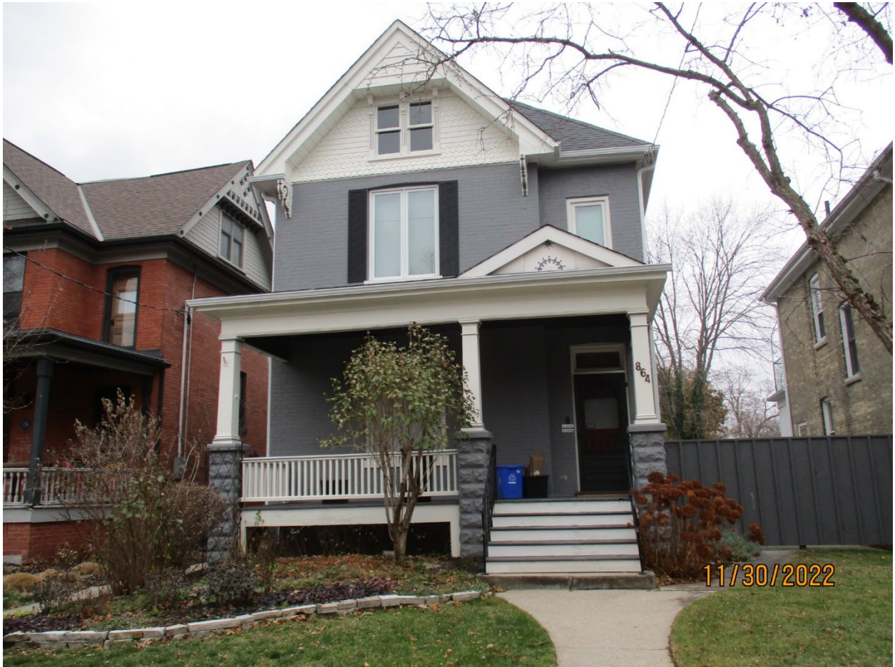
Image 1: Photograph showing the dwelling located at 864 Hellmuth Avenue.