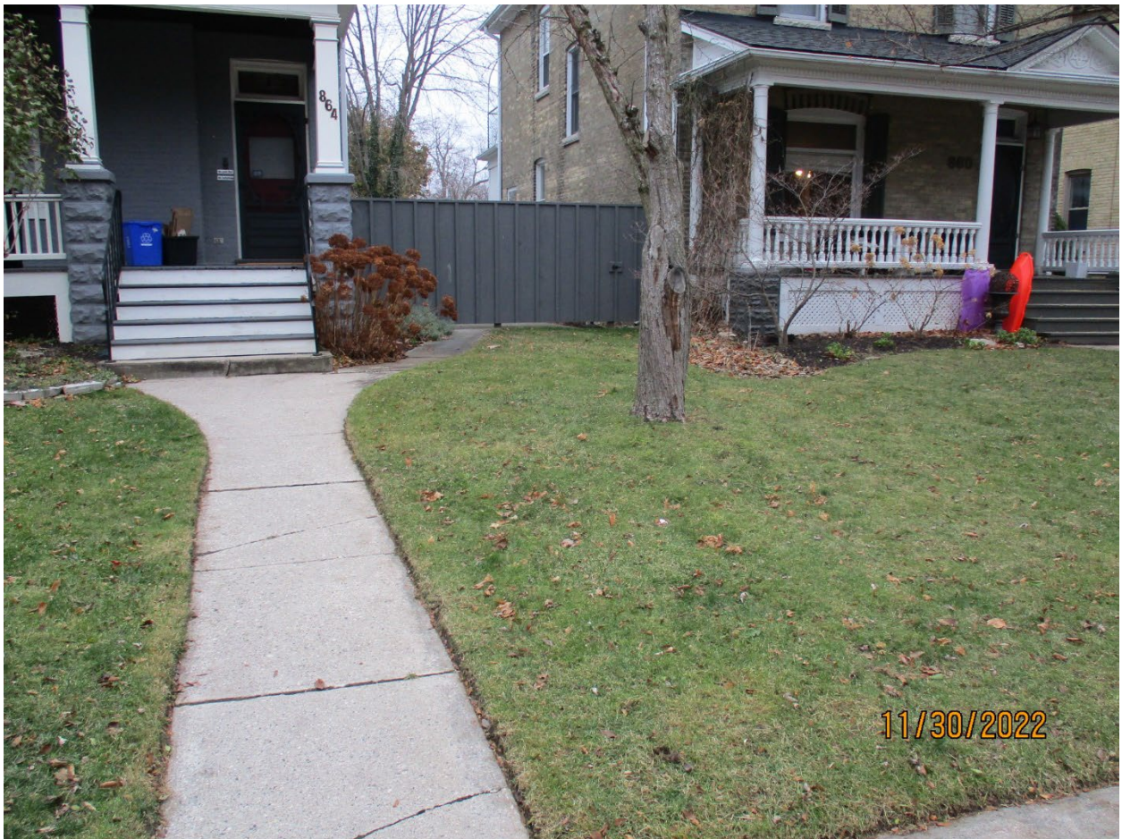
Image 4: Photograph showing existing walkway and landscaping in front yard at 864 Hellmuth Avenue.