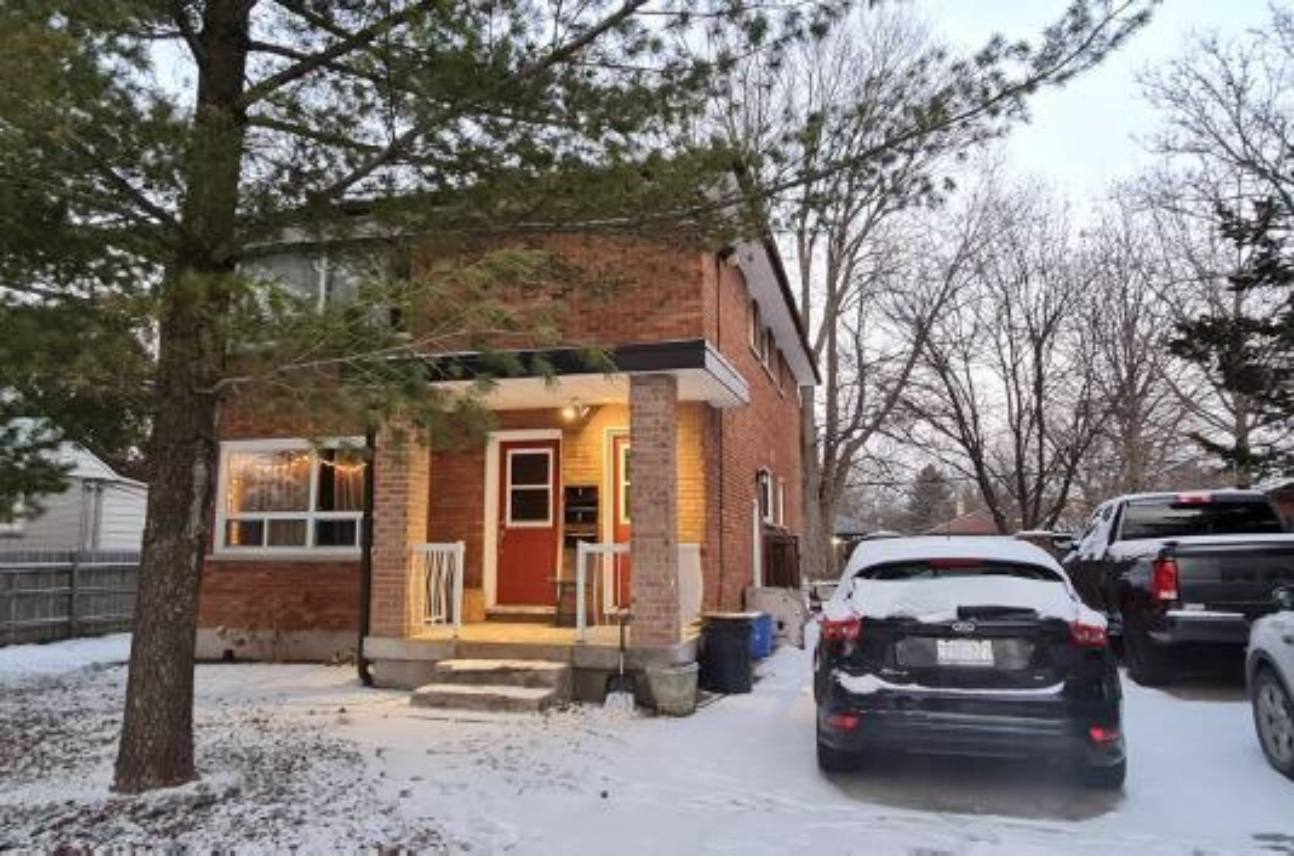
Conceptual Rendering (east view from Chesterfield Avenue)

The above images represent the applicant’s proposal as submitted and may change.