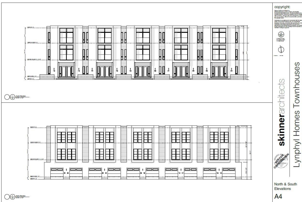
North and South Elevations