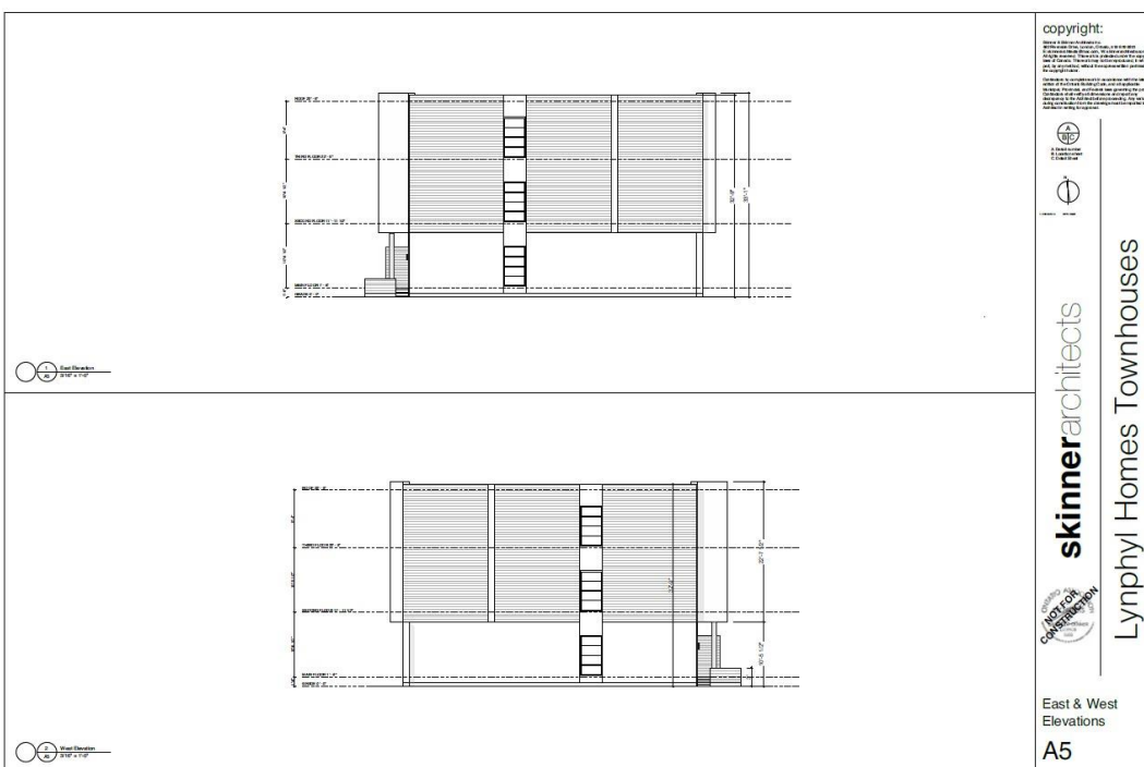
East and West Elevations

The above images represent the applicant's proposal as submitted and may change.