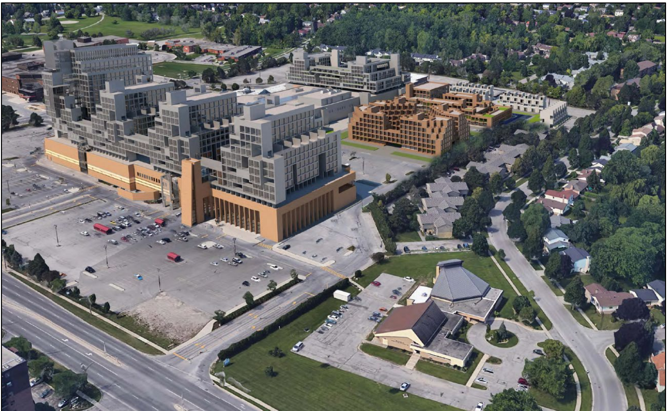
Southeast View – Wonderland Road South

The above images represent the applicant's proposal as submitted and may change.