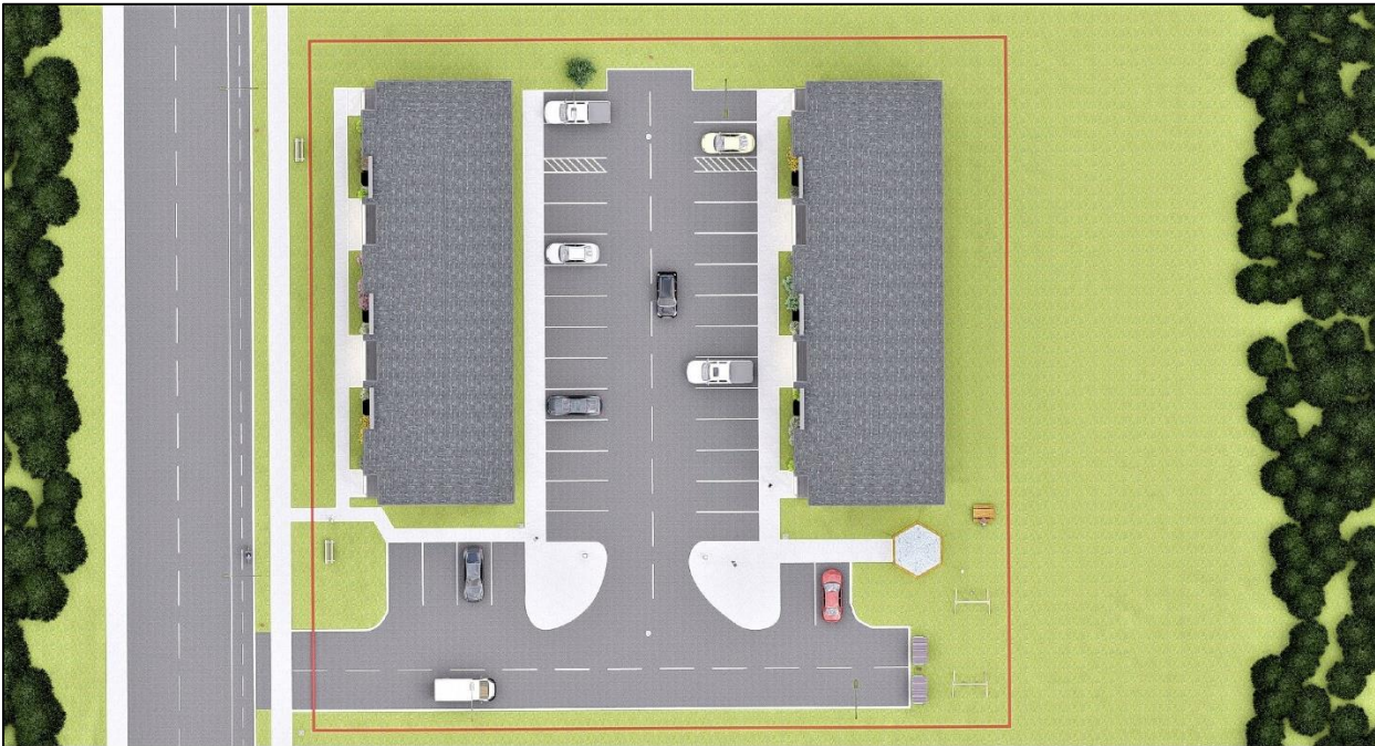
Conceptual Rendering (aerial view)

The above images represent the applicant's proposal as submitted and may change.