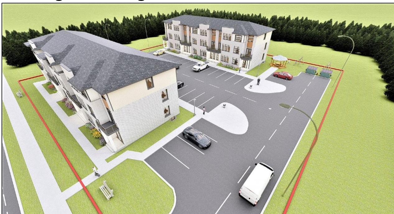
Conceptual Rendering (looking west from Fanshawe Park Road East)