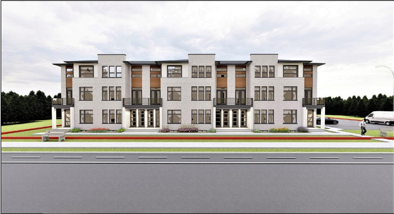
Conceptual Rendering (view from Fanshawe Park Road East)