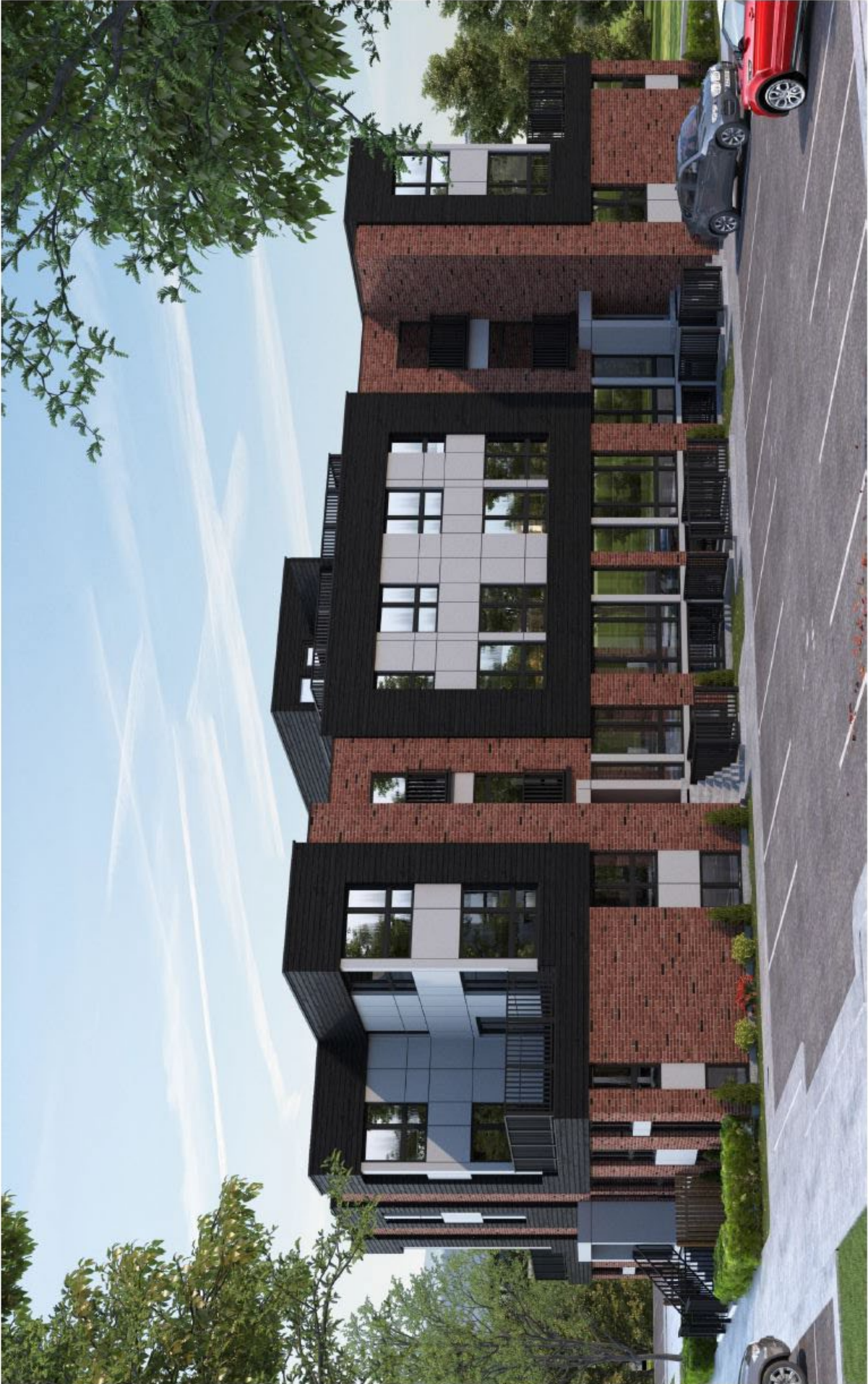
Proposed Renderings for Stacked Townhouses

The above images represent the applicant's proposal as submitted and may change.