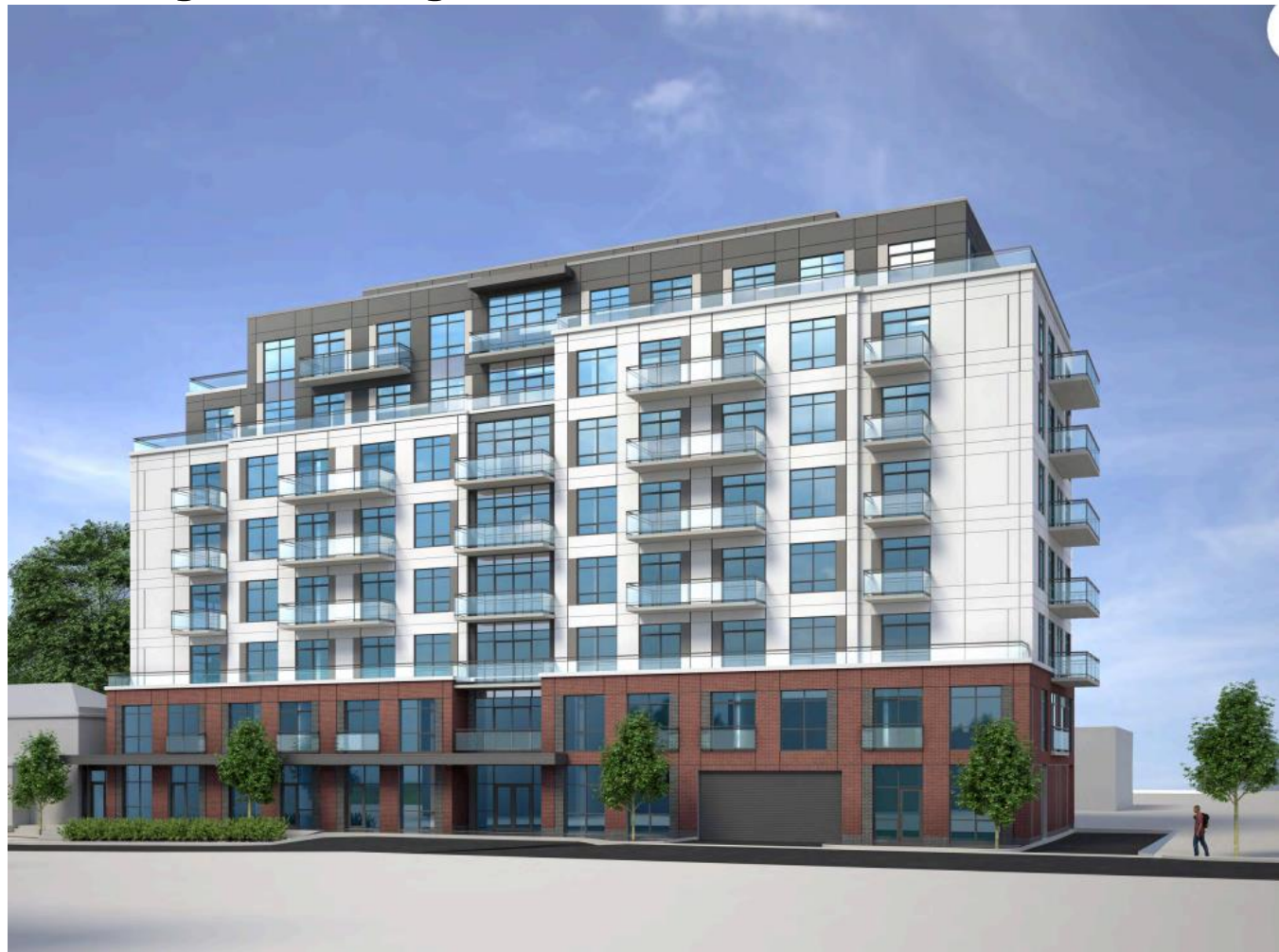
Conceptual Renderings (Front)