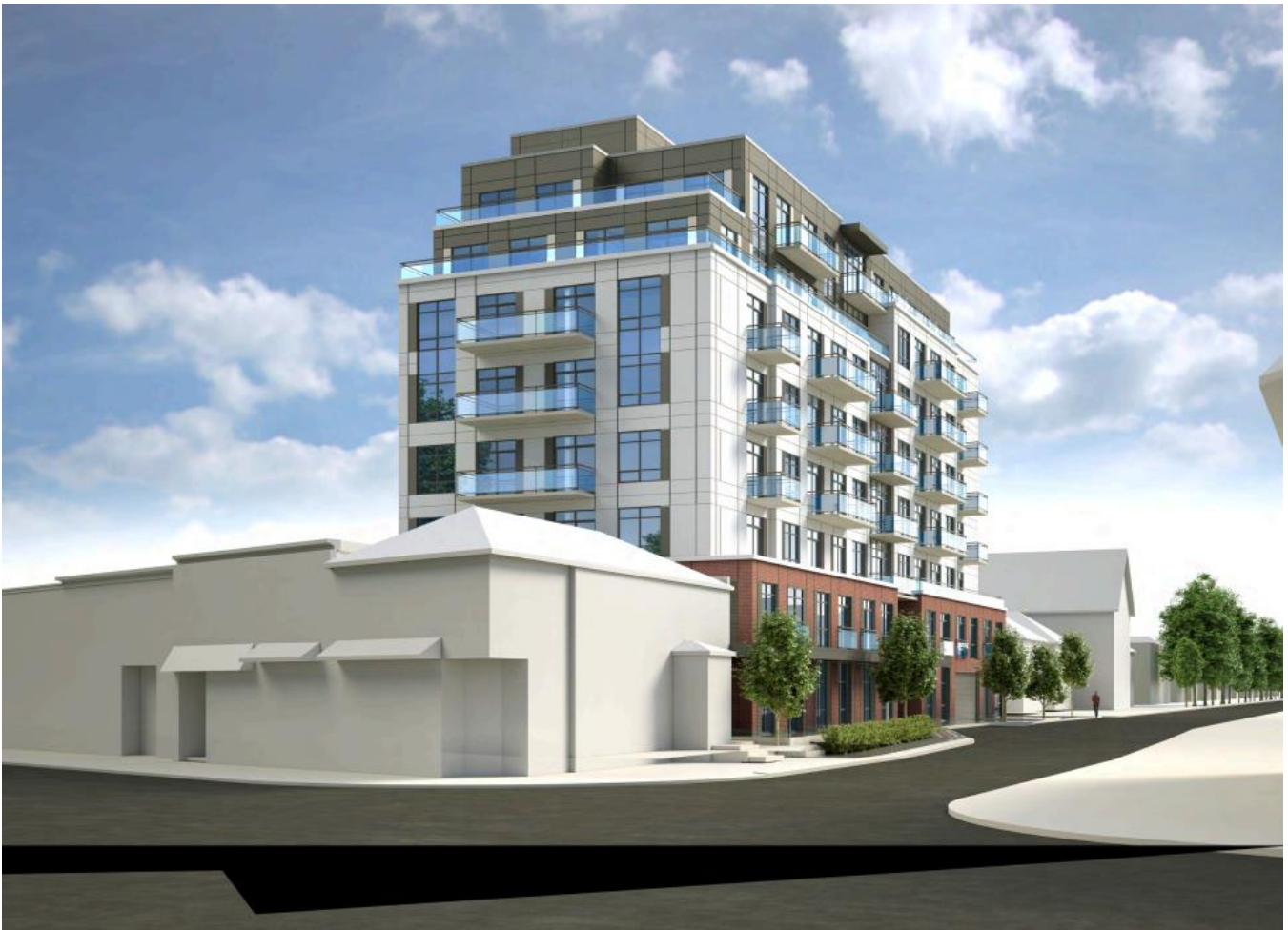
Conceptual Renderings (Looking from Richmond)

The above images represent the applicant's proposal as submitted and may change.