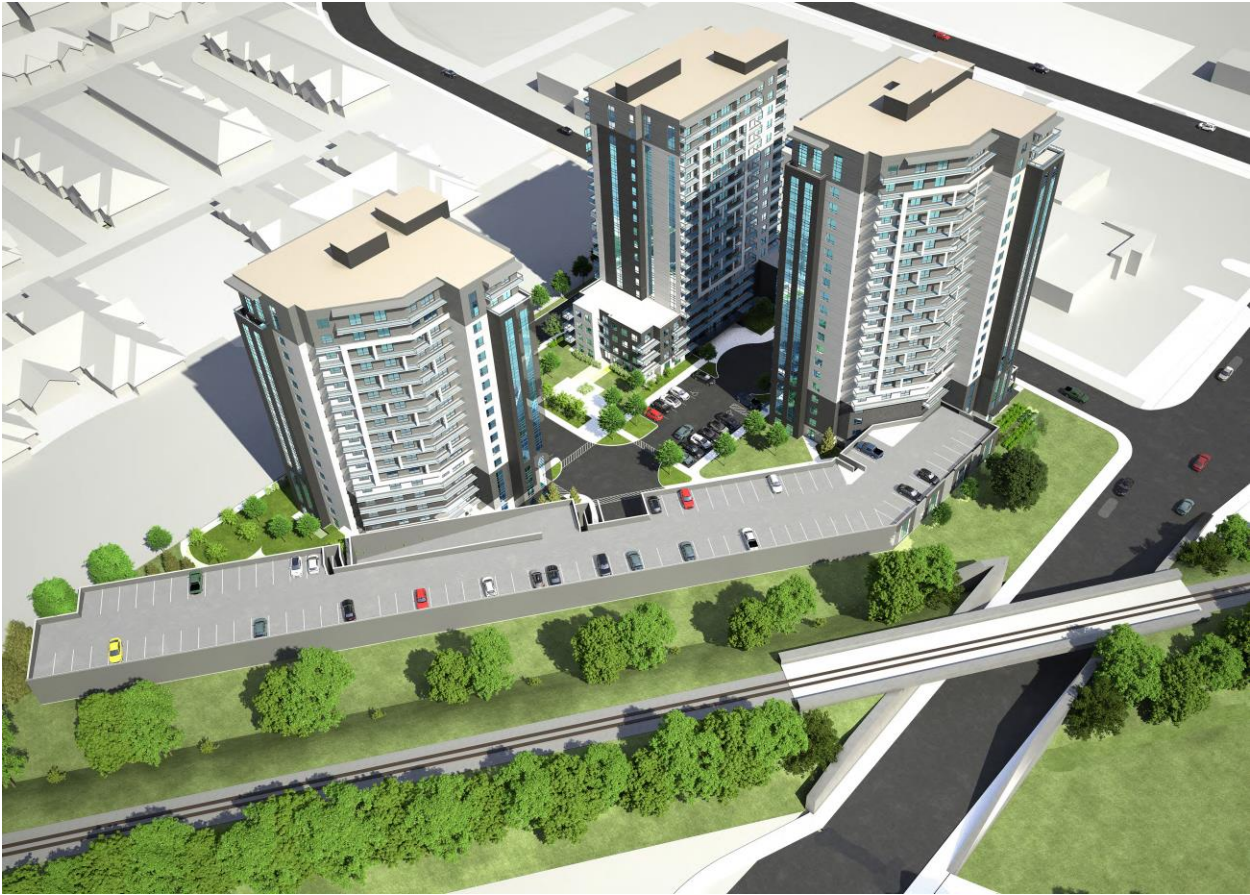
Bird's eye view looking northeast (Building "A" on left).