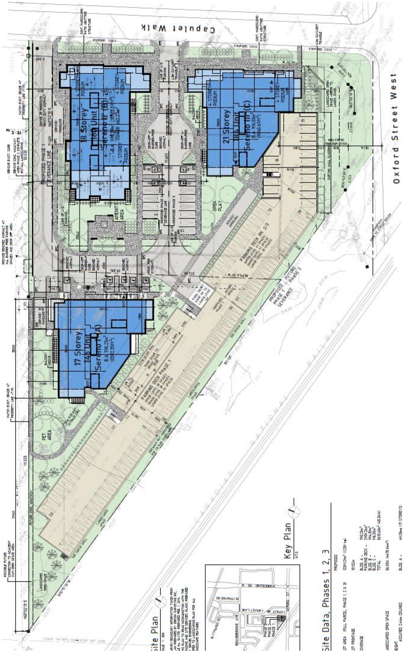
The above image represents the applicant's proposal as submitted and may change.