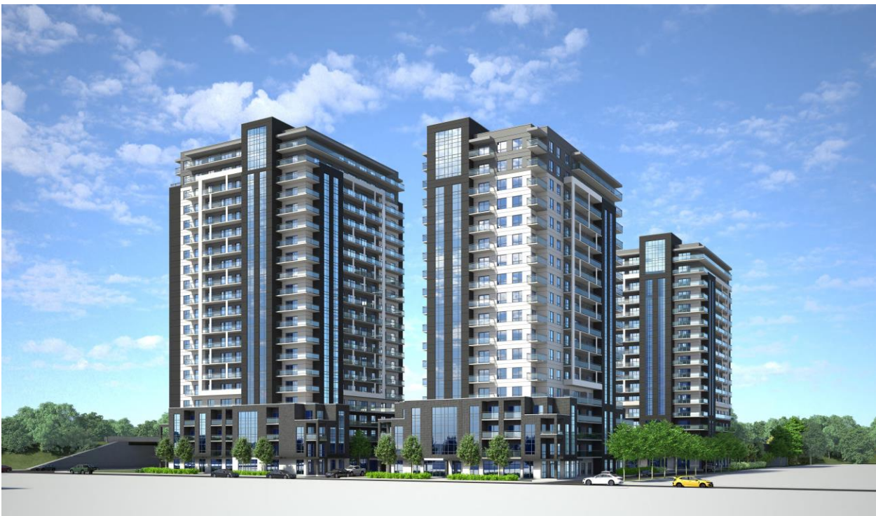
View looking southwest (Building "B" in centre).

The above images represent the applicant's proposal as submitted and may change.