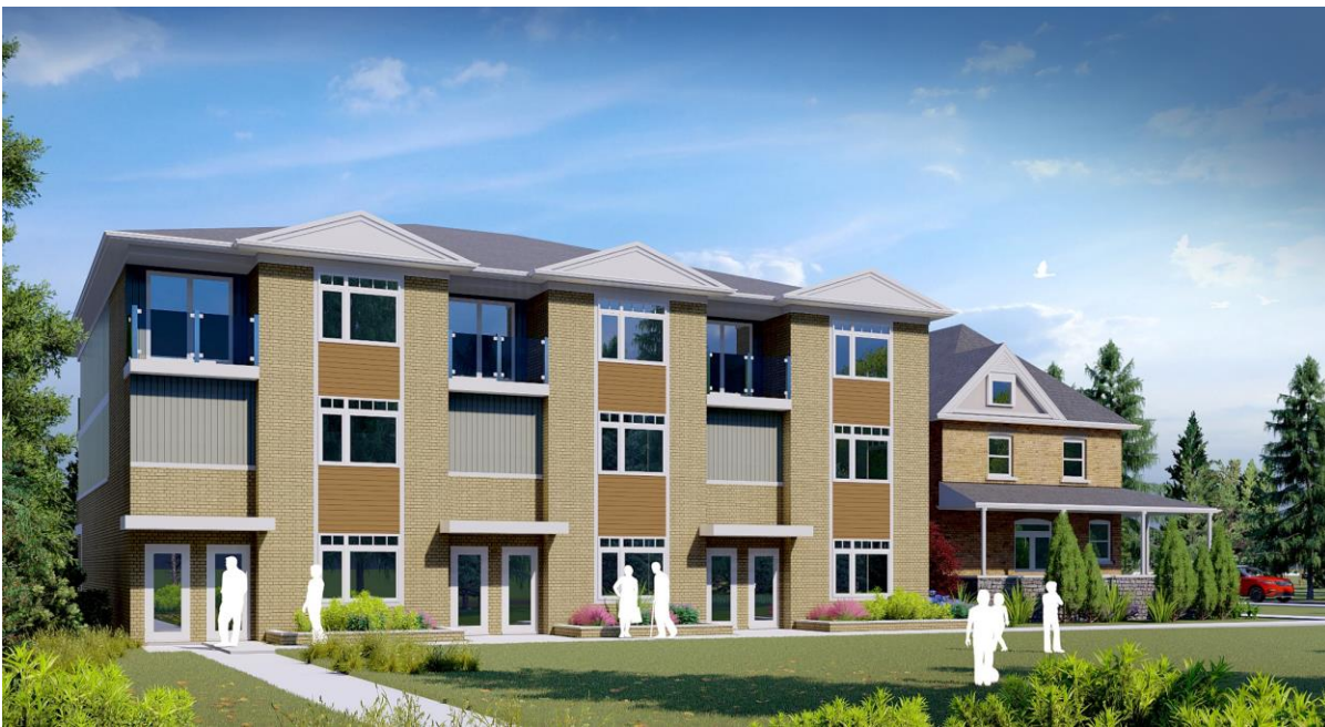
Conceptual Rendering 2

The above images represent the applicant's proposal as submitted and may change.