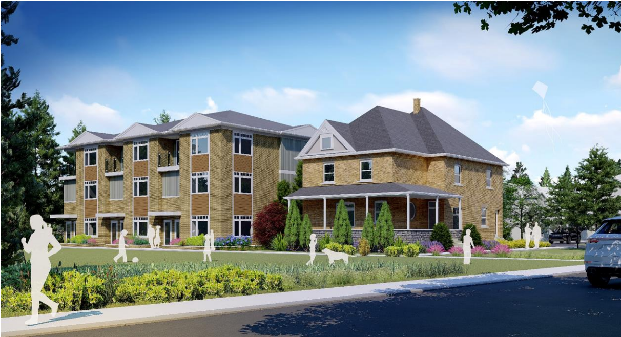
Conceptual Rendering 1