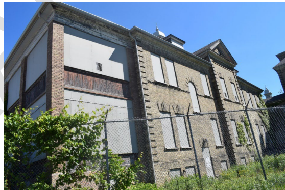
Photo 13: Infirmary south elevation of west wing looking northeast