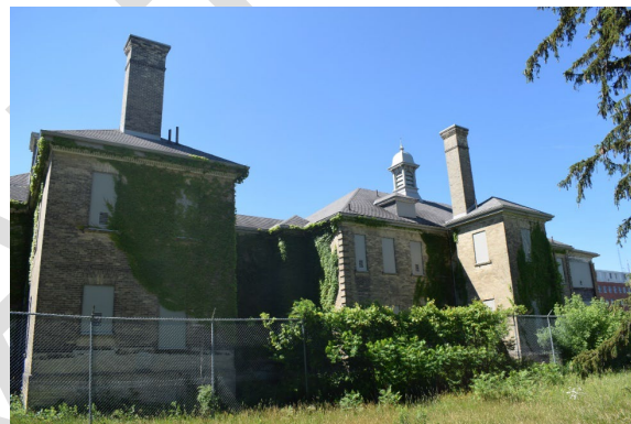
Photo 17: Infirmary rear elevation of central pavilion and west wing looking southwest

The Recreation Hall is a one-storey structure with gallery and basement. The structure has a gable roof with slate roofing and asphalt shingles, and modern ventilators (Photo 18). The building has a central block with four flanking wings (Photo 19 and Photo 20). It has a reddish-brown brick exterior laid in a common bond with stone detailing including a single course of rough faced stone. The front (north) façade has a symmetrical frontispiece with pediment and decorative woodwork. The frontispiece has a central bull's eye window with brick surround. The front façade has a central entrance with an overhang. The entrance is accessed by concrete stairs and a concrete ramp with metal railings. The four flanking wings each have pedimented rooflines with decorative woodwork. The exterior mostly has flat-headed window openings with brick voussoirs, except for the front façade that has two semi-oval openings and the south elevation that has a semi-circular window opening (Photo 21). The Recreation Hall has five entrances.