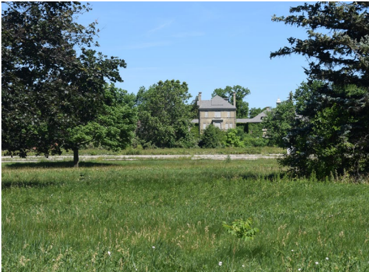
Photo 30: Open space to the south of the Infirmary looking northeast