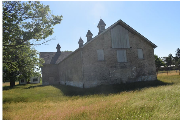
Photo 35: Open space surrounding Horse Stable with mature trees on north side