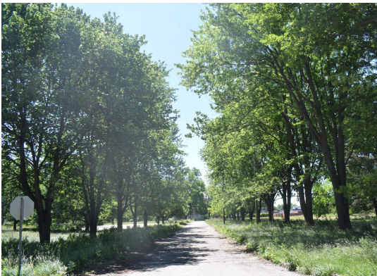
Photo 32: Campus Zone tree-lined driveway looking south towards Infirmary