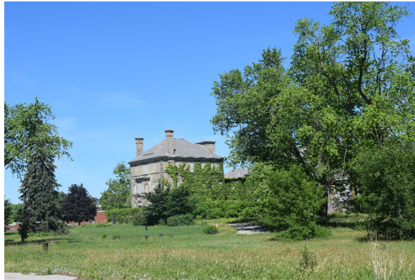
Photo 31: Open space to the south of the Infirmary looking northwest