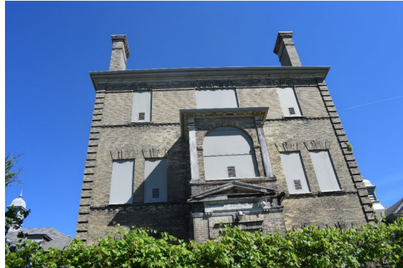
Photo 11: Infirmary south elevation of Administration Block looking north