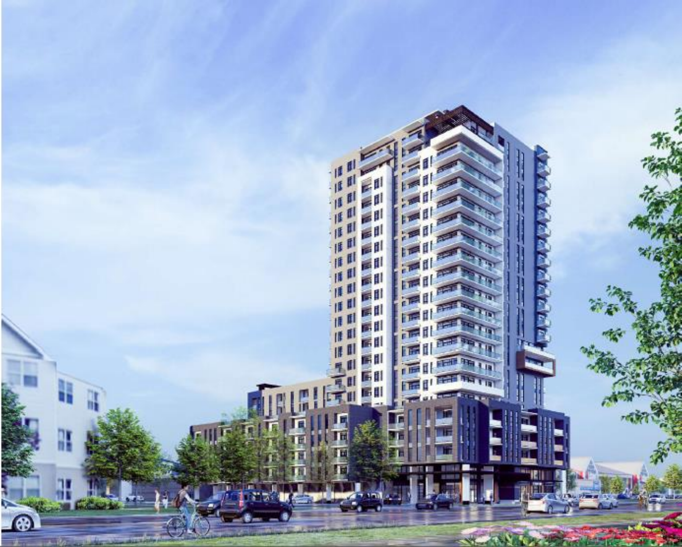
Building Rendering – Southwest corner of Fanshawe Park Road and North Centre Road