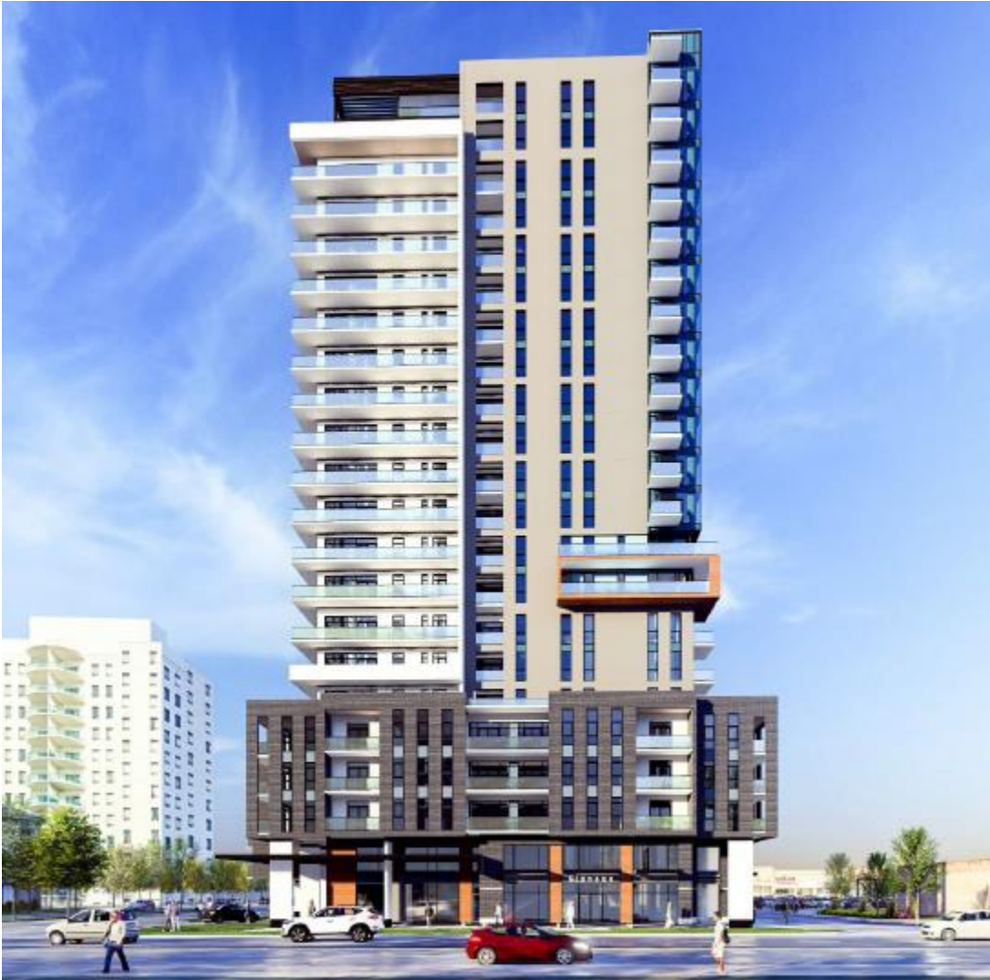
Building Rendering – South view looking north from Fanshawe Park Road