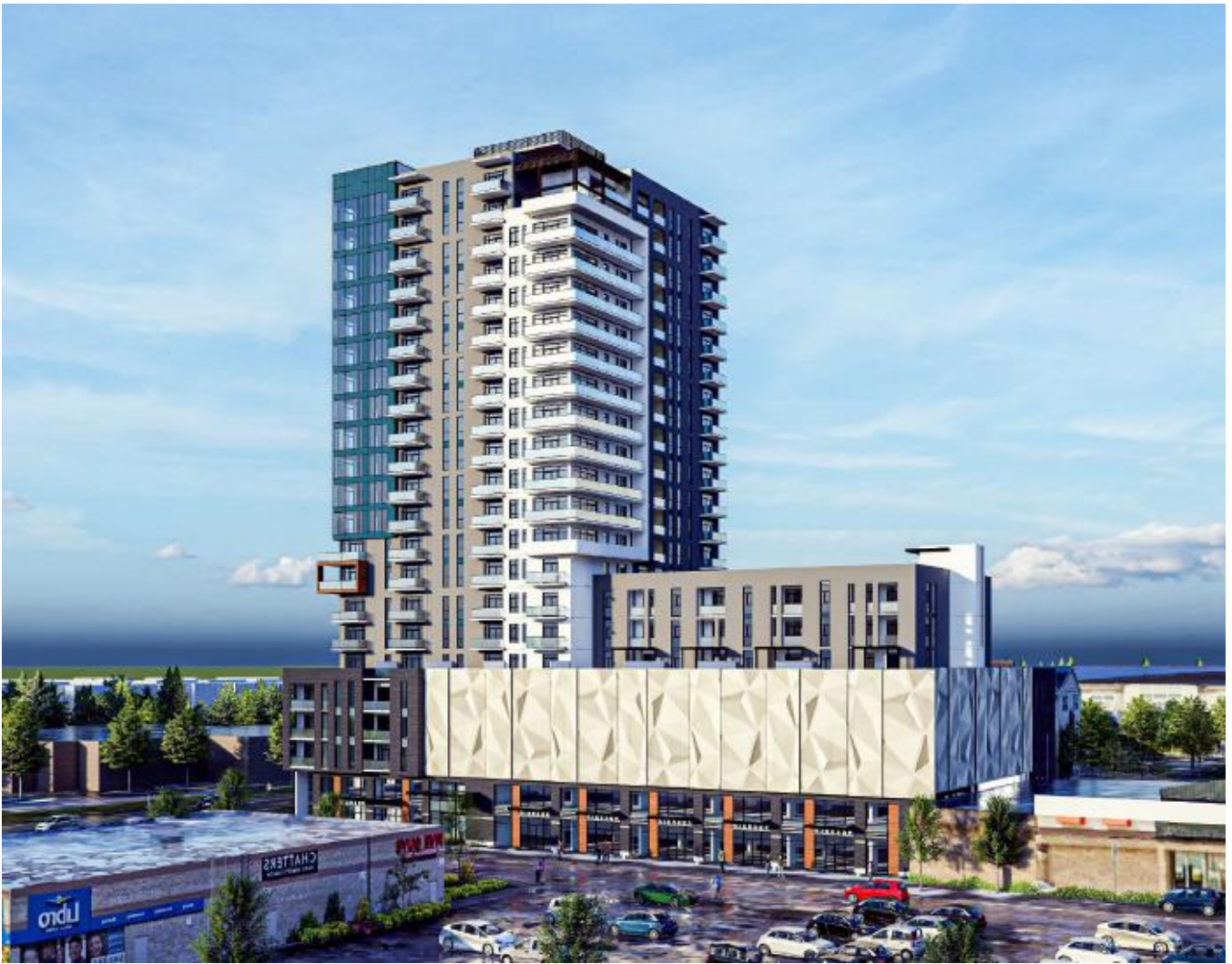
Building Rendering – East view looking southwest from Richmond Street

The above images represent the applicant's proposal as submitted and may change.