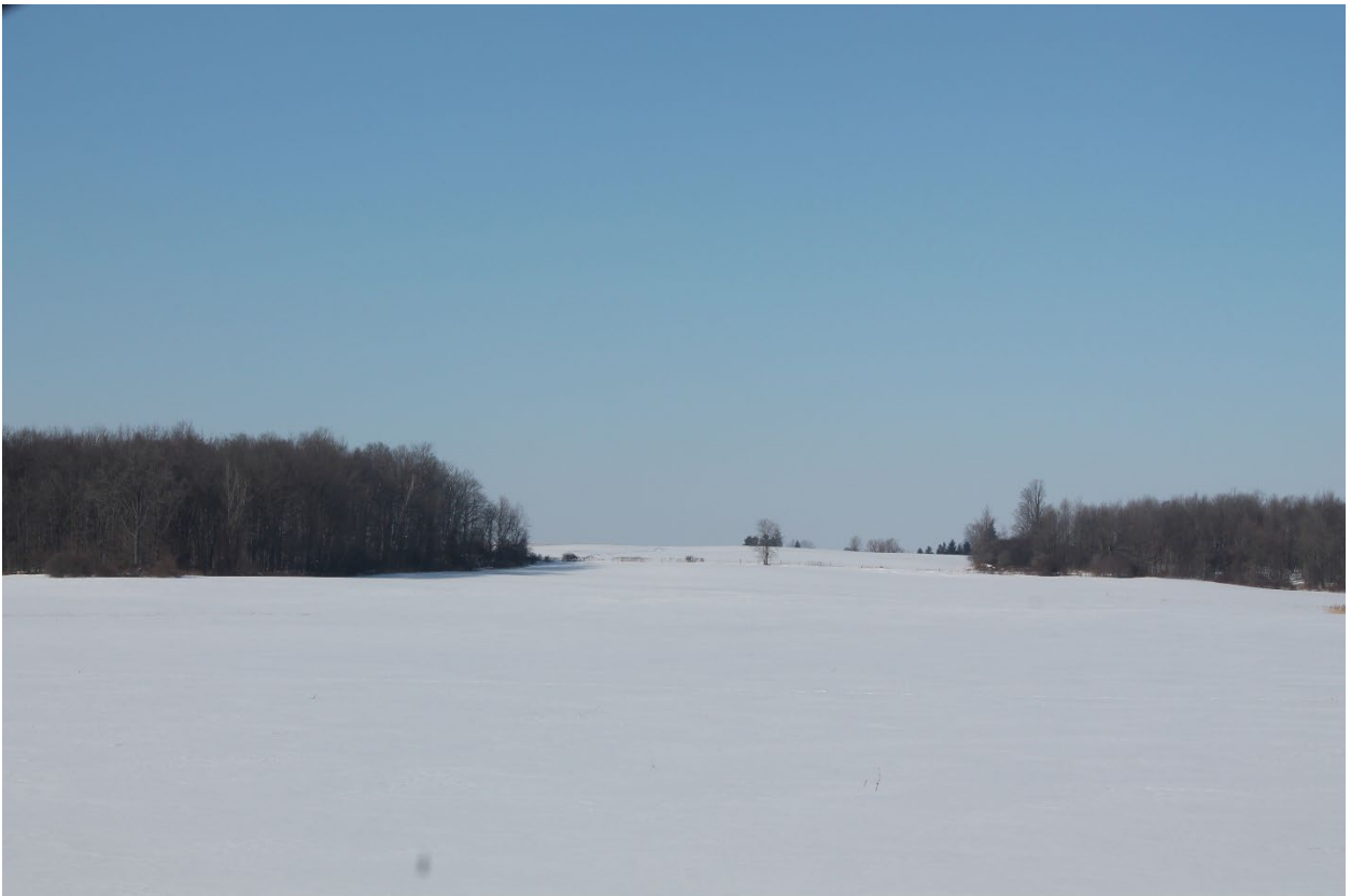
Image 2: Photograph looking north from Sunningdale Road West showing the subject property (2022).