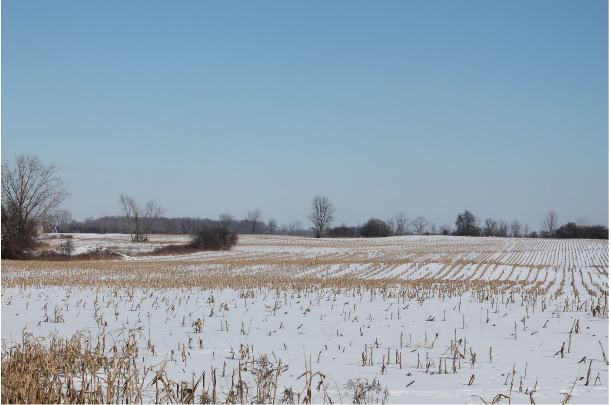
Image 1: Photograph looking east from Hyde Park Road, showing the subject property (2022).