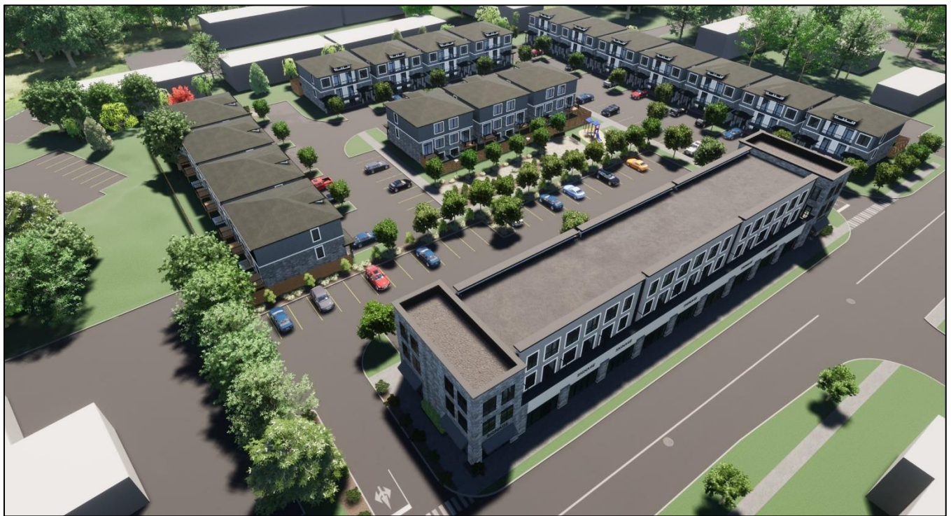
Aerial view from King Edward Avenue looking south

The above image represent the applicant's proposal as submitted and may change.