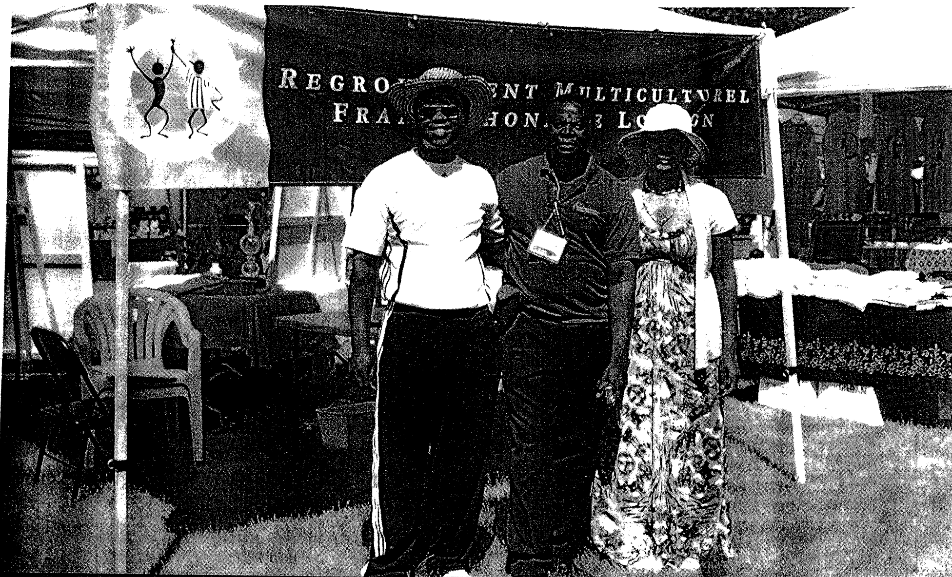
London Célèbre Canada London Celebrates Canada