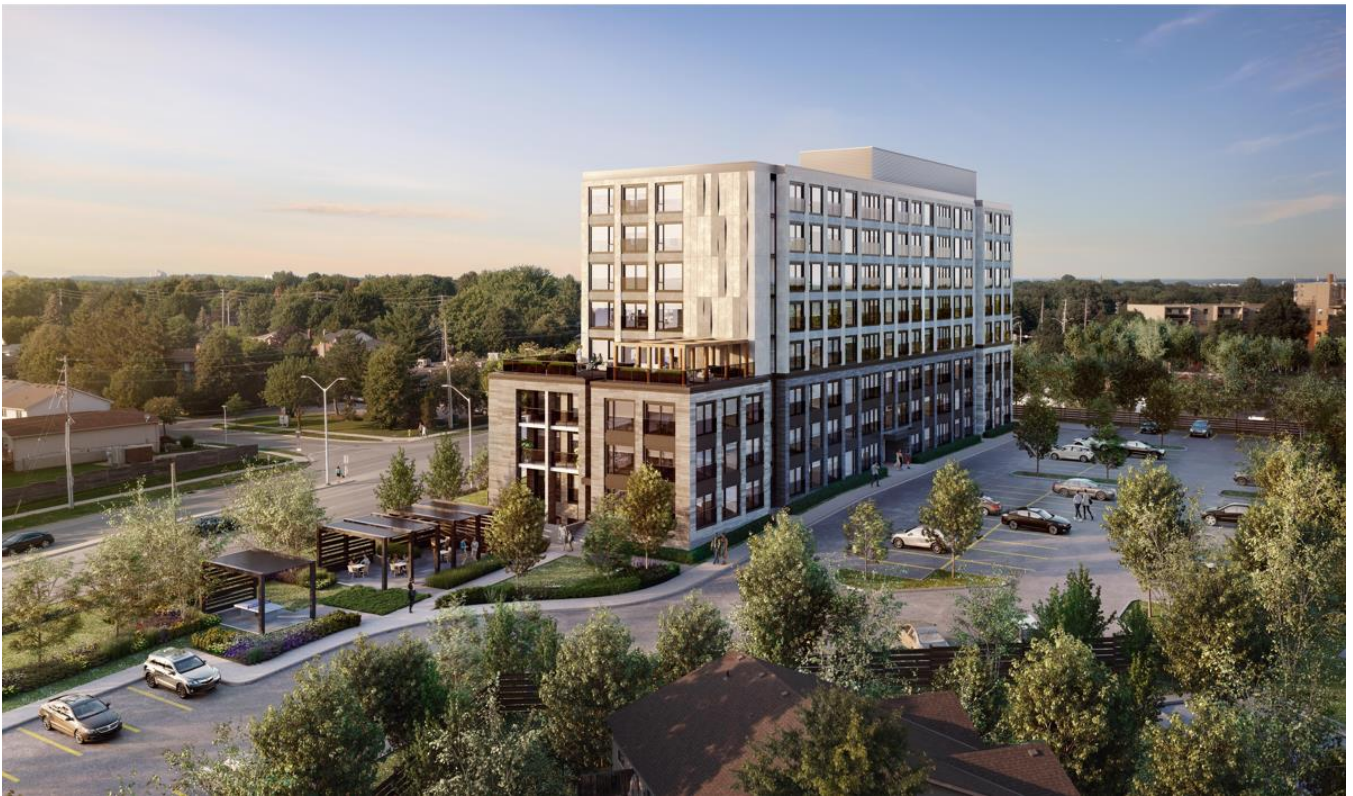
The above images represent the applicant's proposal as submitted and may change.