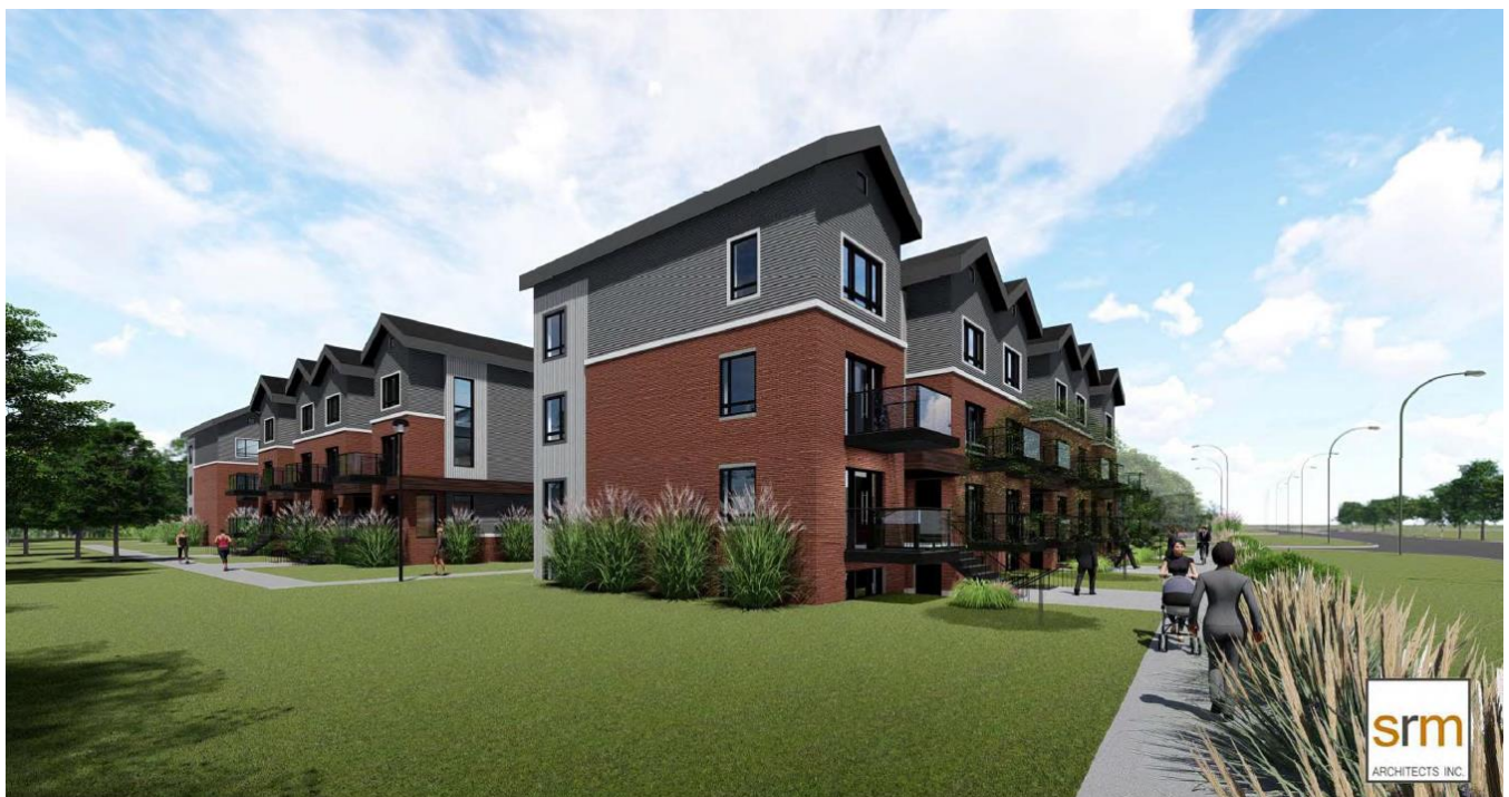
View of Townhouses from Colonel Talbot Road

The above images represent the applicant's proposal as submitted and may change.