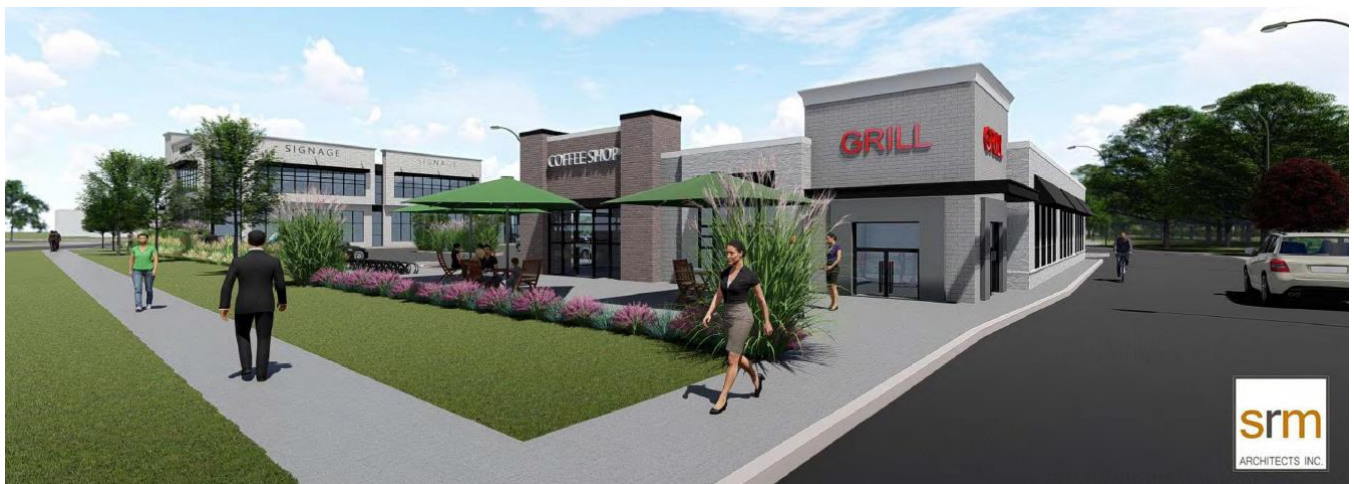
View of commercial building from Southdale Road West