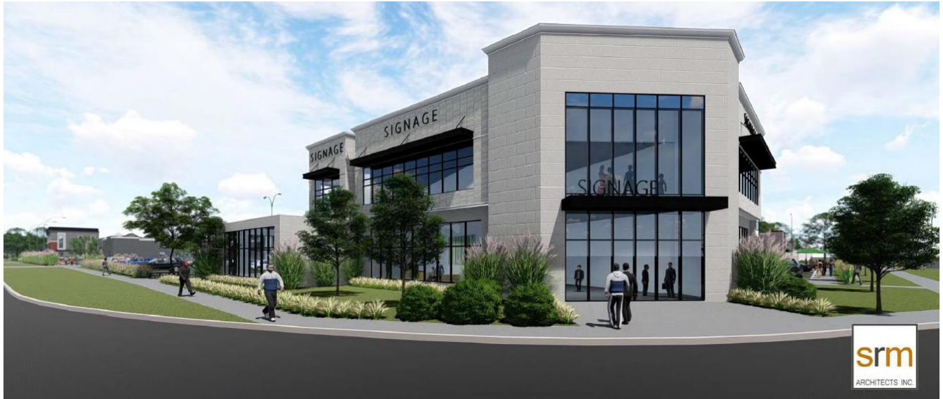
View of commercial/office from intersection of Southdale Road West and Colonel Talbot Road