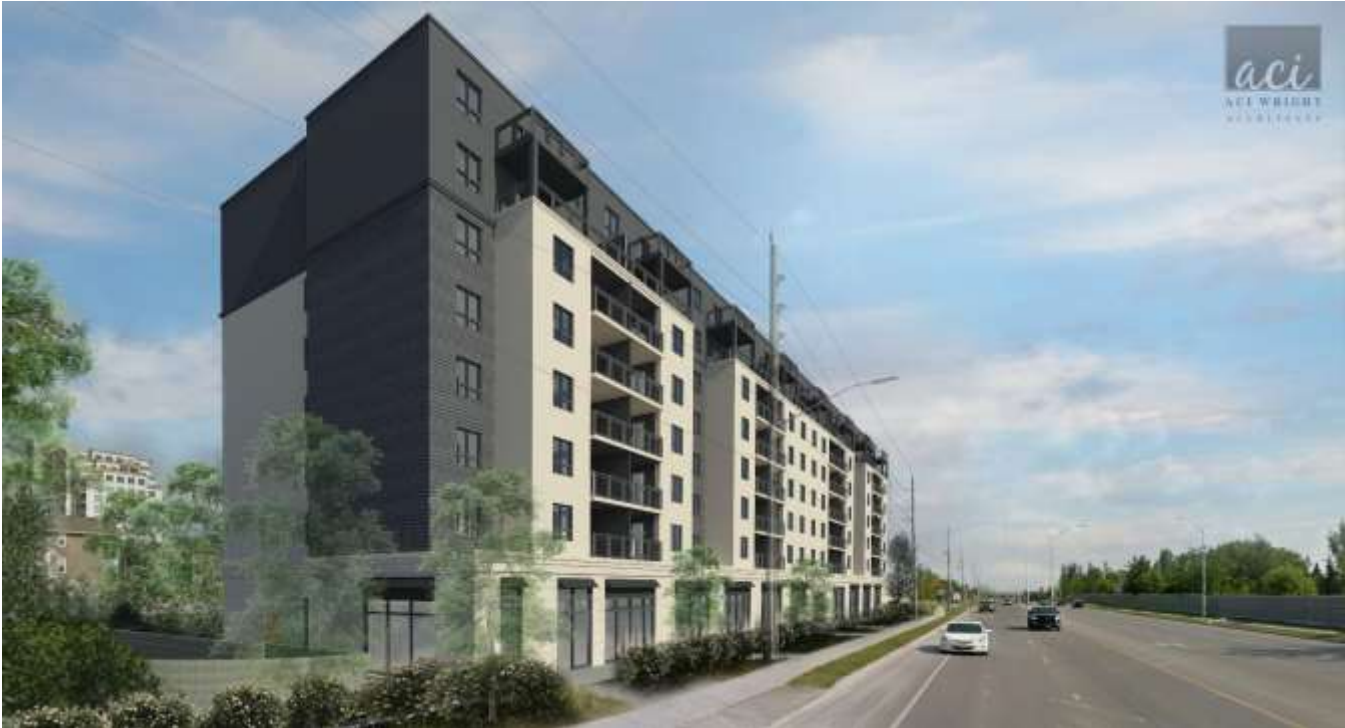
View facing southeast on Hyde Park Road

The above images represent the applicant's proposal as submitted and may change.