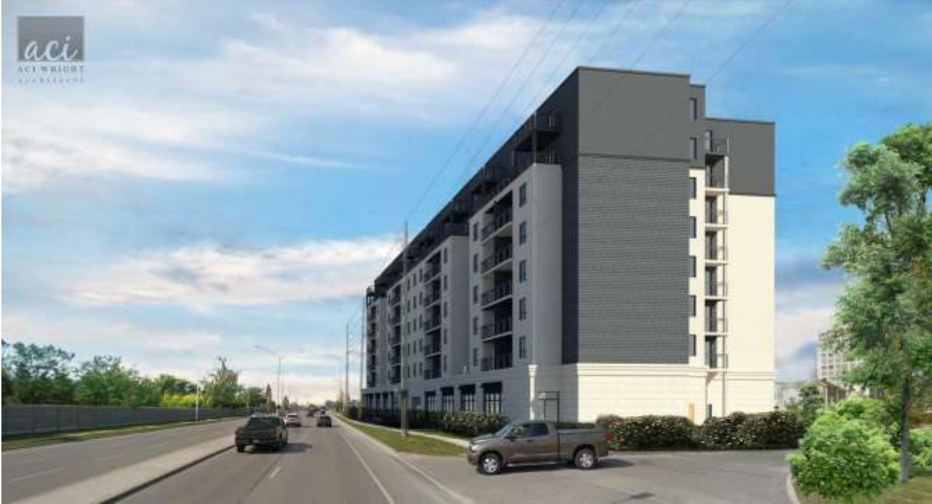
View facing northwest on Hyde Park Road