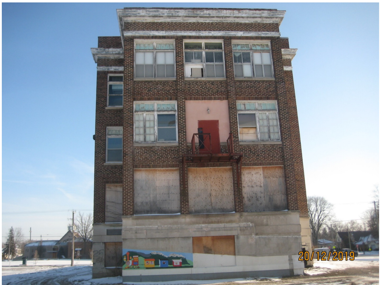
Image 10: Photograph showing the west facade of the War Memorial Children's Hospital.