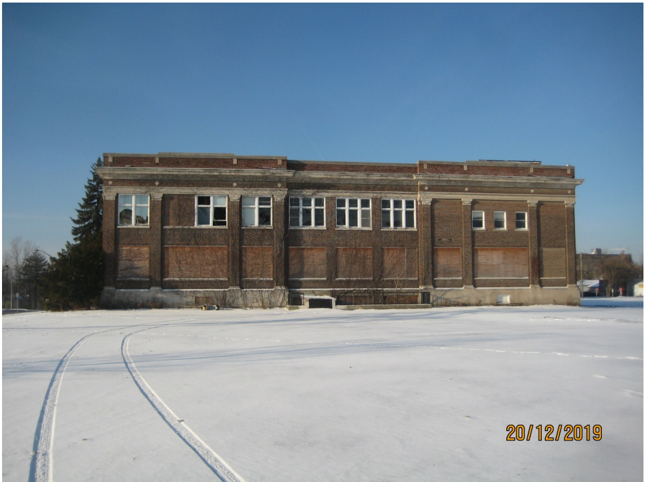
Image 4: Photograph showing the east facade of the Health Services Building on the Old Victoria Hospital Lands.