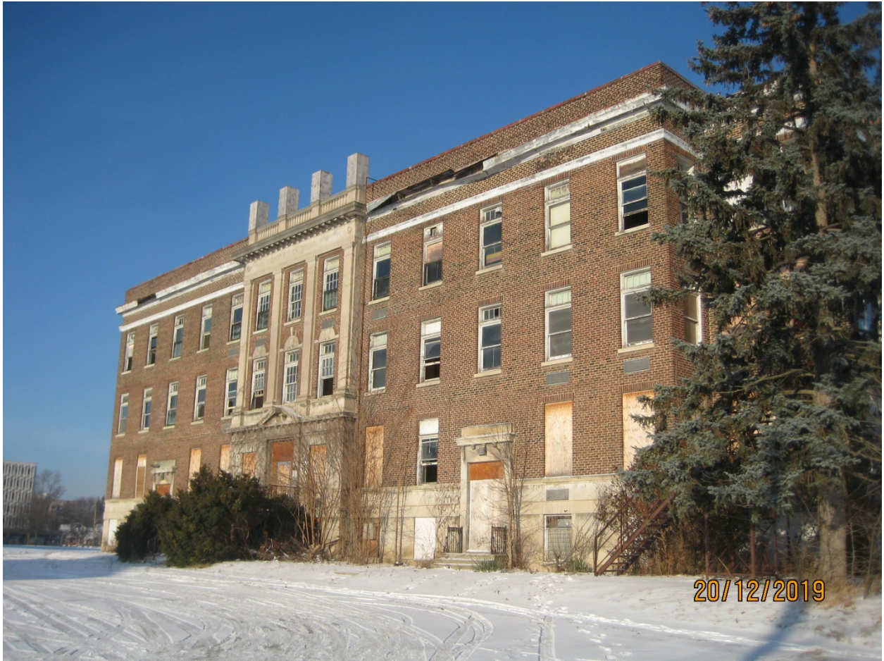
Image 7: Photograph showing the south facade of the War Memorial Children's Hospital.