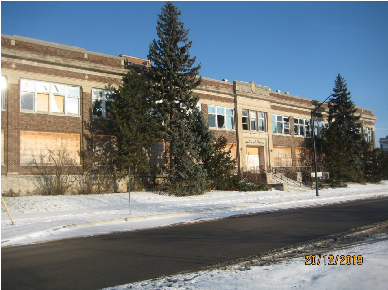
Image 1: Photograph showing the south façade of the Health Services Building located on the Old Victoria Hospital Lands.