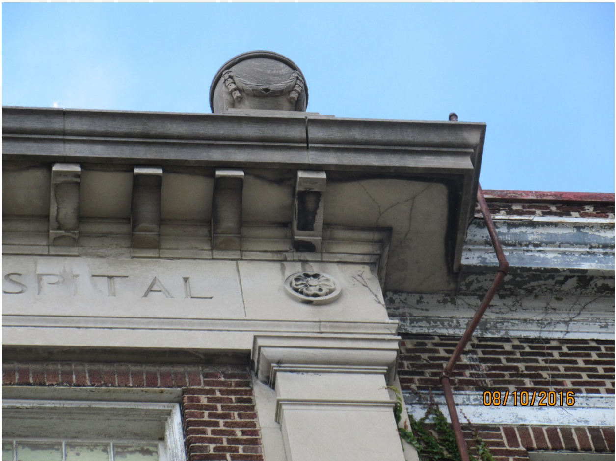
Image 14: Detail showing cornice and bracket detailing on the War Memorial Children's Hospital.