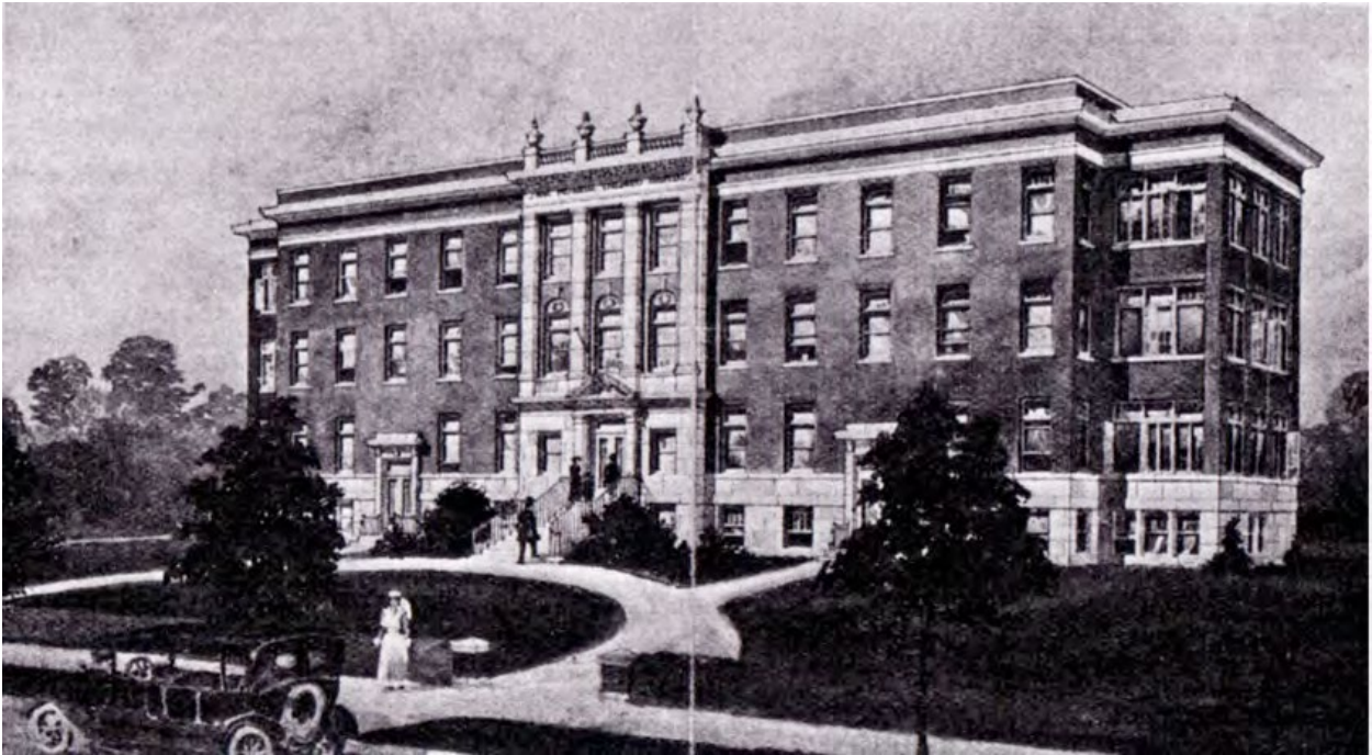
Image 17: Perspective drawing of the proposed War Memorial Children's Hospital, by Watt & Blackwell (Tausky, 2011).