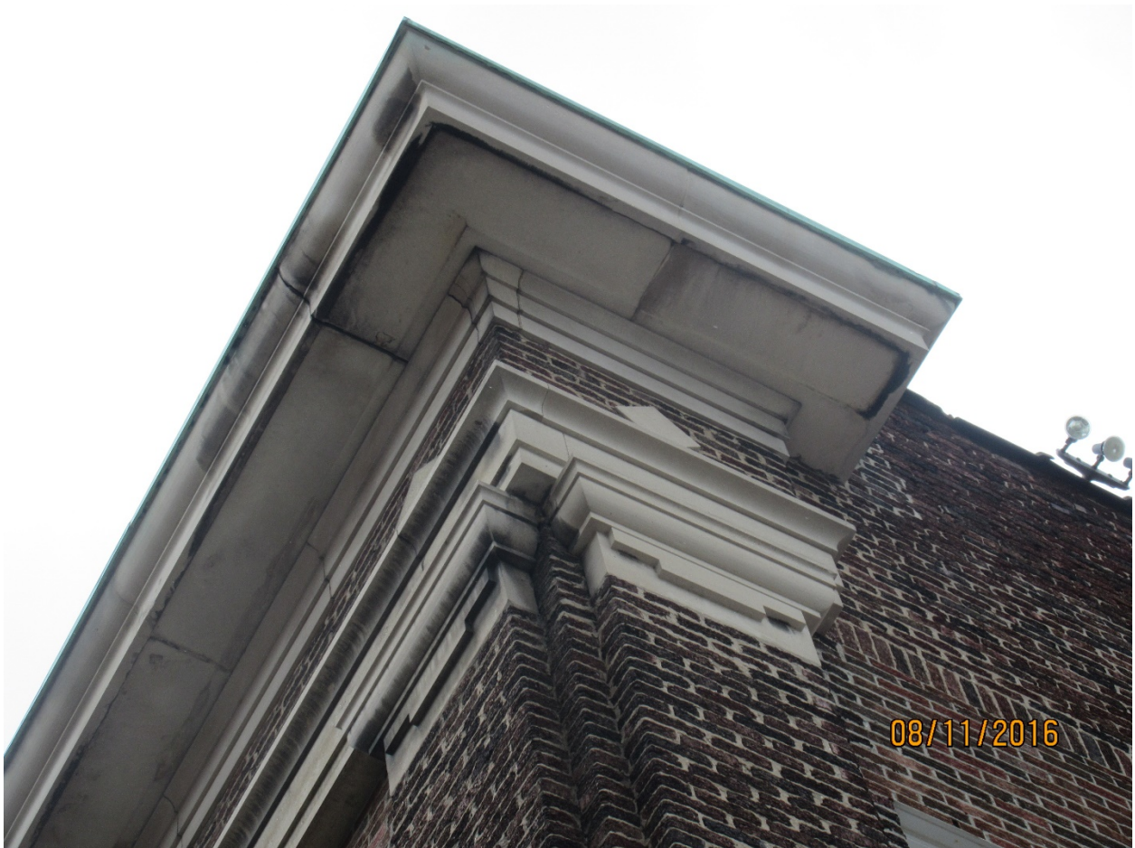
Image 6: Detail showing pilasters and cornice on the Health Services Building.