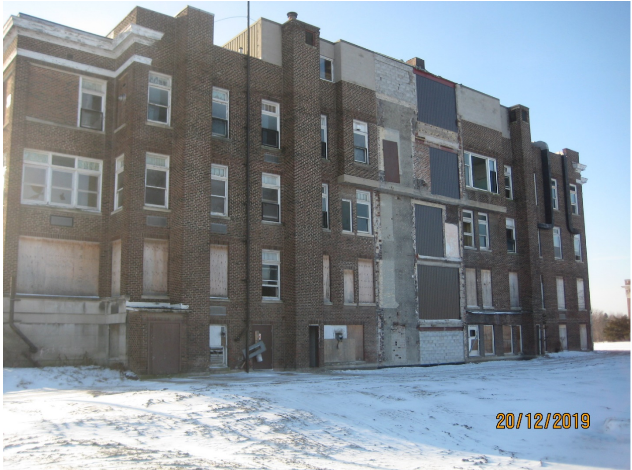
Image 9: Photograph showing the north (rear) facade of the War Memorial Children's Hospital.