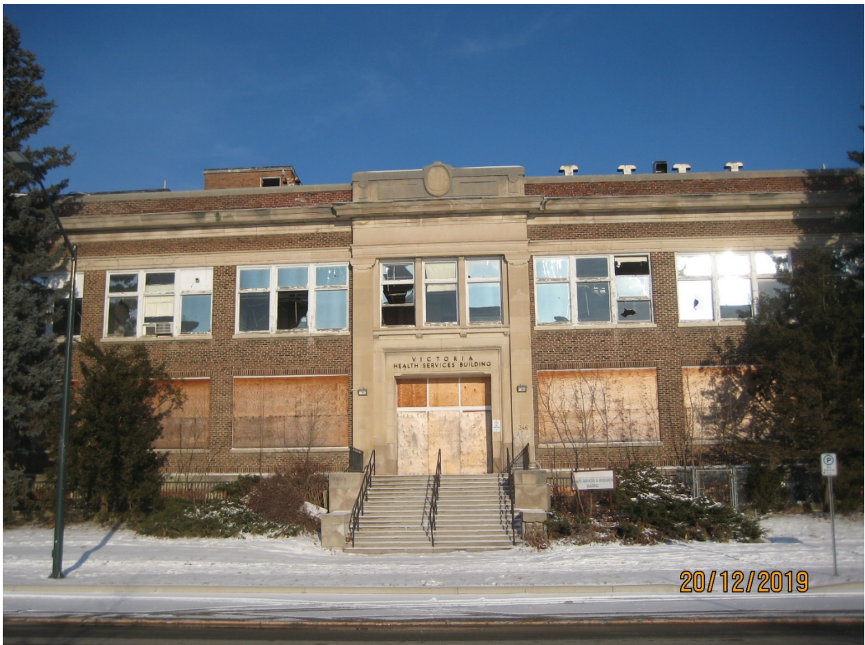
Image 2: Photograph showing the south façade of the Health Services Building located on the Old Victoria Hospital Lands.