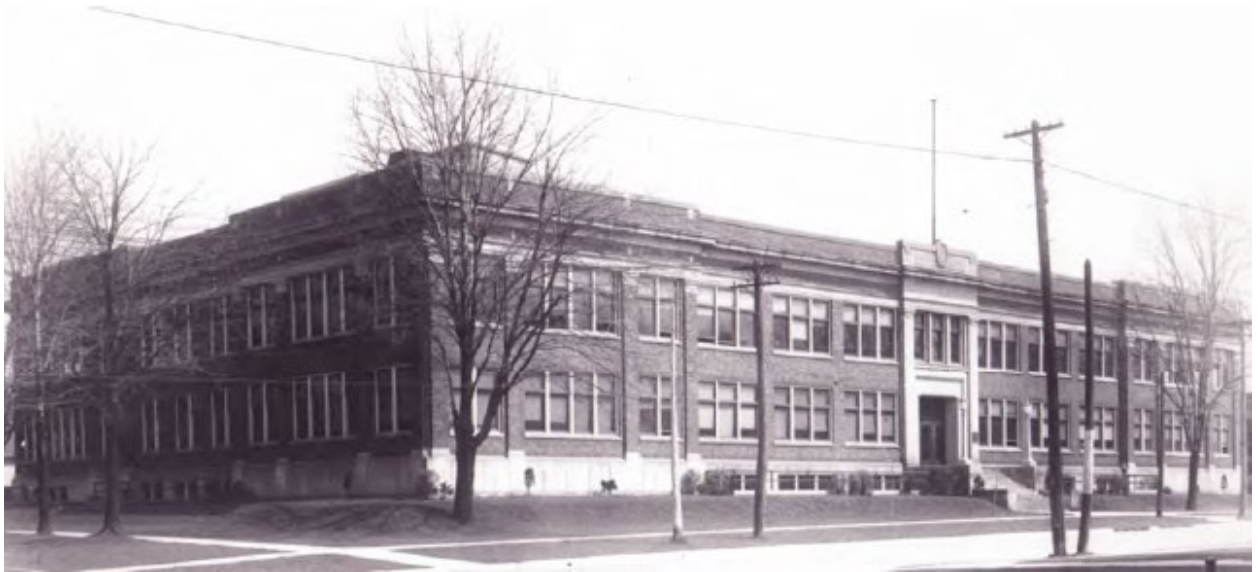
Image 15: Health Services Building, c. 1921, known then as The Medical School (Tausky, 2011).