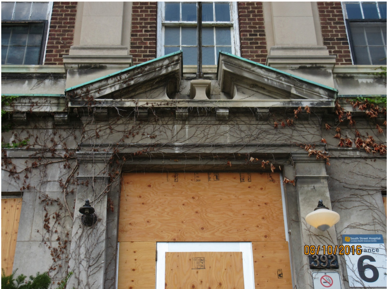
Image 12: Detail showing pediment and stone frontispiece detailing on the War Memorial Children's Hospital.