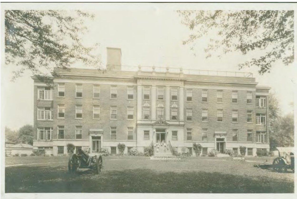
Image 18: Photograph of the War Memorial Children's Hospital, circa 1930 (Tausky, 2011)