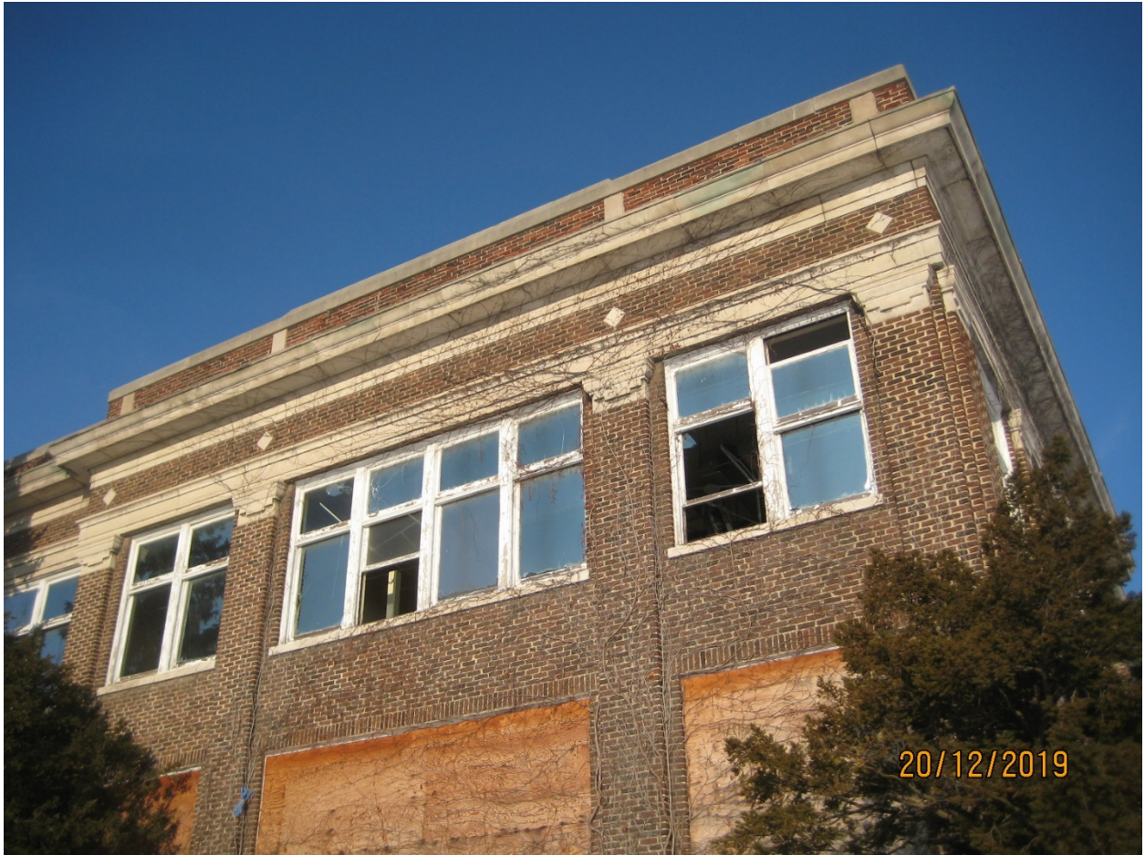
Image 5 Photograph showing pilasters, cornice, and tapestry brick detailing on the Health Services Building.