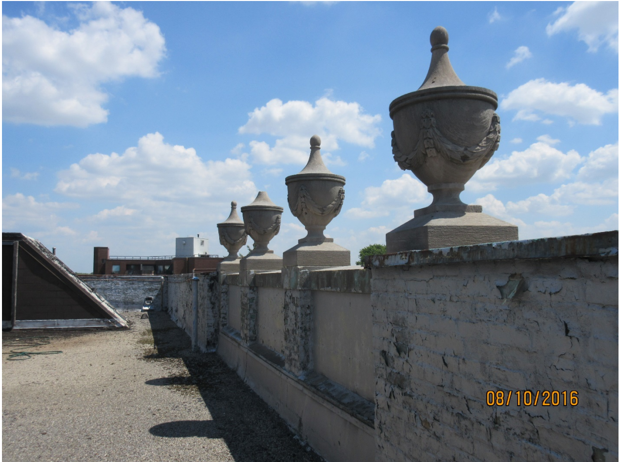
Image 11: Detail showing the four commemorative urns situated on top of the War Memorial Children's Hospital.