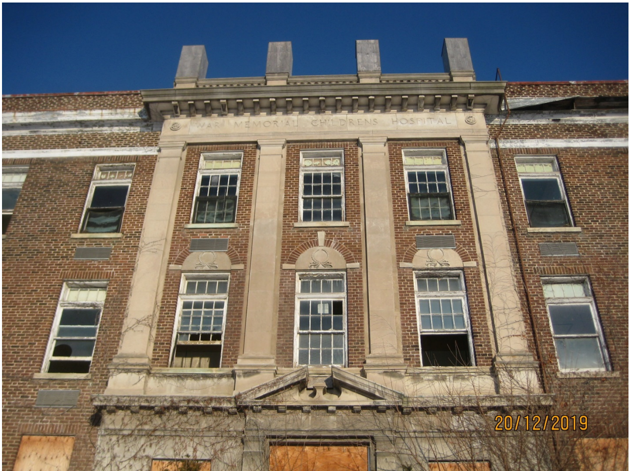
Image 8: Photograph showing the frontispiece and detailing on the War Memorial Children's Hospital.