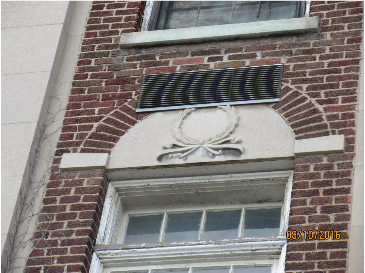
Image 13: Detail showing commemorative wreaths located in the blind transoms above the windows on the War Memorial Children's Hospital.