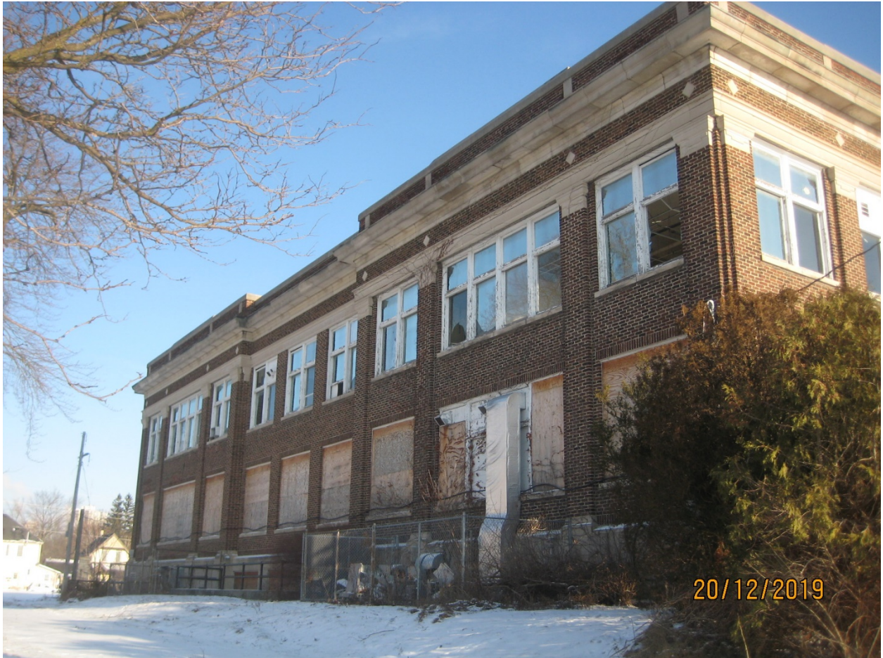
Image 3: Photograph showing the west facade of the Health Services Building on the Old Victoria Hospital Lands.