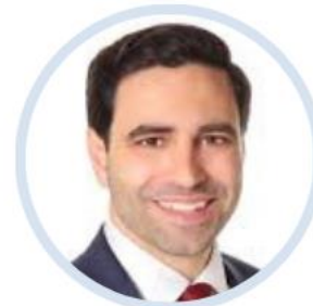
MP Peter Fragiskatos