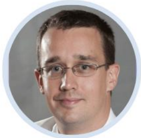
Hon. Monte McNaughton