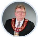
—Ed Holder Mayor, City of London

Bolstering main street businesses is vital to Southwestern Ontario's economic recovery. TechAlliance's 5-10-15 Main Street Innovation Challenge is a solid example of how innovation can help transform businesses and prepare for opportunities ahead."