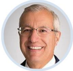
Hon. Victor Fedeli