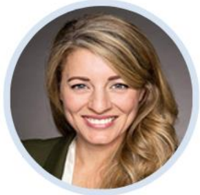
Hon. Mélanie Joly