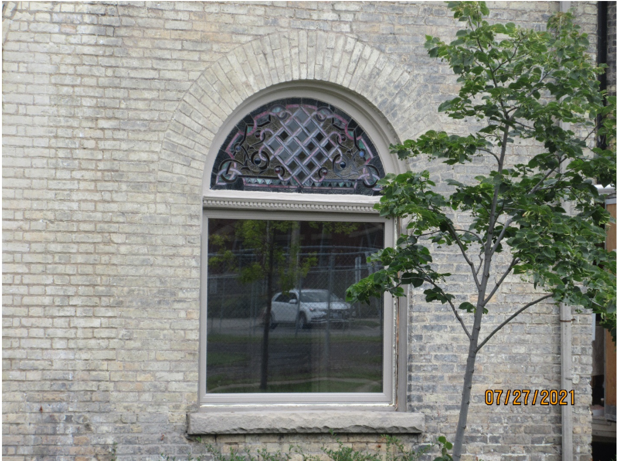
Image 5: Photograph showing the unapproved alterations to the windows at 468 Queens Avenue underway, July 2021.