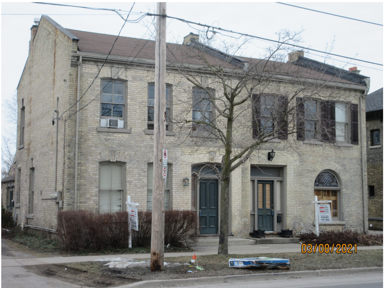
Image 3: Photograph showing the subject properties at 466-468 Queens Avenue, March 2021.