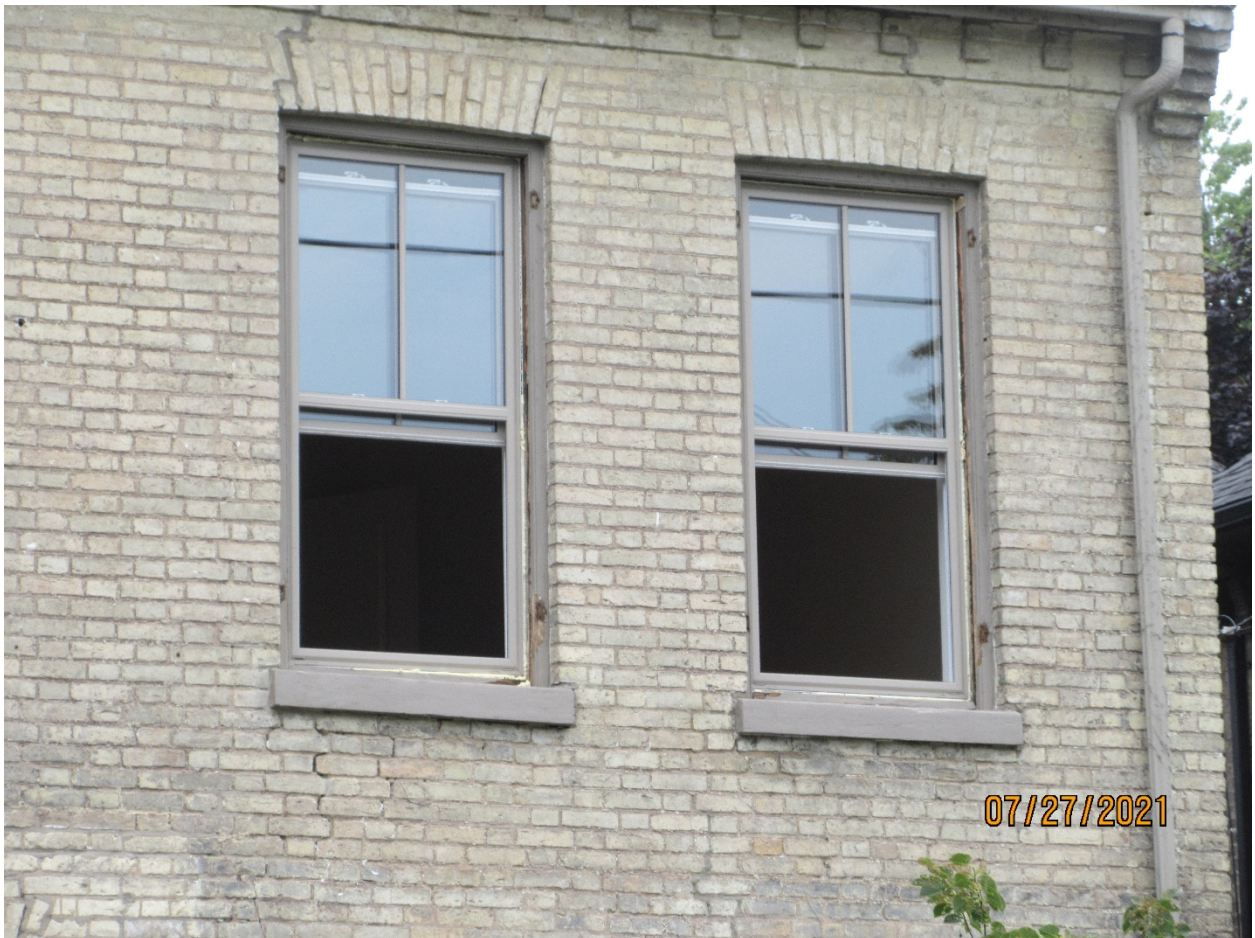
Image 6: Photograph showing the unapproved alterations to the windows at 468 Queens Avenue underway, July 2021.