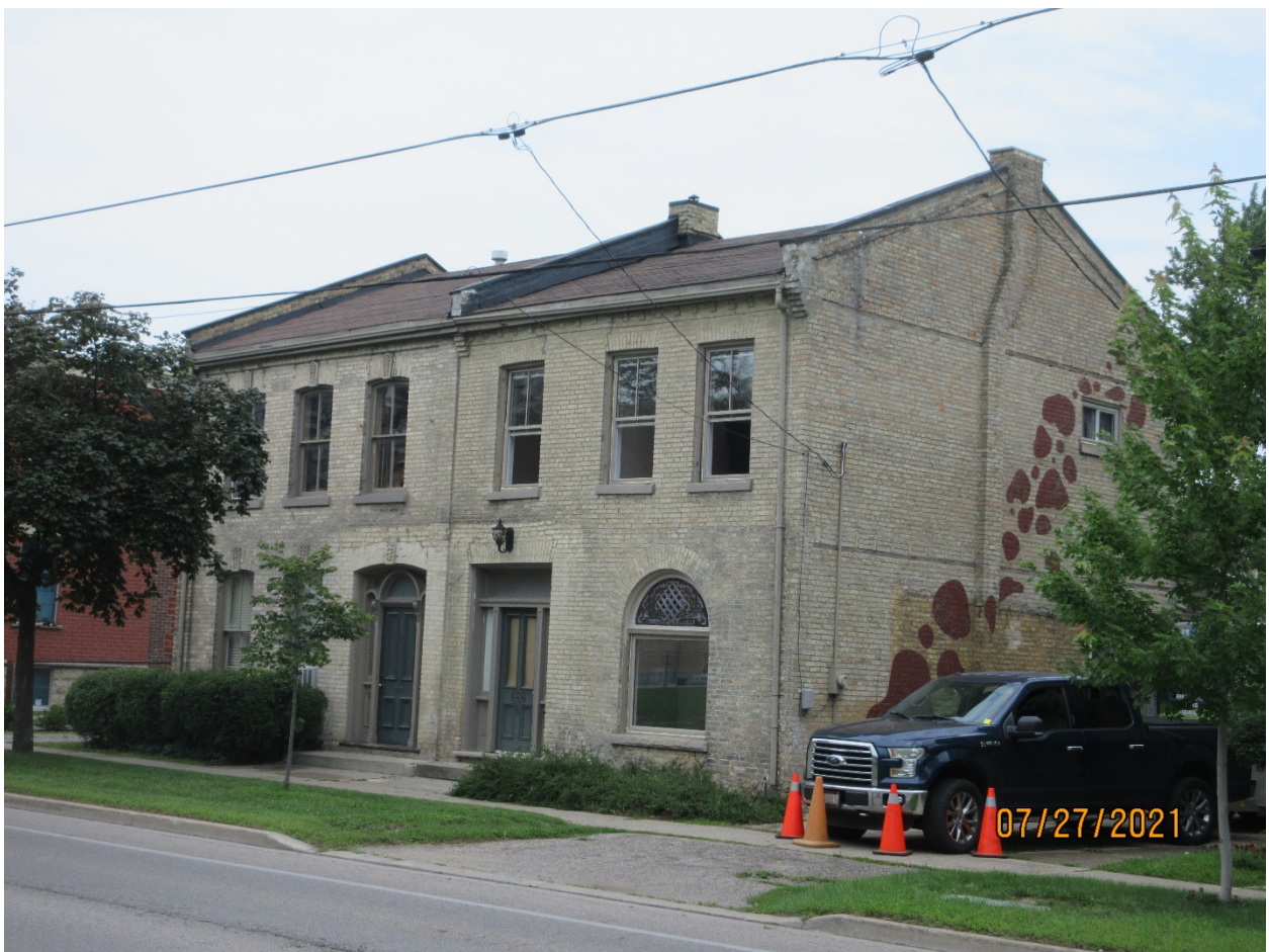
Image 4: Photograph showing the unapproved alterations to the windows at 468 Queens Avenue underway, July 2021.