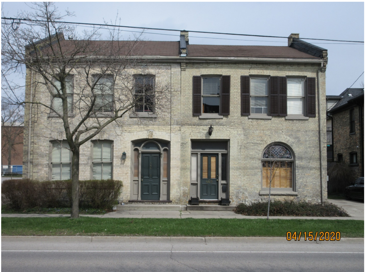
Image 2: Photograph showing the subject properties at 466-468 Queens Avenue, 2020.