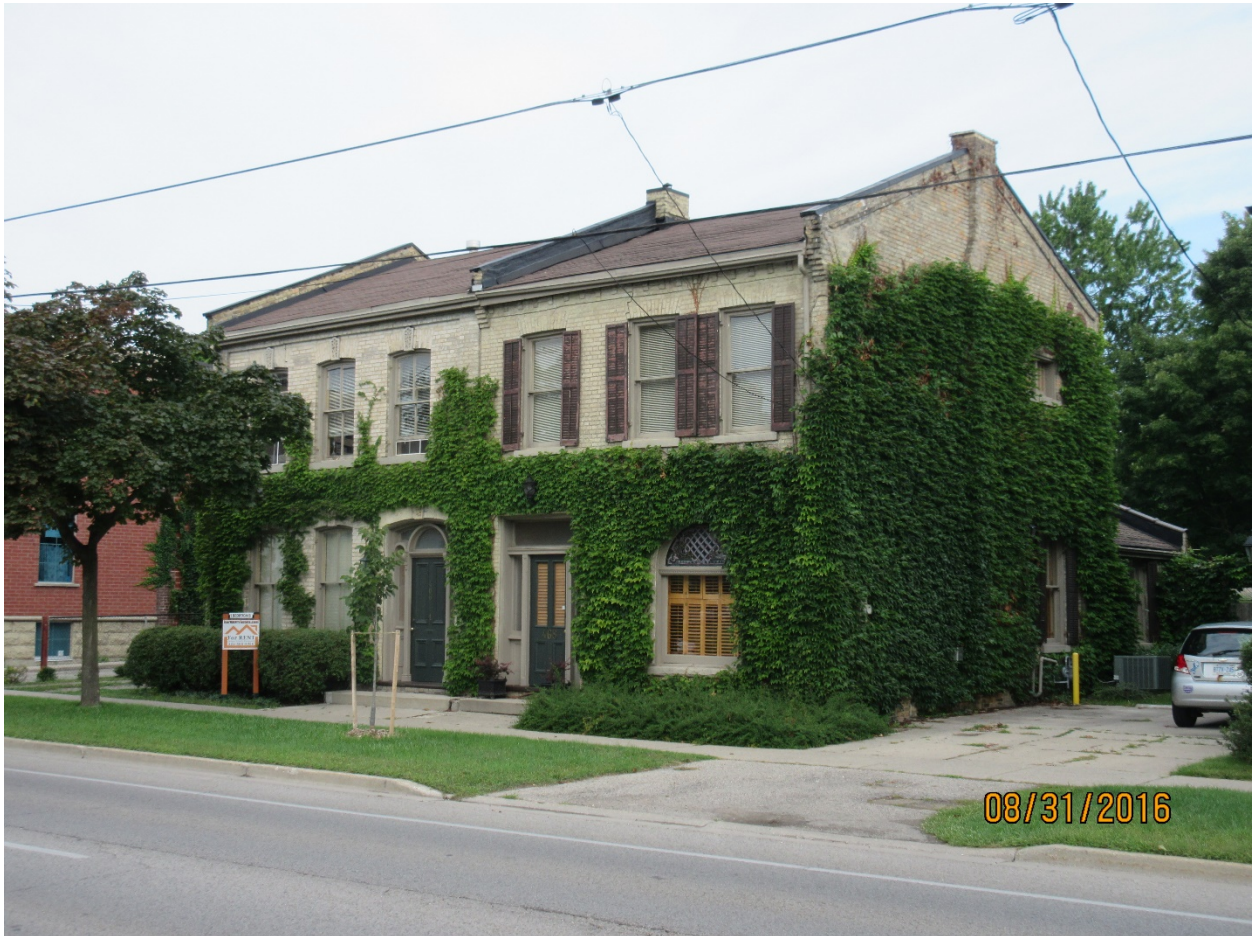
Image 1: Photograph showing the subject properties at 466-468 Queens Avenue, 2016.