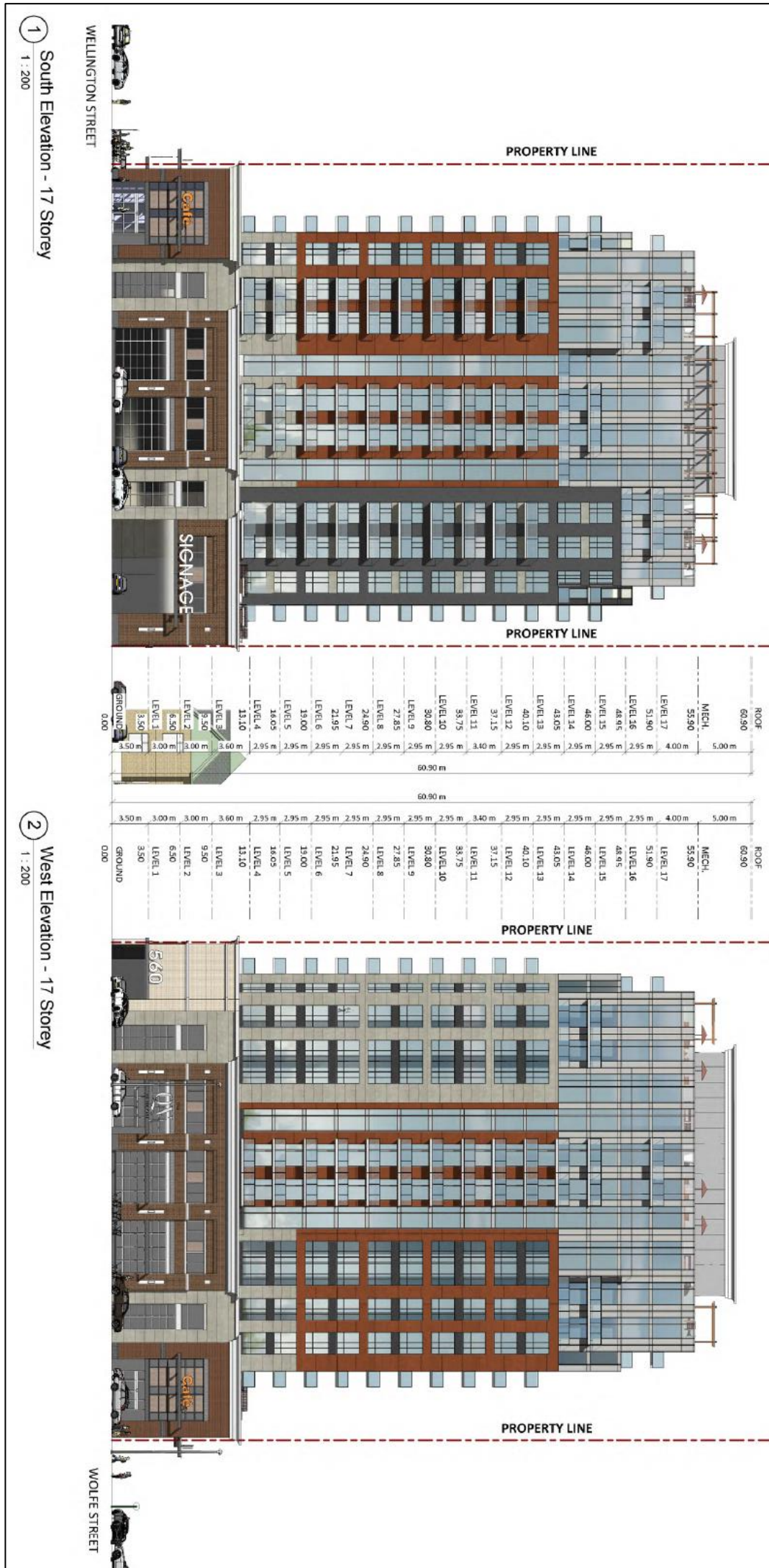
South and West Elevations