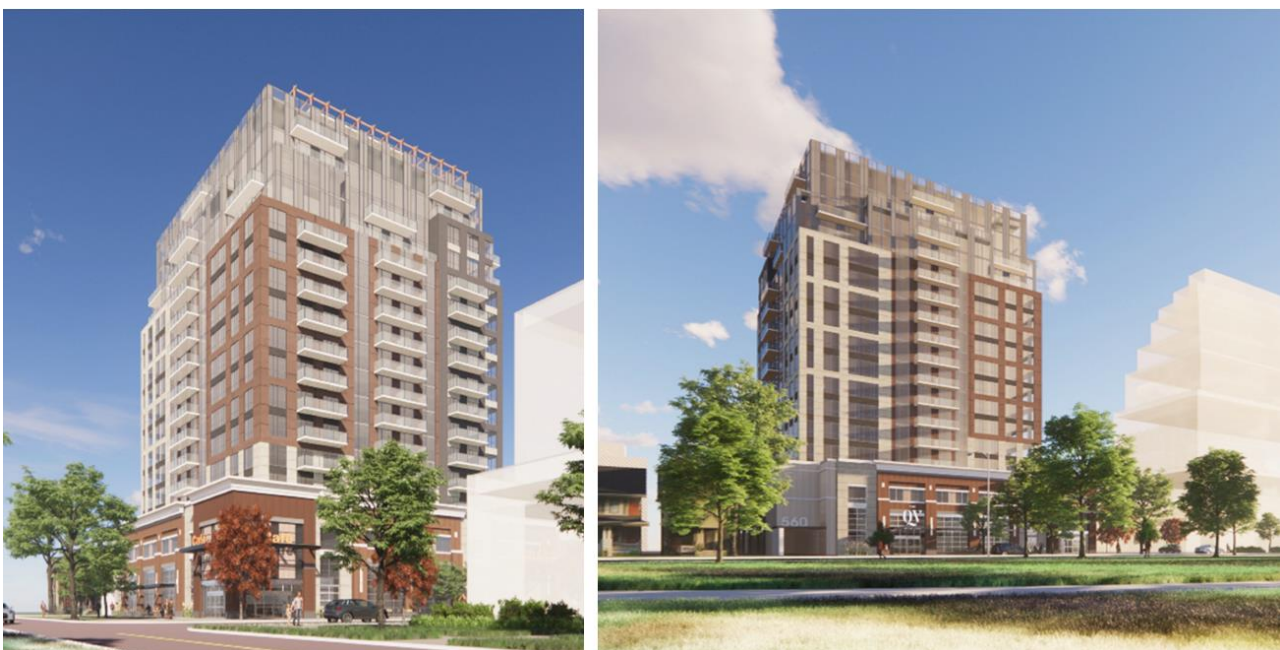
Southwest and West views to Proposed Development (from Victoria Park)

The above image represents the applicant's proposal as submitted and may change.