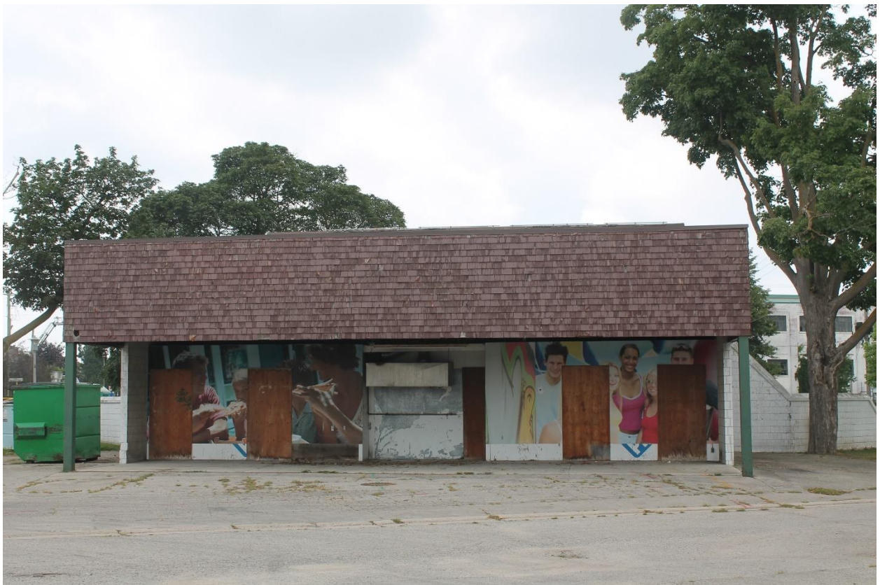
Image 6: Photograph showing the rear (east) side of the Anne Eadie Park Stage.