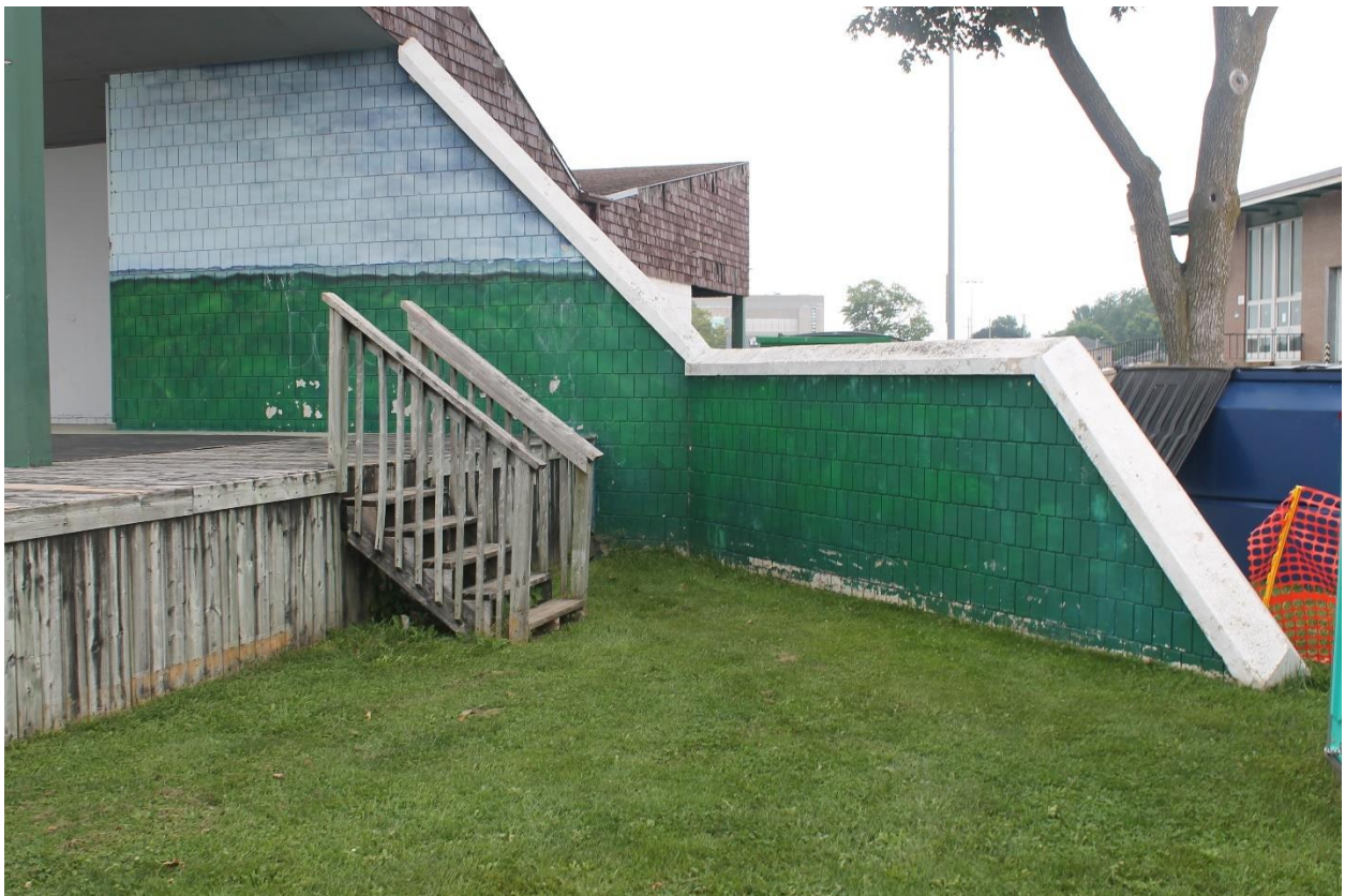
Image 4: Photograph showing the access to the south side of the Anne Eadie Park Stage, 2021.