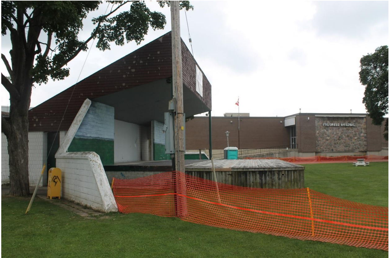
Image 5: Photograph showing the north side of the Anne Eadie Park Stage, 2021. Note, the Progress Building south of the stage is visible at right.