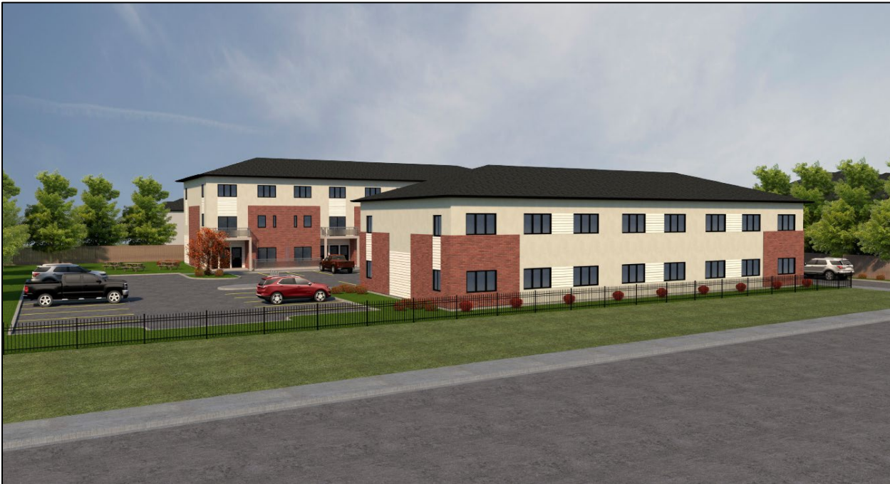
Original rendering – front view