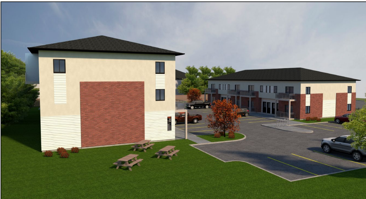
Original Rendering – side view

The above images represent the applicant's proposal as originally submitted and do not reflect design changes noted elsewhere in this notice.