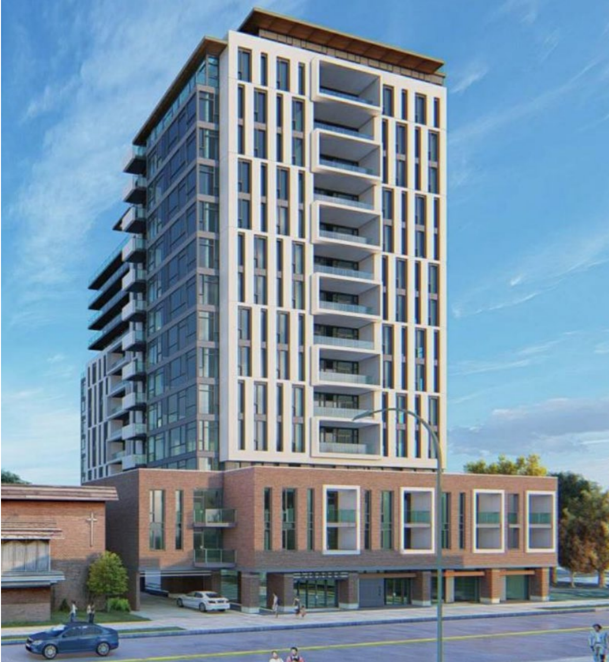
Architectural rendering showing proposed building with view from Dundas Street looking north.

The above images represent the applicant’s proposal as submitted and may change.