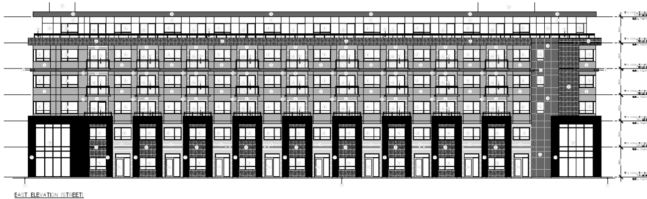
North & East Apartment Building Elevations