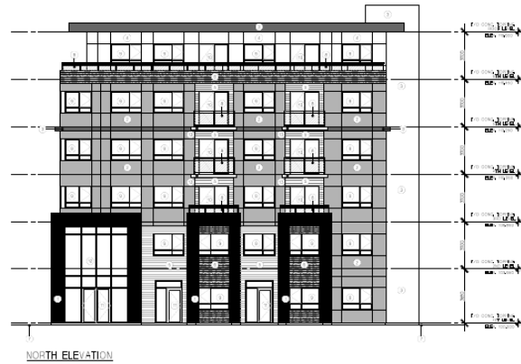
Stacked Townhouse Elevations