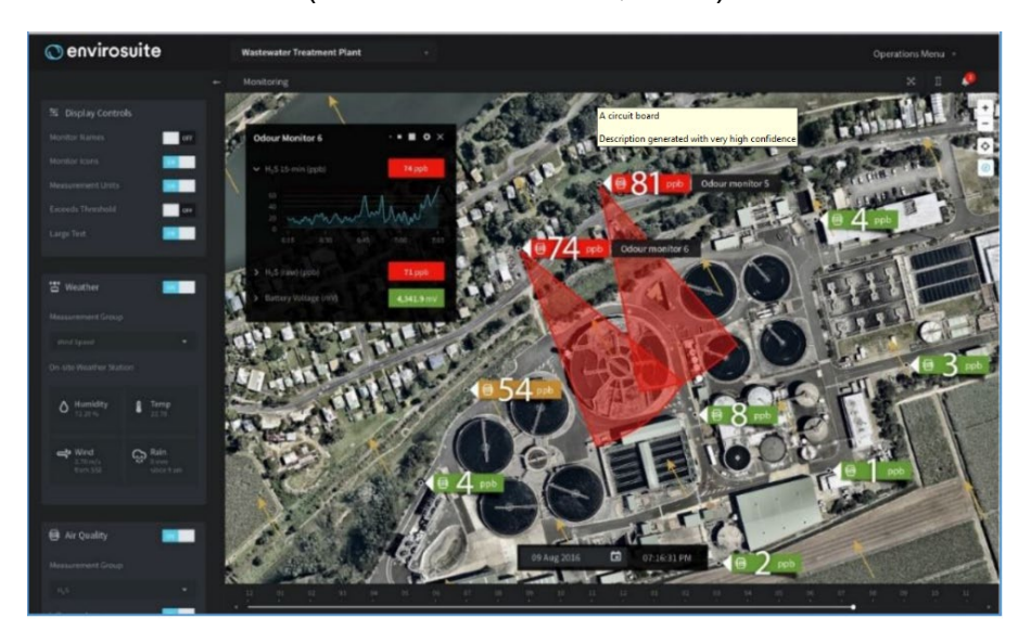
Figure 2 - Example of Real-time Detection of Potential Odour Emissions

If increased levels of hydrogen sulphide and/or odour intensity are detected by one or more of the sensors, the weather station is used to help to determine where the odours may be coming from, as shown in the example in Figure 2.