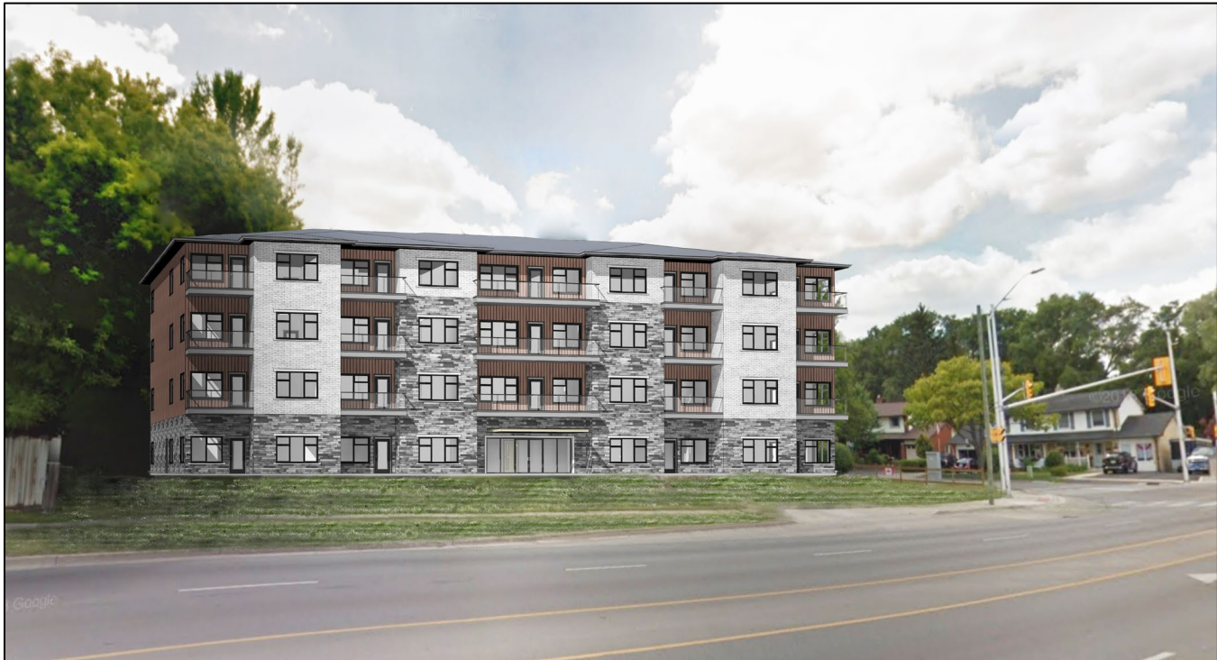
View from Commissioners Road West

The above images represent the applicant's proposal as submitted and may change.