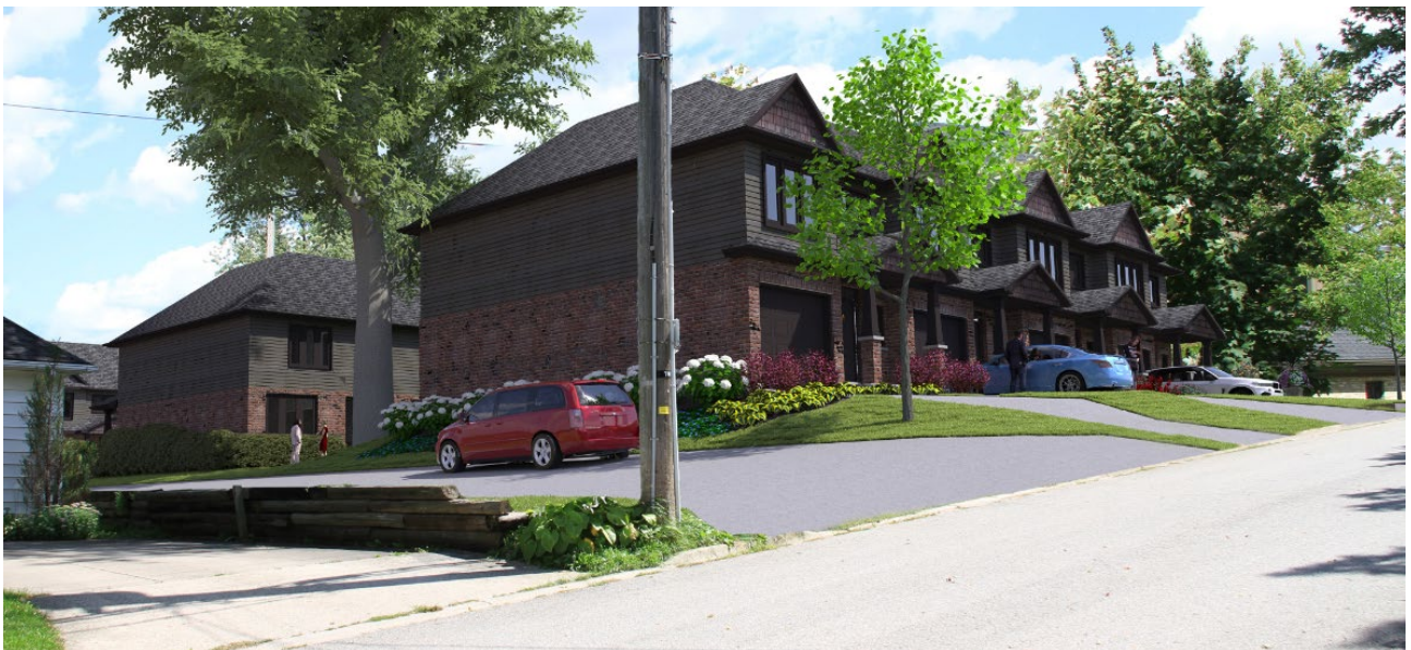
Conceptual Renderings (Front Views)

The above images represent the applicant's proposal as submitted and may change.