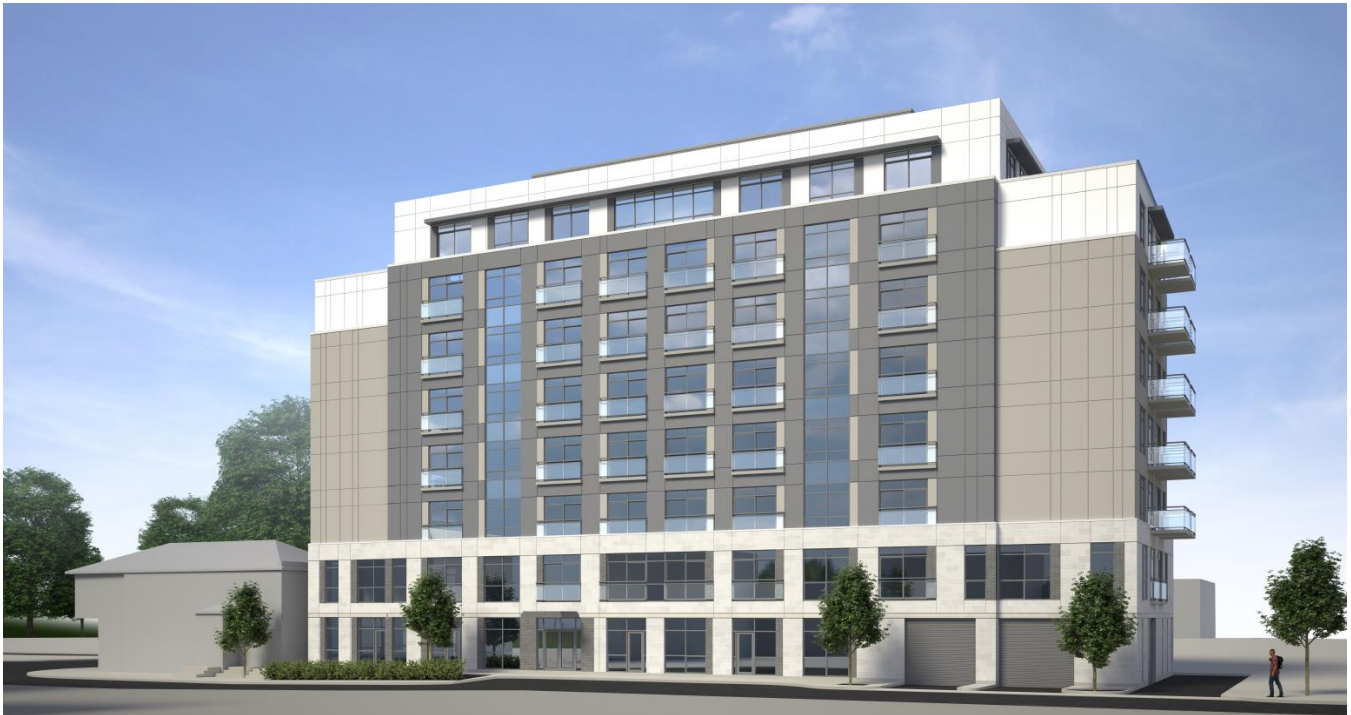
Conceptual Renderings (Front)

The above images represent the applicant's proposal as submitted and may change.