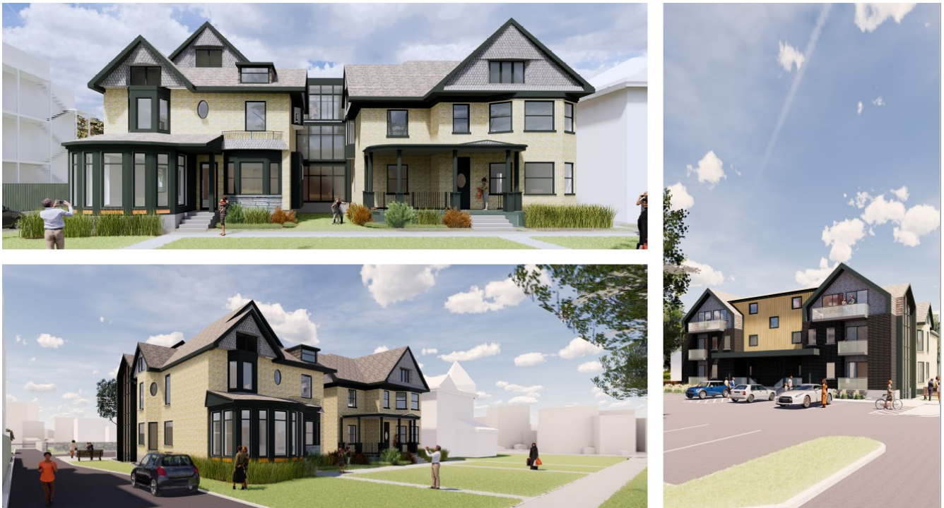
Conceptual Renderings (Front and Rear Views)

The above images represent the applicant's proposal as submitted and may change.