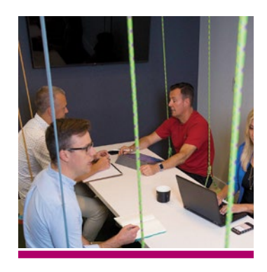
Key focus of this portfolio includes: