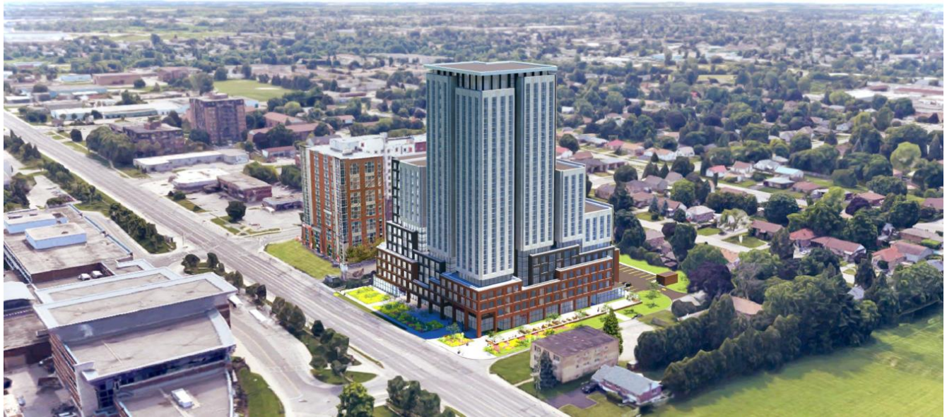
Revised Building Rendering (aerial view)

The above images represent the applicant's proposal as submitted and may change.