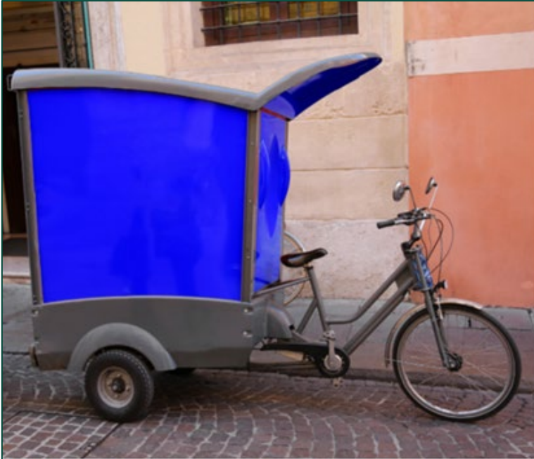
Tricycle cargo e-bike design with enclosed cargo box at the back