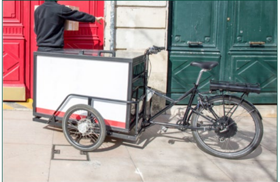
Reverse tricycle design with enclosed cargo box in the front