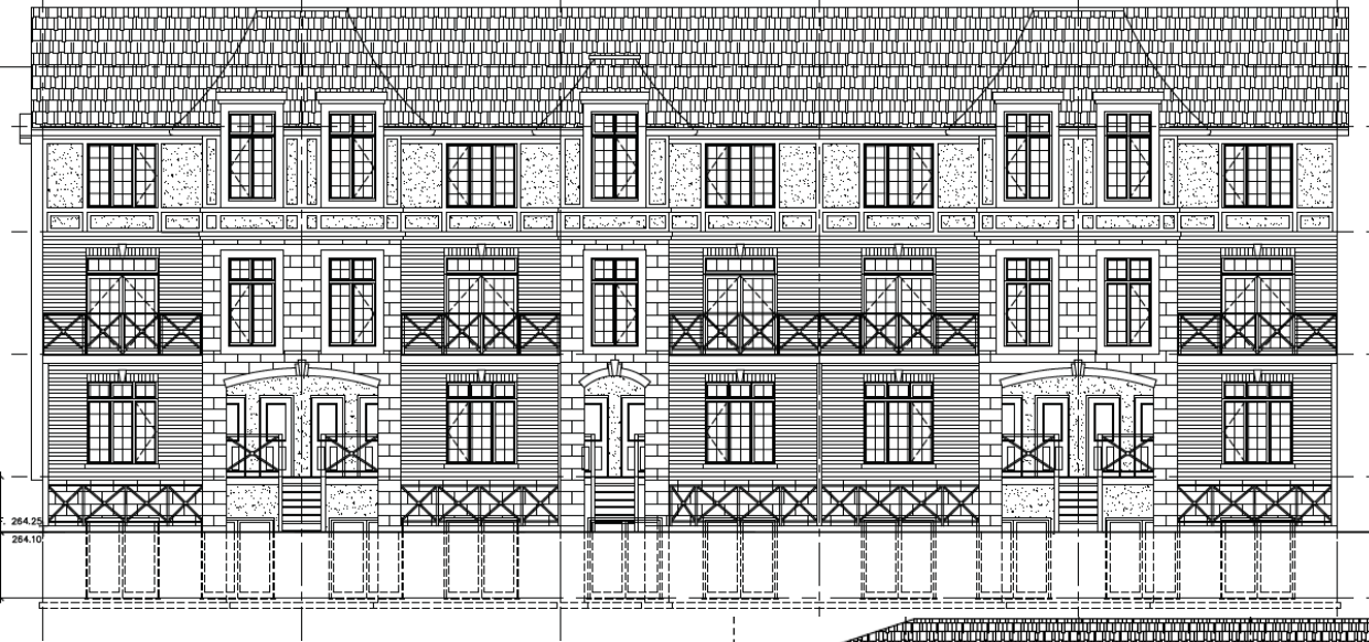
Stacked Back-to-Back Townhouses