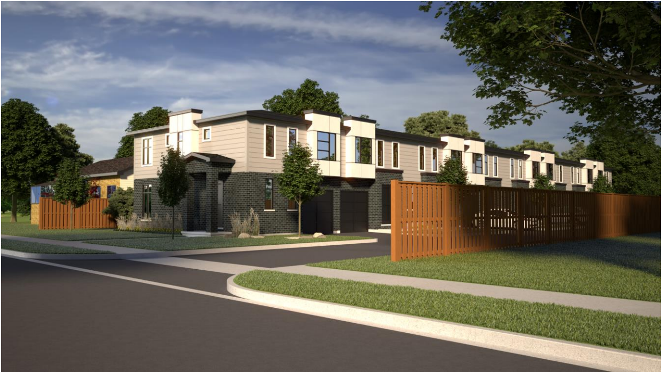
Original rendering – front view from Wethered Street looking northeast