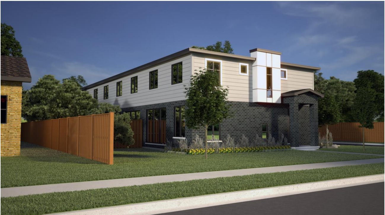
Original rendering – Front view from Wethered Street looking southeast

The above images represent the applicant's proposal as originally submitted and do not reflect recent design changes.