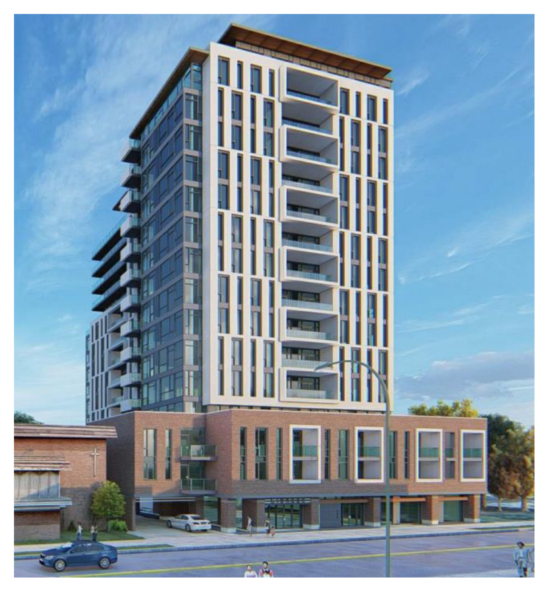
Architectural rendering showing proposed building from Dundas Street.

The above image represents the applicant's proposal as submitted and may change.