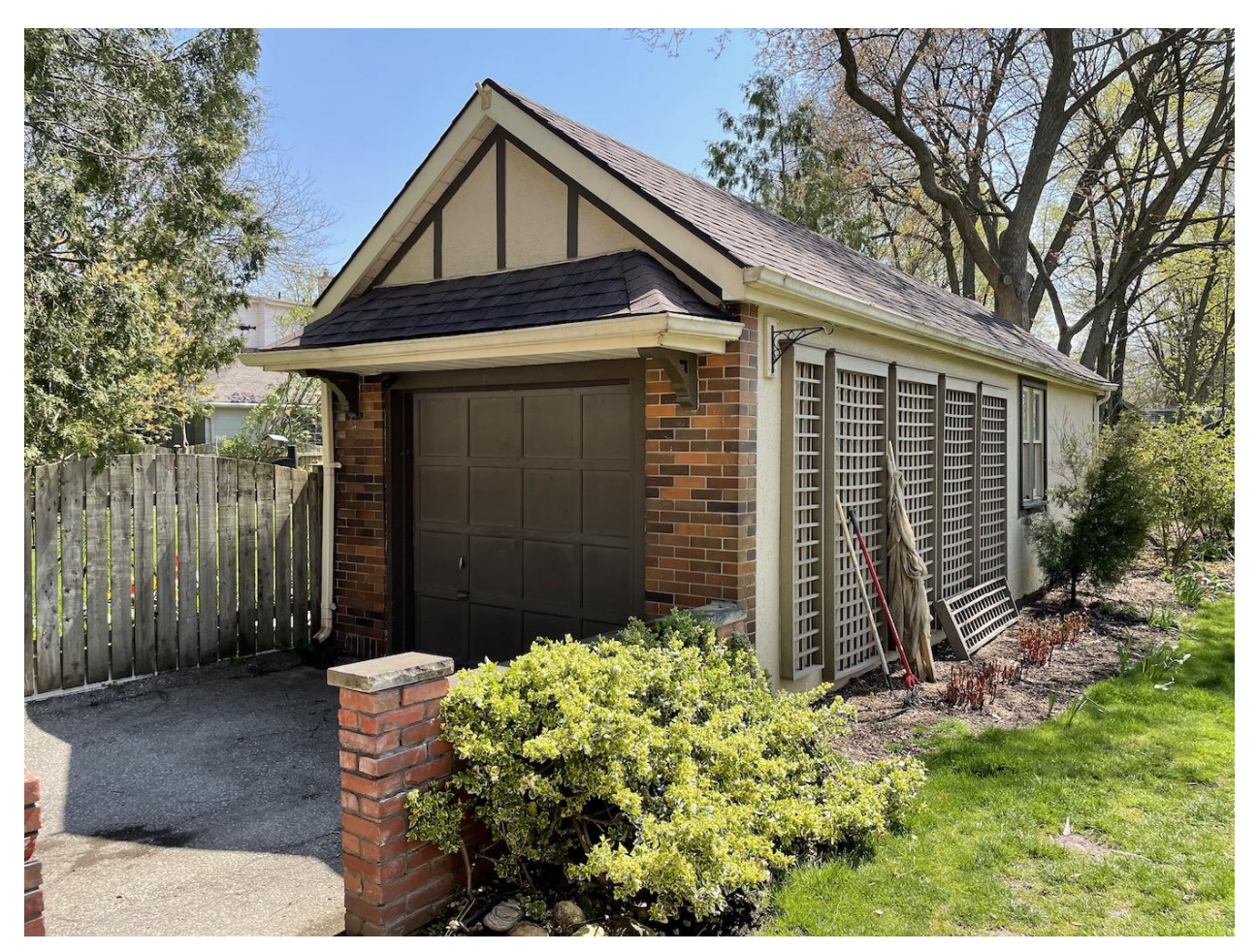
Image 2: Front-side view of detached garage, north-west elevations (April 22, 2021)