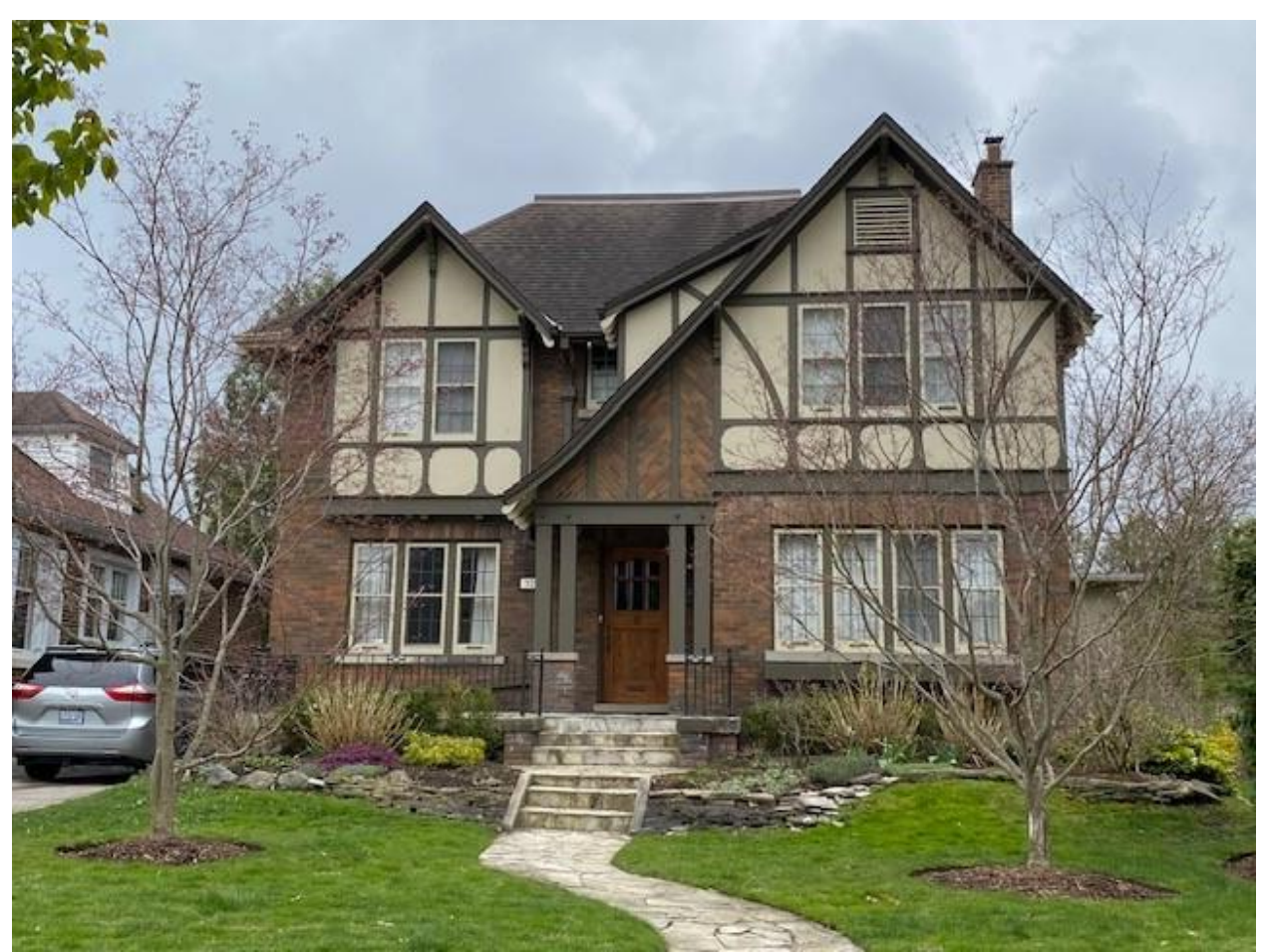
Image 1: Façade of residence at 325 Victoria Street, north elevation (April 22, 2021)