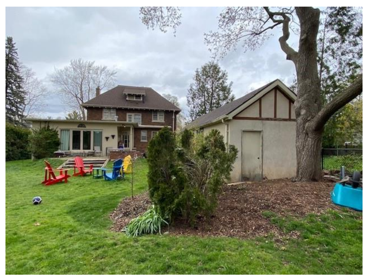
Image 4: Rear view of residence and detached garage, south elevations (April 22, 2021)