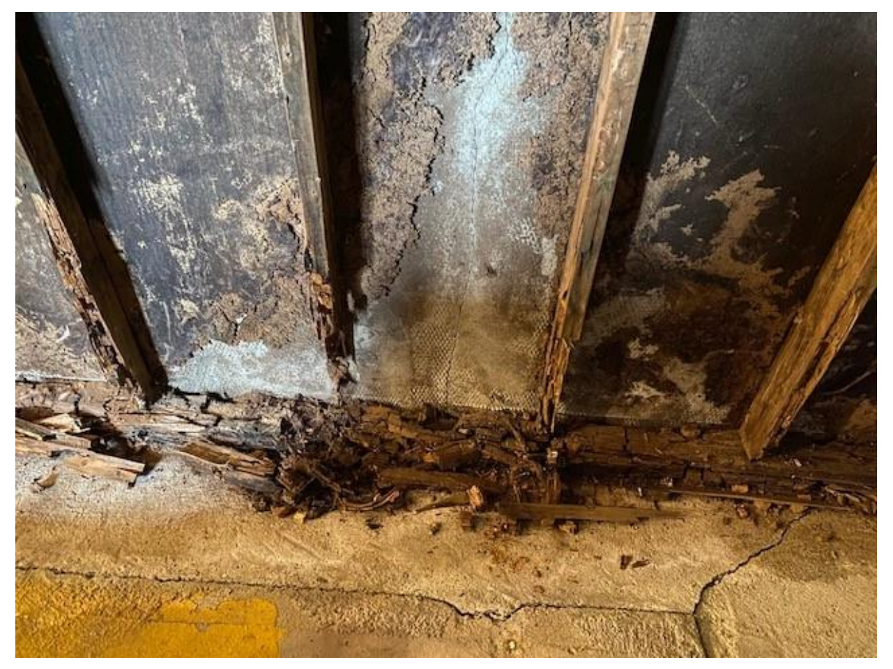
Image 5: Interior view of detached garage showing degradation of wood sill and wall studs (April 22, 2021)