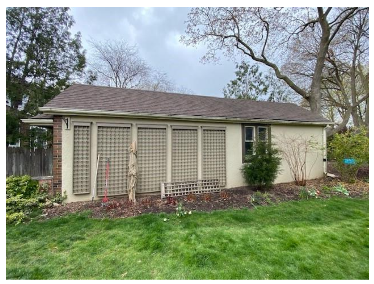
Image 3: Side view of detached garage, west elevation (April 22, 2021)