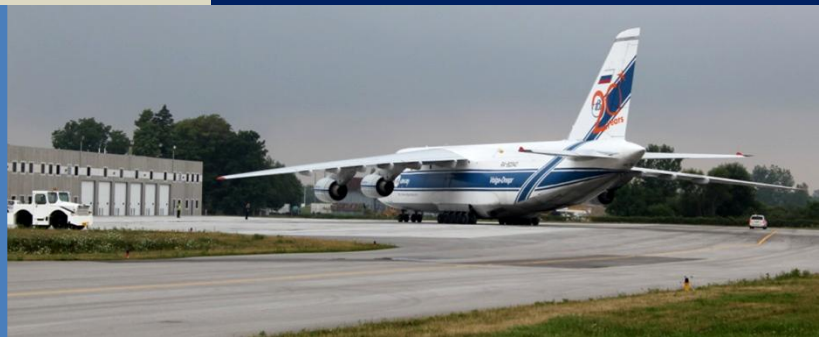
Antonov 124 arrives from its transatlantic flight from Switzerland