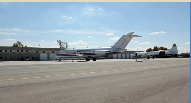
DC 9 and Convair Unloading Their Freight at the new Cargo Complex