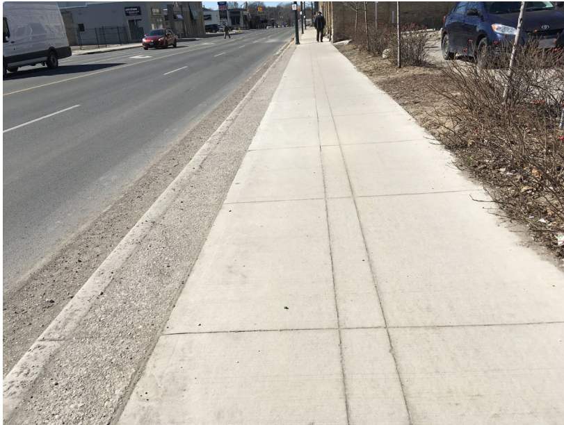
Decorative band along the curb