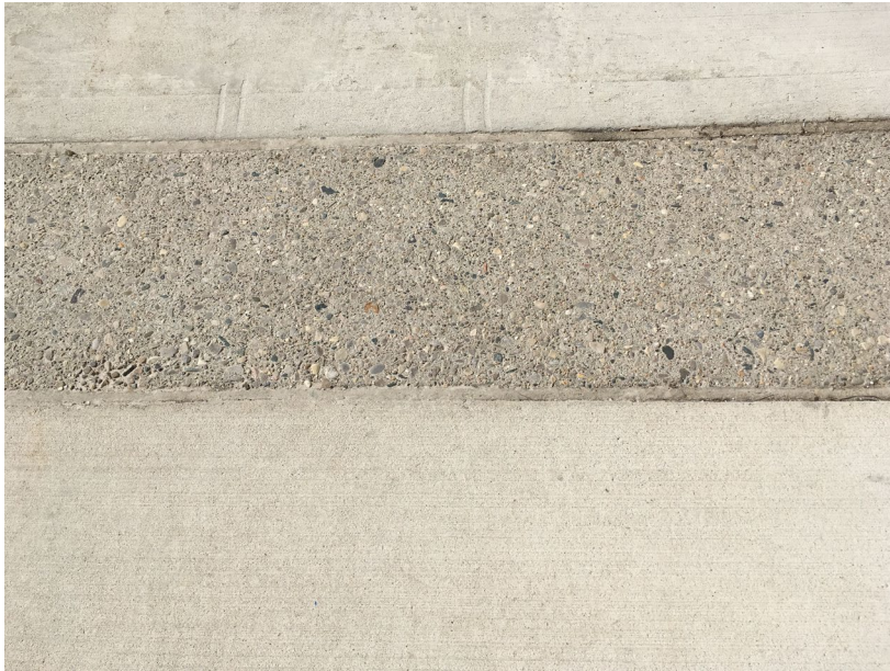
Existing sidewalk conditions on York Street